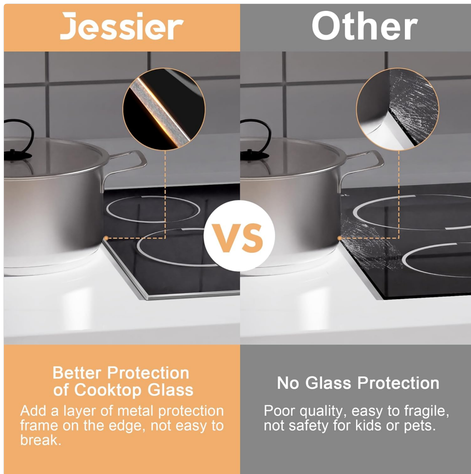
Image: A visual comparison highlighting the metal protection frame on the Jessier cooktop's glass edge, contrasting it with a standard cooktop that lacks this protective feature.