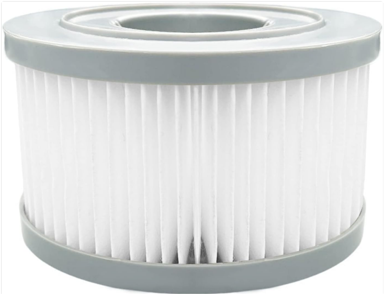
Figure 1: Side view of the replacement HEPA filter, showing its pleated design.