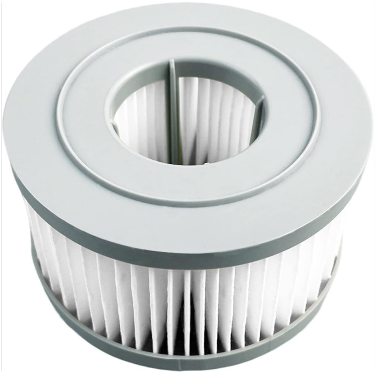
Figure 2: Top view of the replacement HEPA filter, illustrating the central opening for airflow.