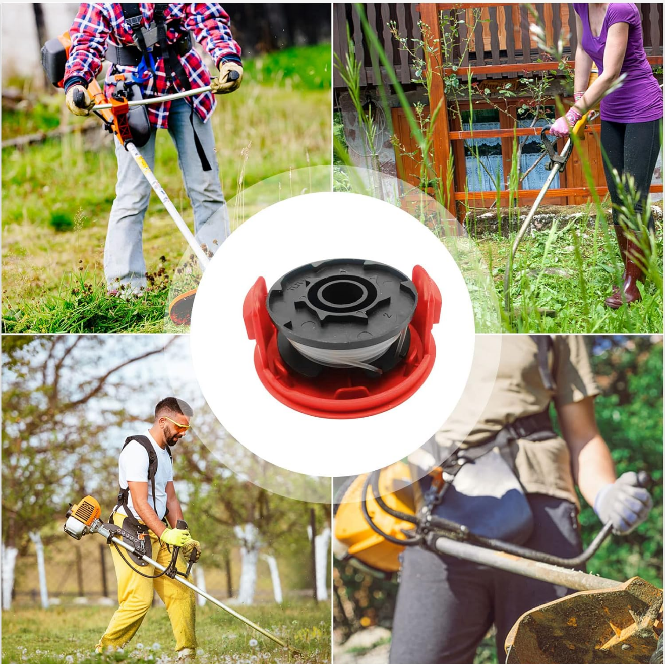
Image: A composite image showing four different individuals actively using string trimmers in various outdoor settings, demonstrating the practical application of the replacement spools in real-world trimming tasks.