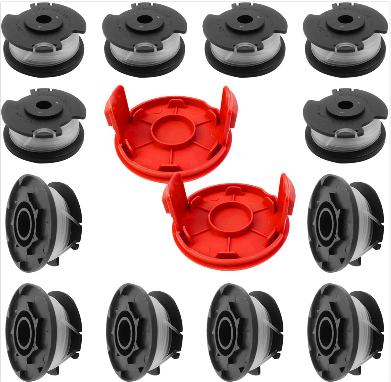
Image: A collection of black replacement trimmer spools, pre-wound with white line, alongside two red replacement caps. This image displays the full contents of the product package.