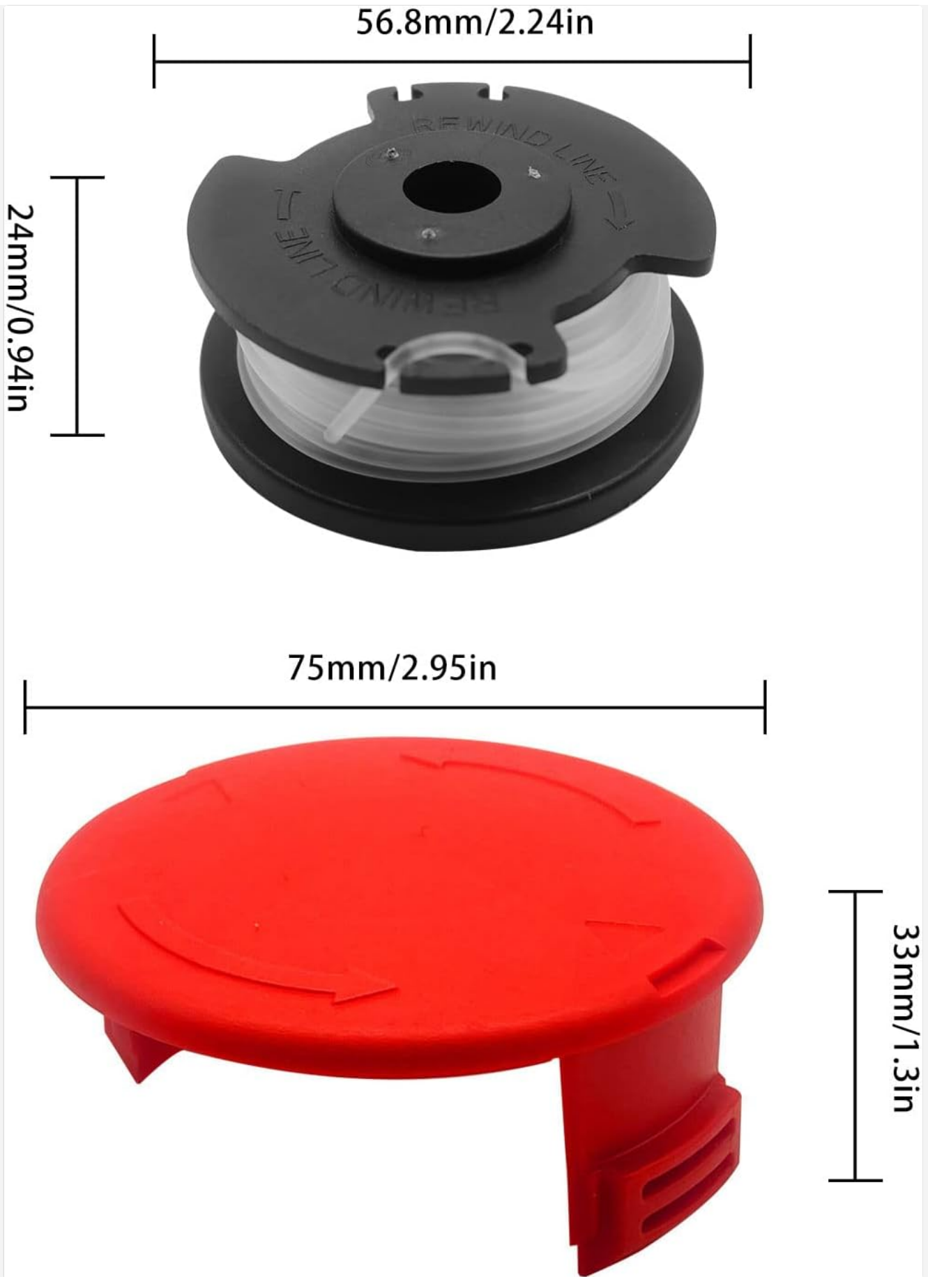
Image: A detailed diagram illustrating the precise measurements of both the replacement trimmer spool and the cap in millimeters and inches, providing clear dimensional specifications.