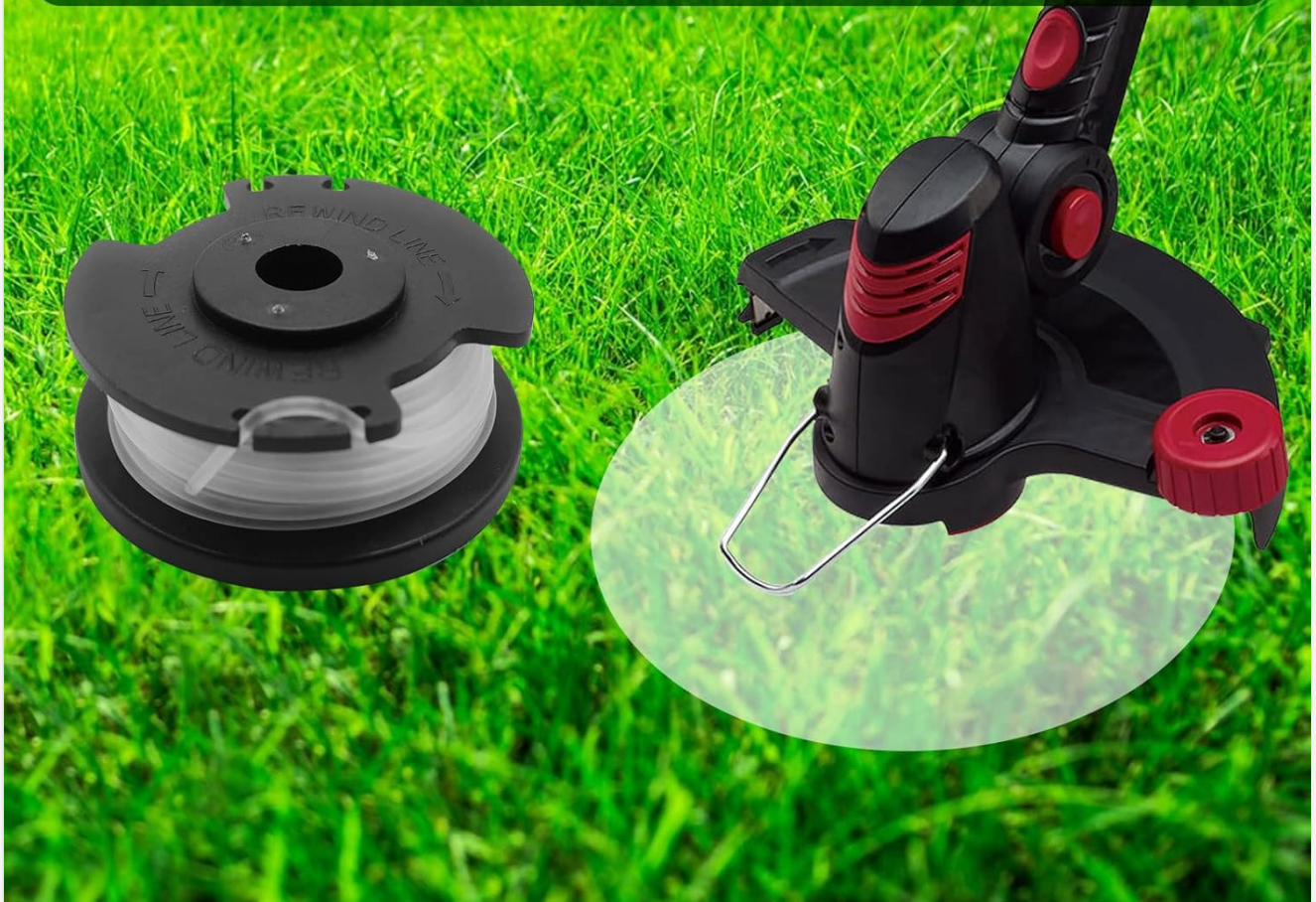
Image: A replacement trimmer spool displayed next to a Hy-per Tough string trimmer, with a superimposed text overlay listing the various compatible Hy-per Tough trimmer models.

Hy-per Tough 4.6-Amp 13in Electric String Trimmer HT21-401-002-04