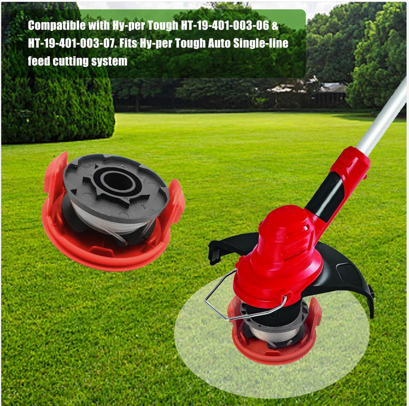
Image: A close-up view of a replacement trimmer spool and cap positioned on a Hy-per Tough string trimmer, set against a vibrant green lawn, demonstrating the product's intended use and compatibility.

Compatible with Hy-per Tough HT-19-401-003-06 & HT-19-401-003-07. Fits Hy-per Tough Auto Single-line feed cutting system