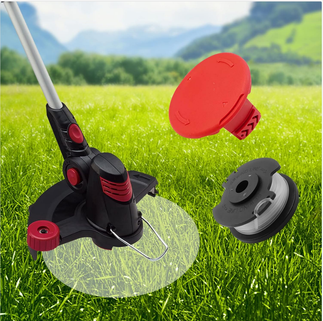
Image: A Hy-per Tough string trimmer with its spool and cap detached, illustrating the components involved in the replacement

The pre-wound auto-feed system replacement spools are designed to simplify this process, eliminating the tedious work of hand-winding.