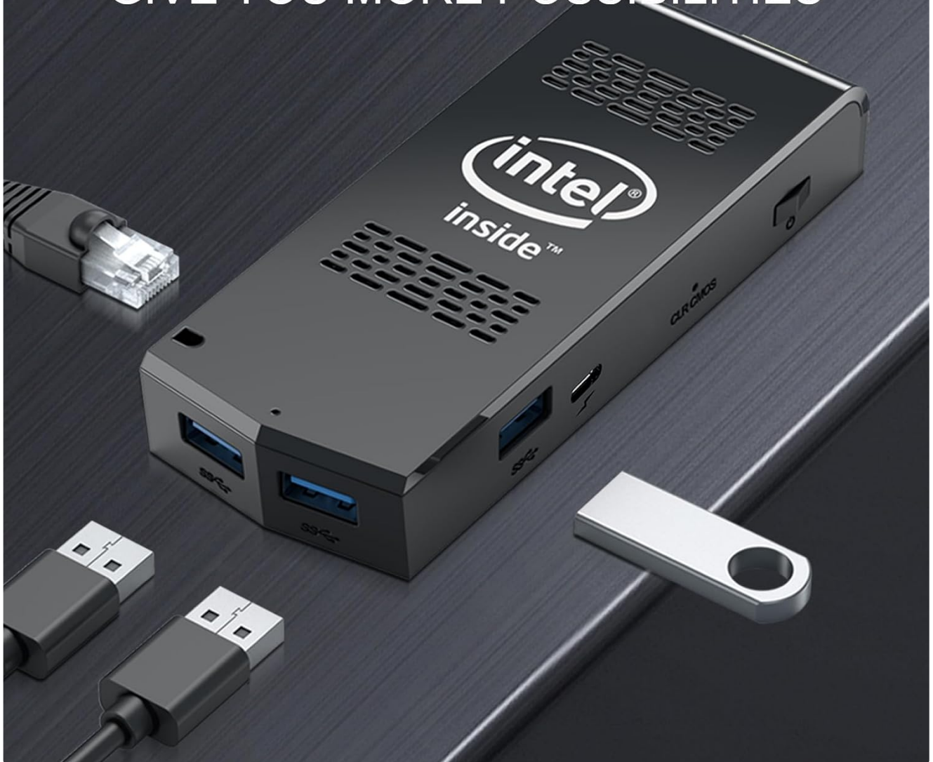
Image: The AIOEXPC Mini PC Stick connected to multiple USB devices, demonstrating its three USB 3.0 ports.