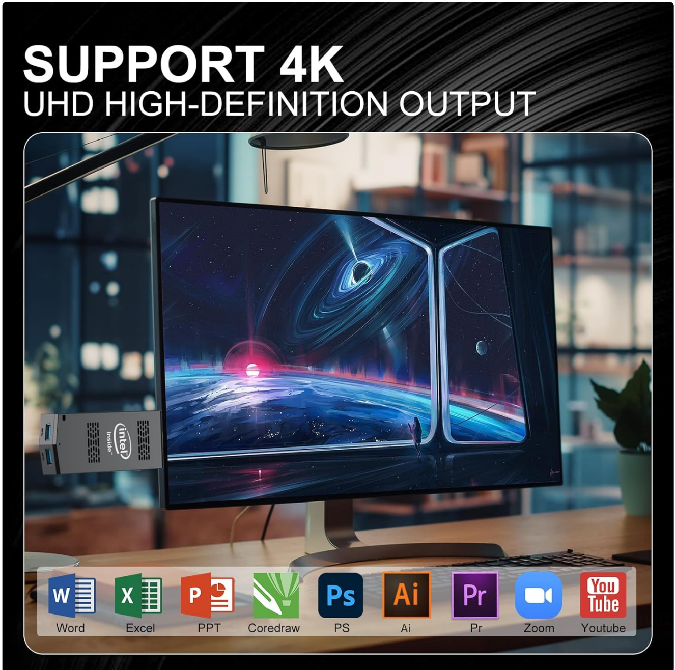
Image: The AIOEXPC Mini PC Stick connected to a monitor displaying 4K UHD content, with icons of various productivity and media applications.

The Mini PC Stick supports 4K Ultra HD resolution output, providing crisp and clear visuals for compatible displays and content. Ensure your display and HDMI cable support 4K resolution for optimal experience.