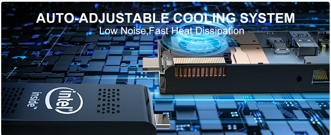
Image: An illustration showing the internal auto-adjustable cooling system of the Mini PC Stick, emphasizing fast heat dissipation and long service life.