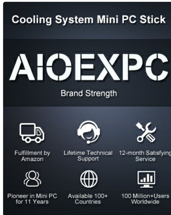
Image: A graphic detailing customer service support options, including email and Amazon order support.

Alternatively, you can log in to your Amazon account, navigate to 'Your Orders', and ask a product question directly from there.