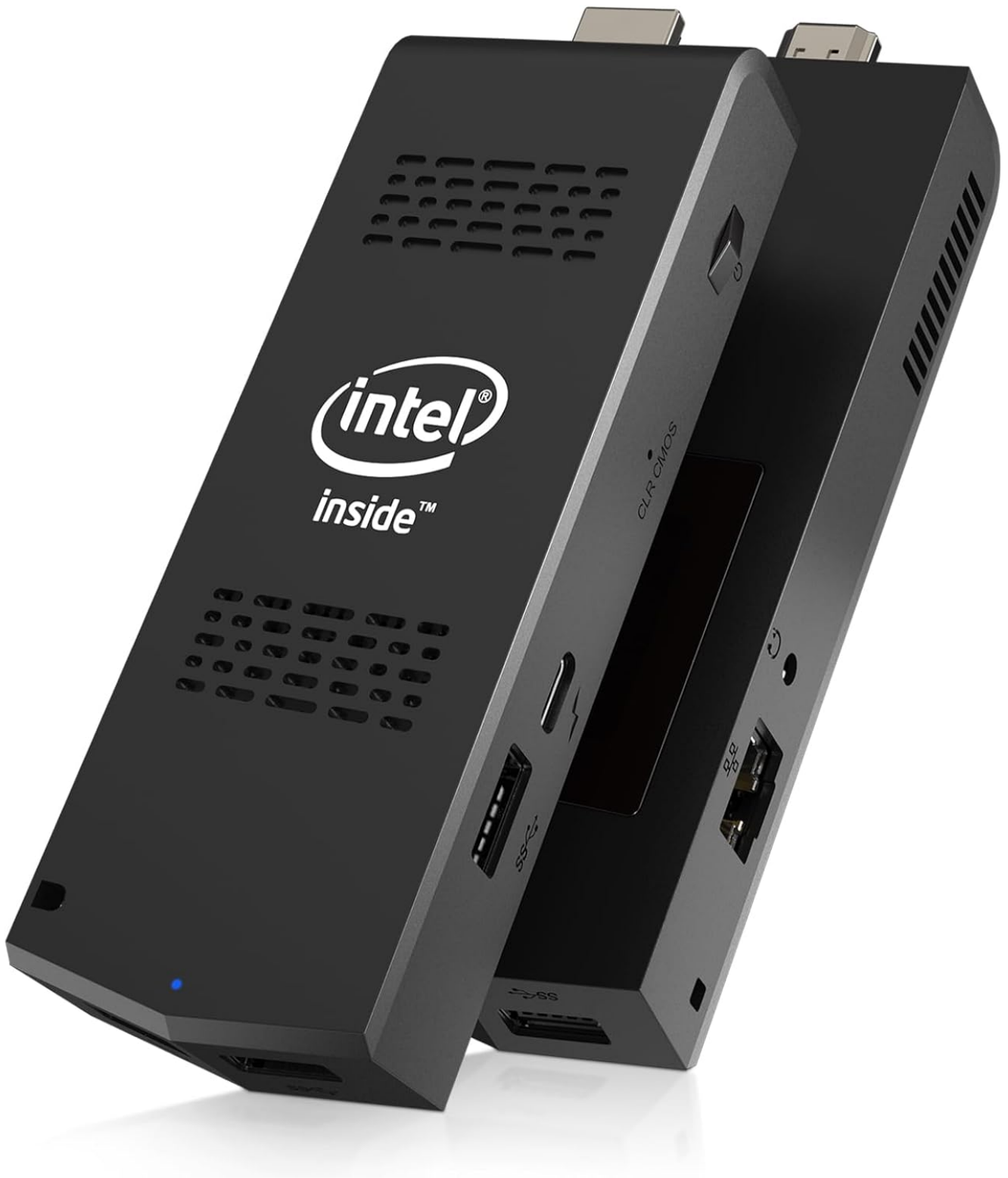
Image: The AIOEXPC Mini PC Stick, a compact black device with an 'Intel inside' logo, shown from an angled perspective.