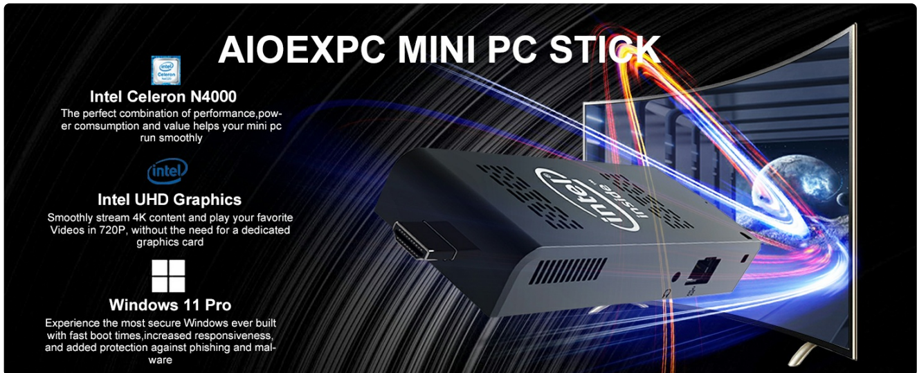
Image: An illustration highlighting the Intel Celeron N4000 processor, Intel UHD Graphics, and Windows 11 Pro operating system of the Mini PC Stick.