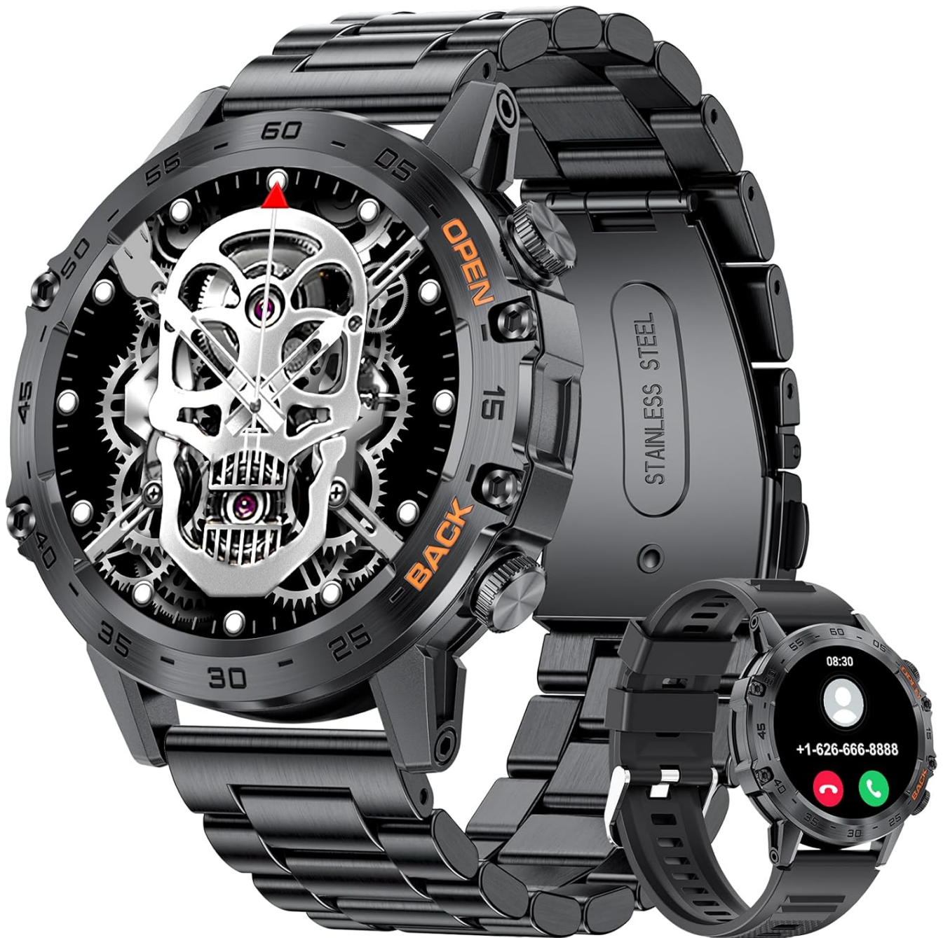
Image: The SUNKTA Military Smart Watch, showcasing its robust design and included strap options.