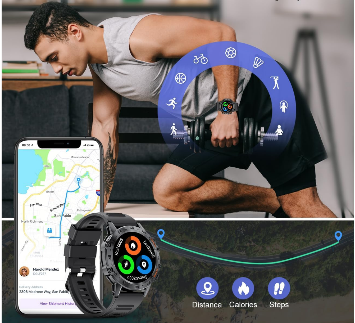
Image: The smartwatch tracking a workout, highlighting its multiple sports modes and fitness data.

The Men's Smartwatch has 21 built-in exercise modes to suit different training needs and provide you with the training data you need.