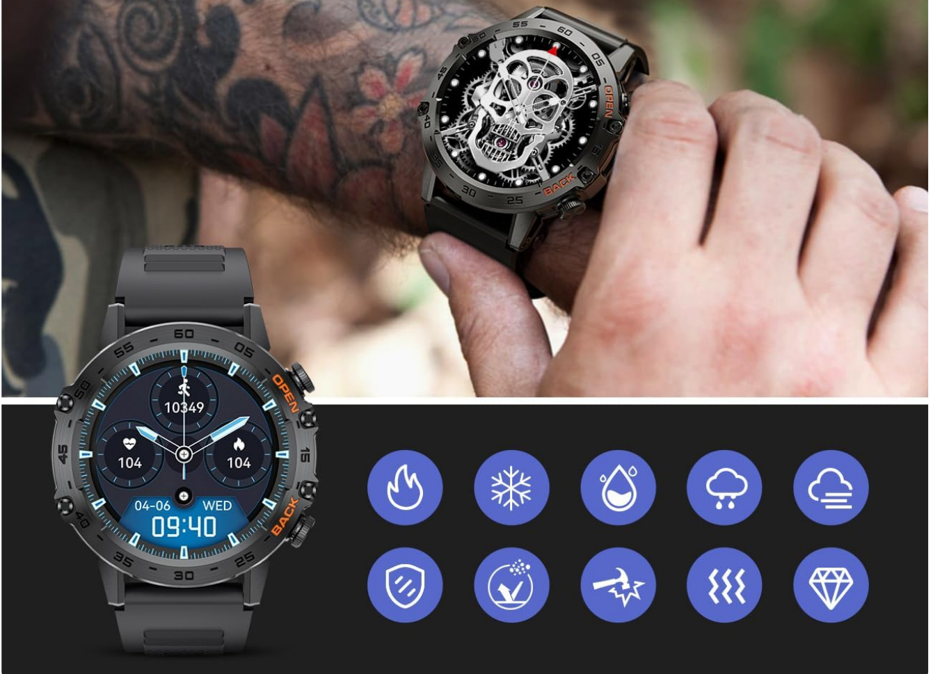
Image: Overview of the smartwatch's health monitoring capabilities, including sleep tracking and vital signs.

Rigorously manufactured to outdoor standards, it has passed high and low temperature, acid and salt spray tests, as well as 15 other standard military tests. Whether it's a polar glacier or a tropical rainforest, it will help you tackle all kinds of tough environments and challenges and explore the wilderness.