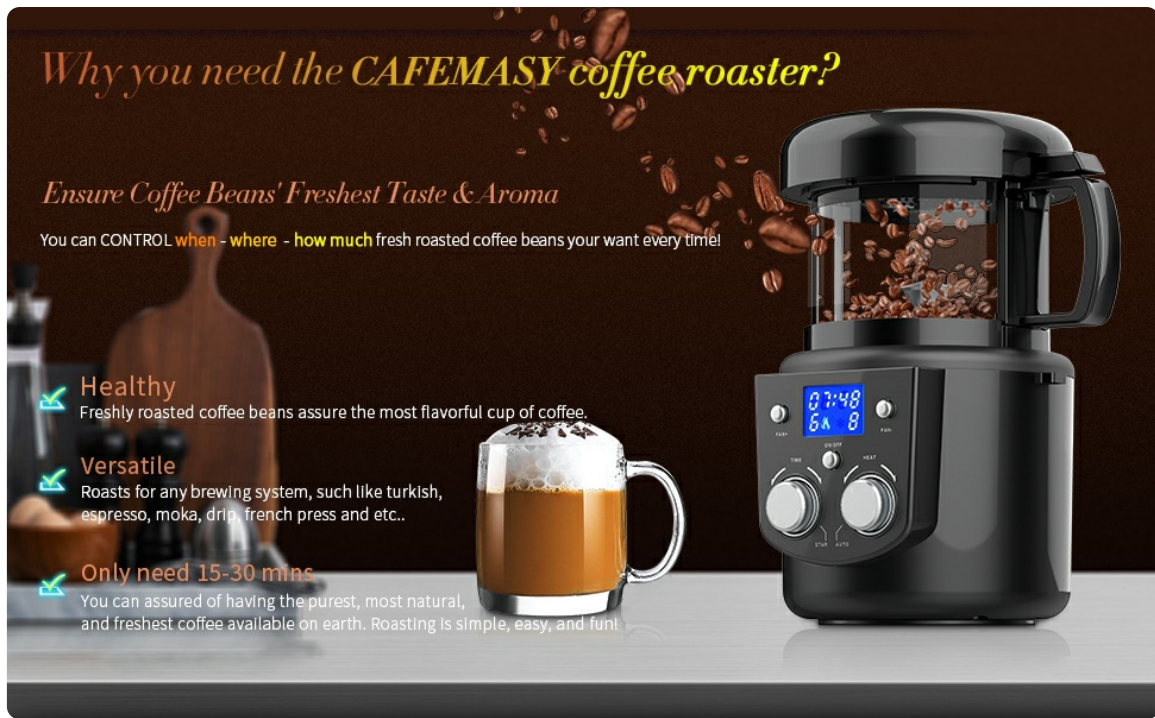
Figure 3.1: Visual guide for assembling the CAFEMASY Coffee Bean Roaster.