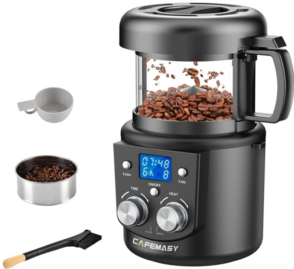
Figure 2.1: CAFEMASY Coffee Bean Roaster Machine and included accessories.