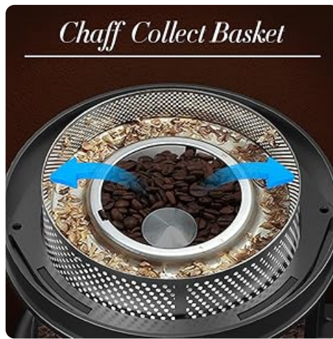
Figure 5.1: The chaff collection basket, designed for easy removal and cleaning.