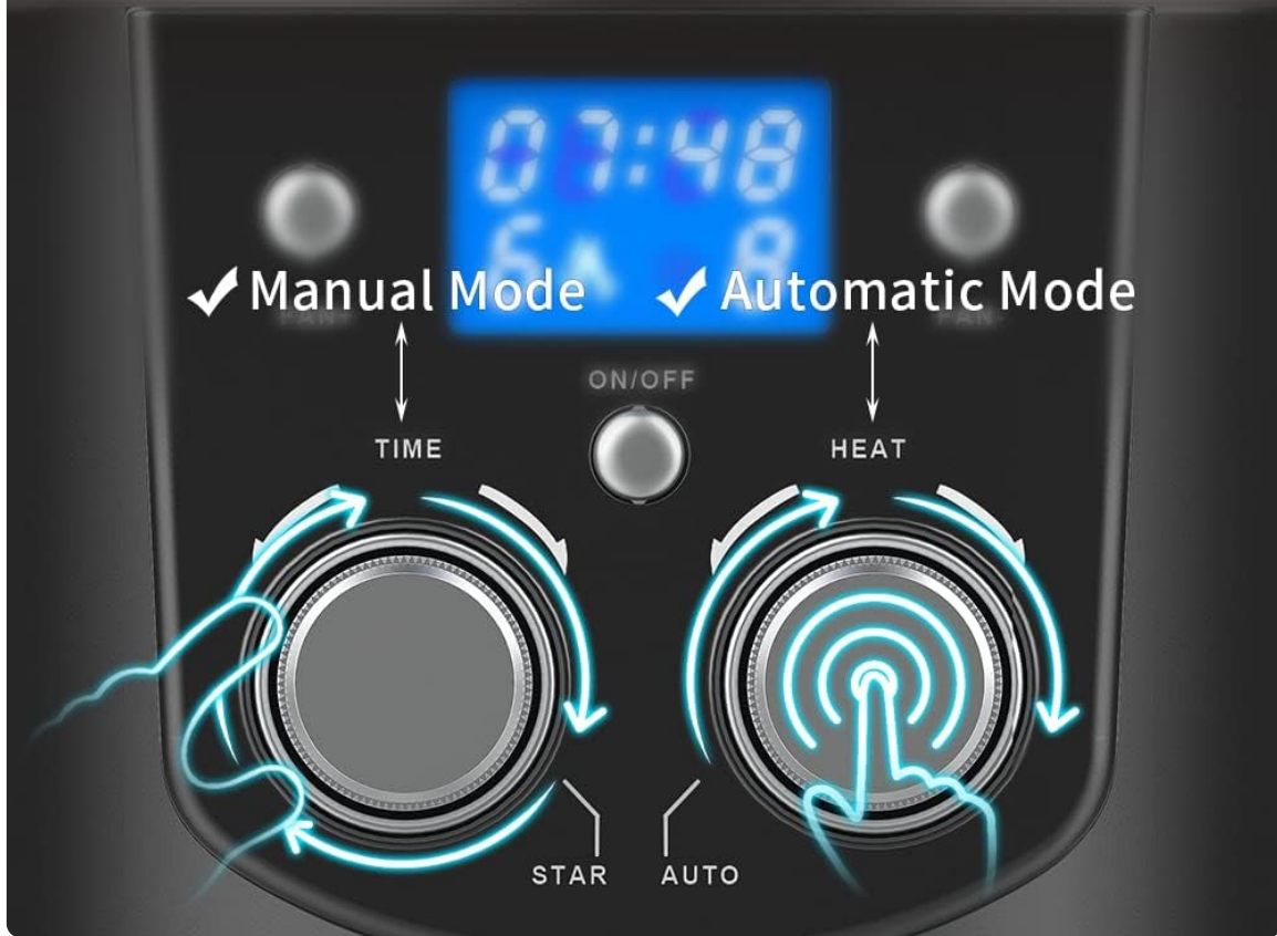
Figure 4.1: Control panel highlighting the two roasting modes.