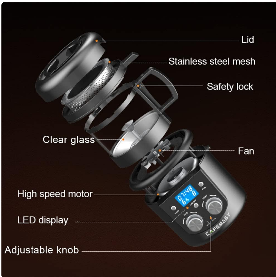
Figure 2.2: Exploded view showing the lid, stainless steel mesh, safety lock, clear glass roasting jar, fan, high-speed motor, LED display, and adjustable knobs.