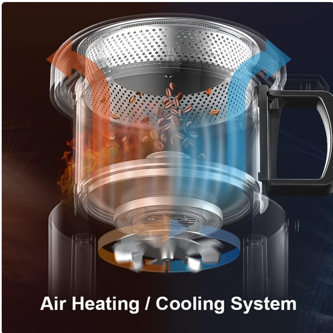
Figure 4.5: Visual representation of the air heating and cooling airflow within the roaster.