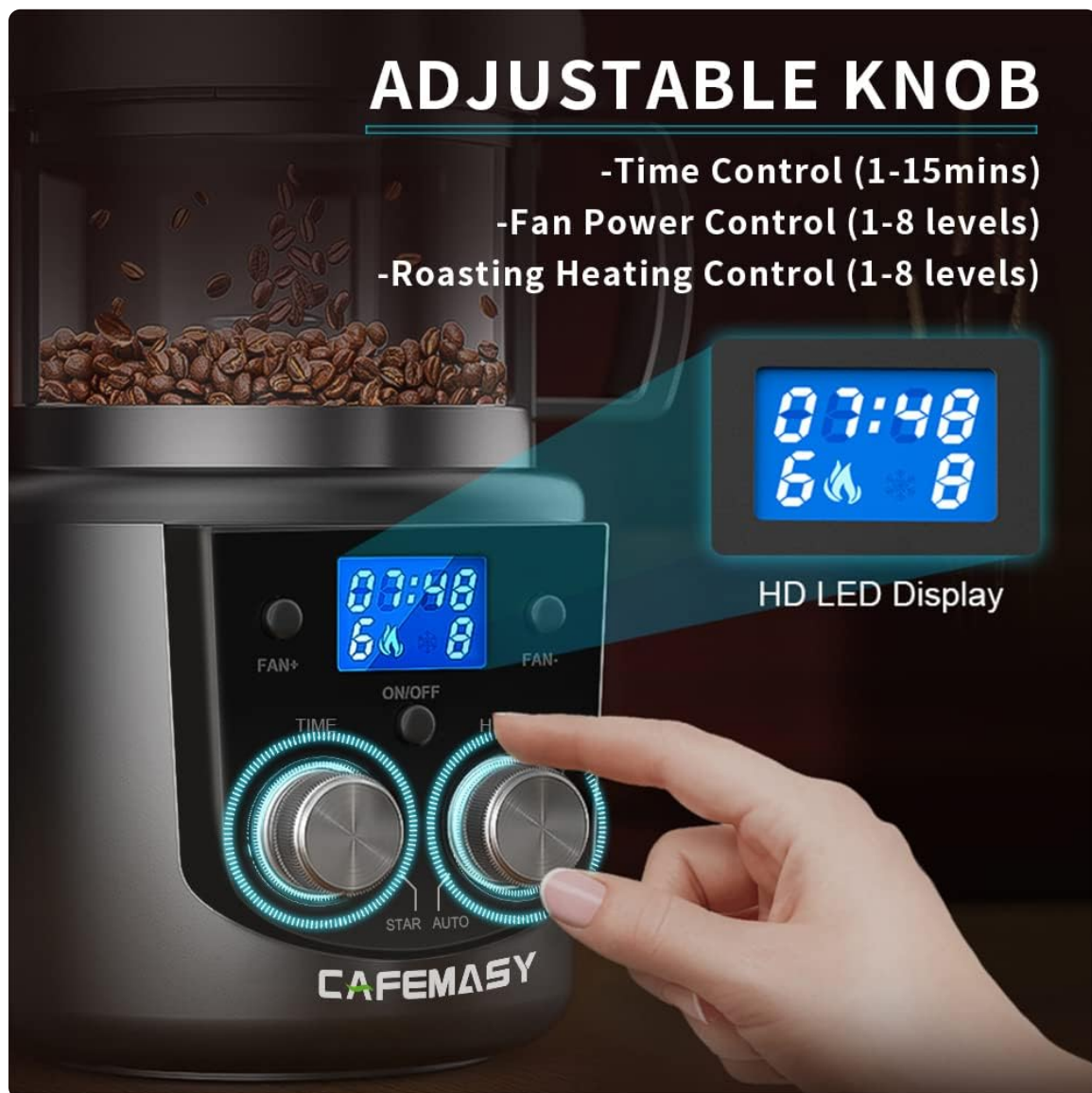
Figure 4.3: Close-up of the control panel showing adjustable knobs and LED display for precise control.