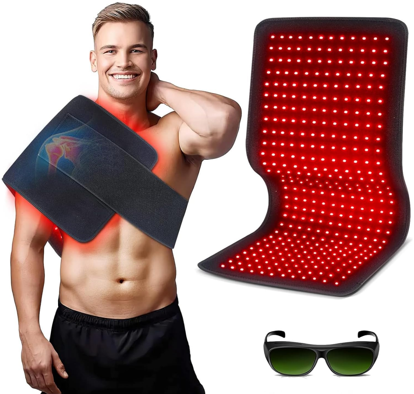
Image: The Astarexin Red Light Therapy Pad, shown in its full form and being used on a person's shoulder, highlighting its flexible design and the included protective glasses.