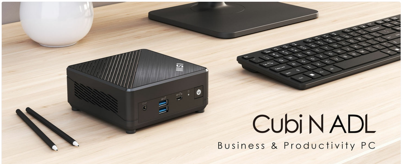
Image: The MSI Cubi N ADL Mini PC set up on a desk, highlighting its compact design suitable for business and productivity environments.

The MSI Cubi-N-ADL is a compact and versatile mini PC designed for various computing needs, offering a space-saving solution without compromising performance. It features Intel Processor N200 or N100 options for powerful processing, flexible storage with M.2 SSD and 2.5" HDD/SSD support, and extensive connectivity including USB, HDMI, and DisplayPort for up to three external displays. Enhanced security is provided through TPM support (dTPM 2.0). This mini PC is an ideal choice for both personal and business use, combining compact design, strong performance, flexible storage, extensive connectivity, and enhanced security features.