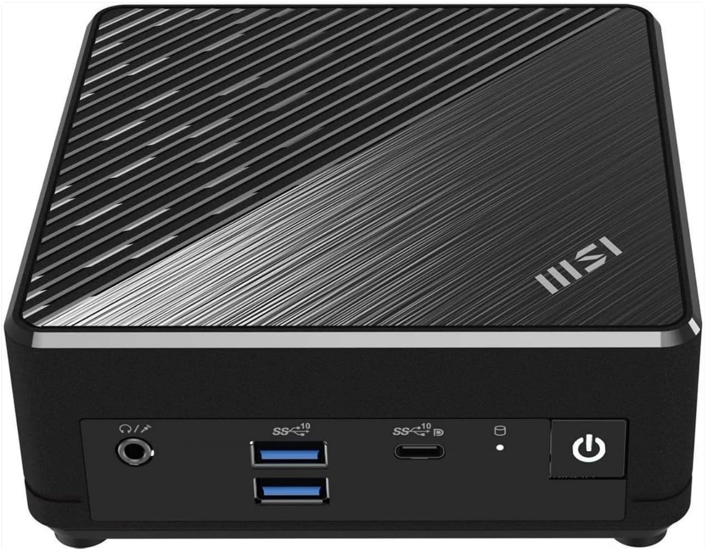
Image: Front view of the MSI Cubi N ADL Mini PC, displaying the power button, USB ports, and audio jack.