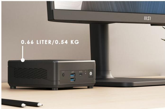
Image: The compact size of the MSI Cubi N ADL Mini PC, indicating its volume (0.66 Liter) and weight (0.54 KG).