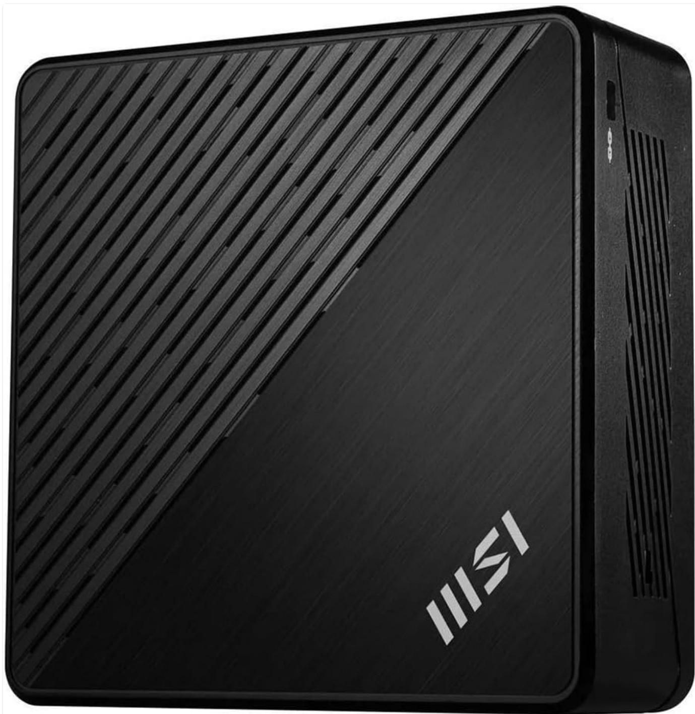
Image: Side view of the MSI Cubi N ADL Mini PC, showcasing its compact form factor.