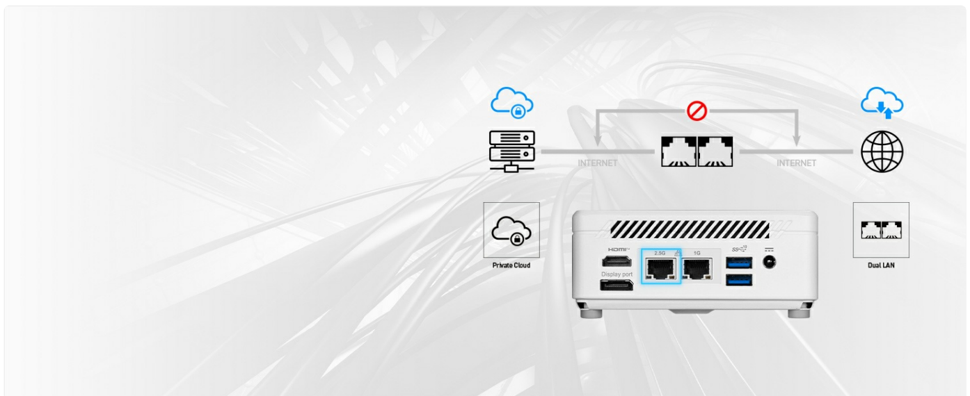
Image: Diagram illustrating the dual LAN ports, enabling flexible network configurations such as private cloud access or internet connection.