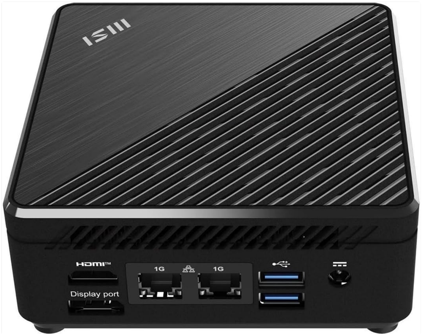
Image: Rear view of the MSI Cubi N ADL Mini PC, showing the HDMI, DisplayPort, Ethernet, and additional USB ports.