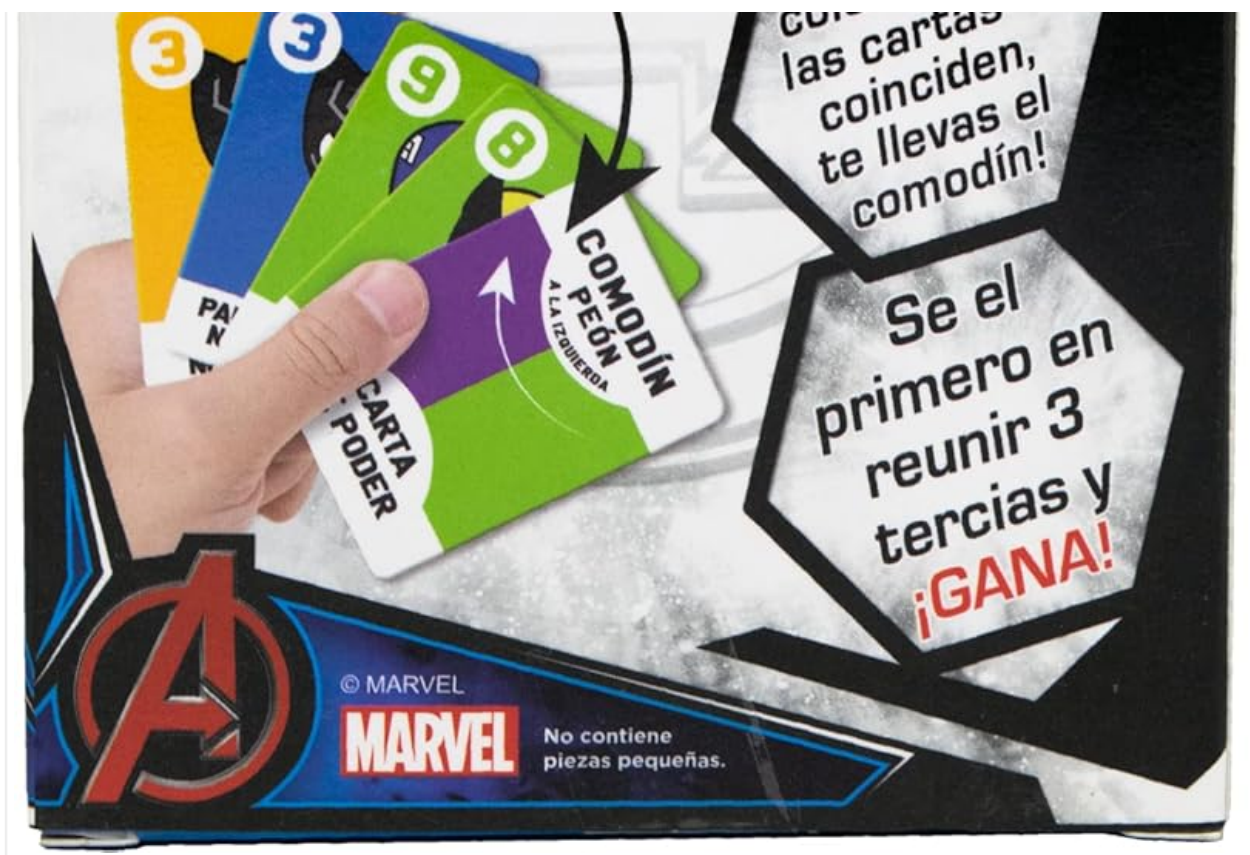
Image 2: Back of the game box illustrating card types and game objectives.