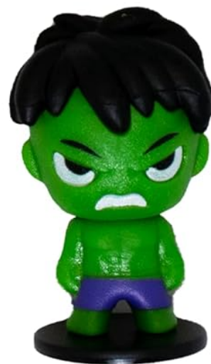
Image 1: Game components showing various character cards and the included 3D Hulk figure.