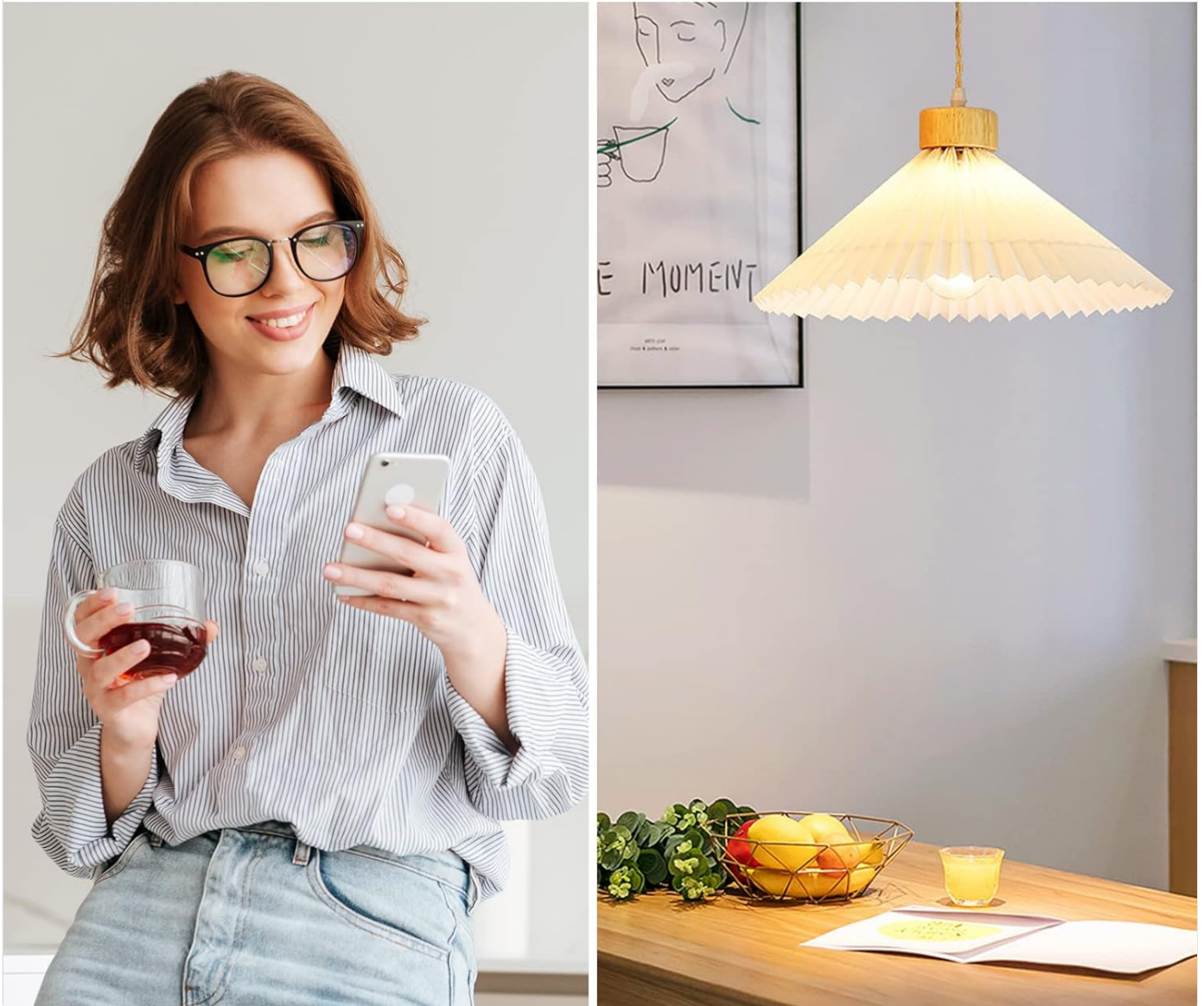
Image: APP Remote Control. A user is shown controlling a lamp remotely using a smartphone application, demonstrating the ability to manage the smart plug from any location.

Vous pouvez contrôler cette prise n'importe où et n'importe quand (Max.16A)