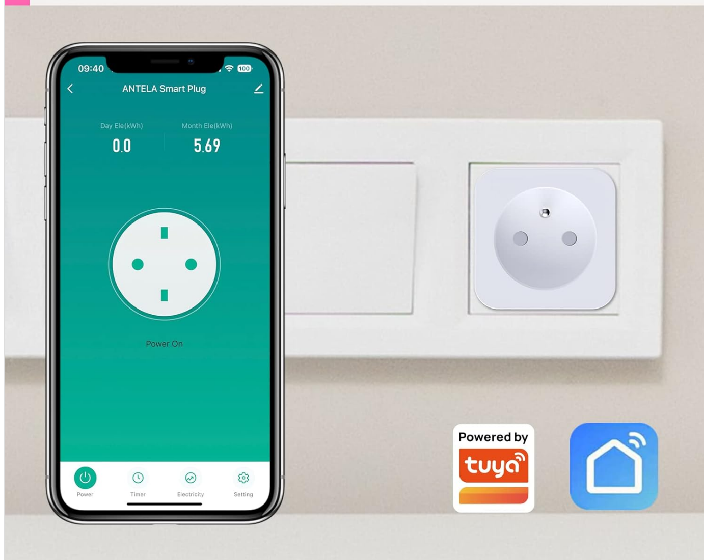
Image: Easy Connection via App. This image shows a smartphone displaying the ANTELA Smart Plug within the Smart Life app, indicating a successful connection to a 2.4 GHz WiFi network.