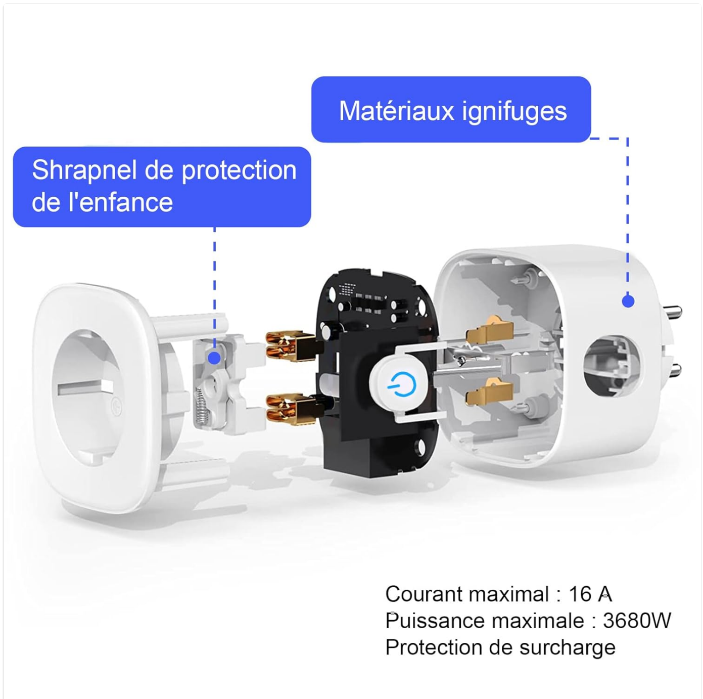
Image: Internal Safety Features. This image displays the internal components of the ANTELA Smart Plug, highlighting the child protection shrapnel and the use of fire-retardant materials. It also indicates a maximum current of 16A and maximum power of 3680W, along with overload protection.