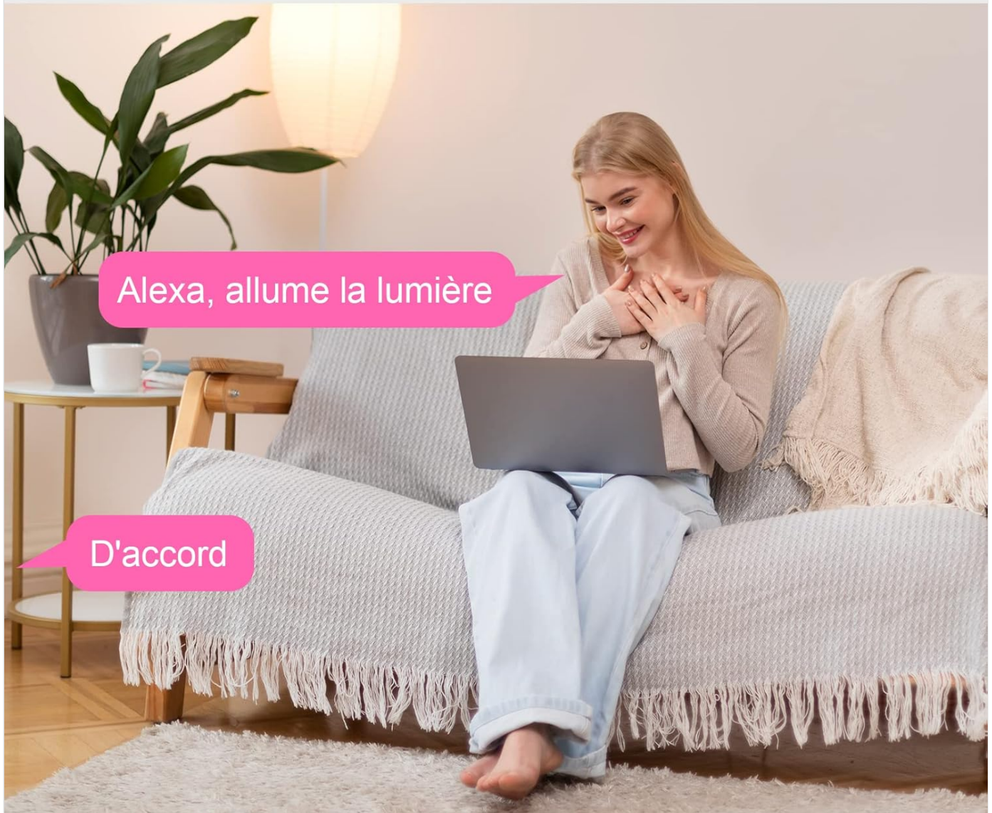
Image: Voice Command. A woman is depicted interacting with a voice assistant, demonstrating how to control smart devices by speaking commands like "Alexa, turn on the light."

Cette prise intelligente peut être contrôlée via Alexa et Google Assistant