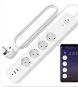
Image: Wi-Fi Compatibility. This diagram illustrates that the smart plug requires a 2.4 GHz Wi-Fi network and is not compatible with 5 GHz networks. No additional hub is required for connection.