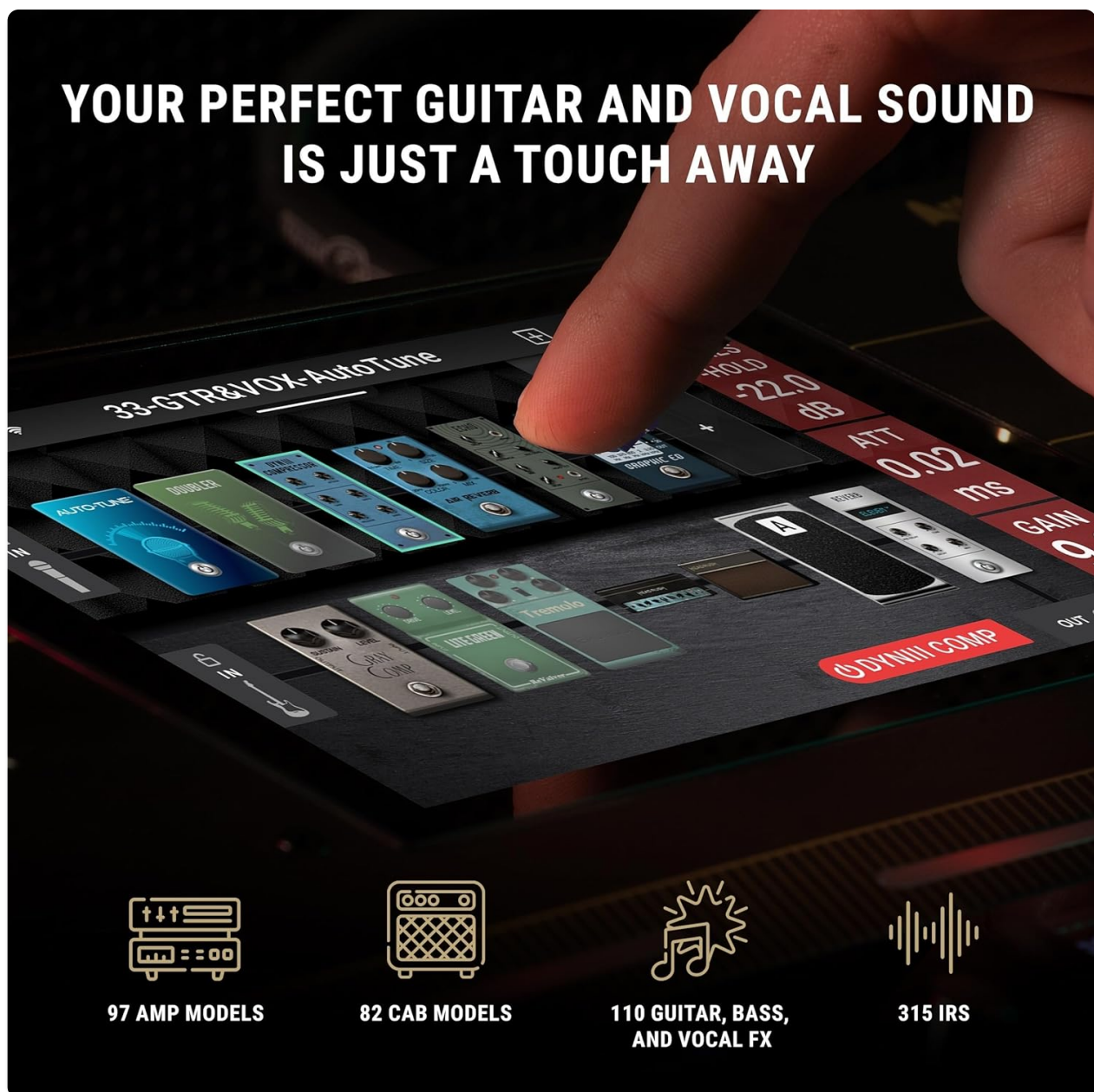
Figure 2: The responsive 7-inch touchscreen for rig editing.

The HeadRush Prime features a high-resolution, ultra-responsive 7-inch touchscreen. This allows for intuitive touch, swipe, and drag-and-drop functionality to create and edit your rigs with ease.