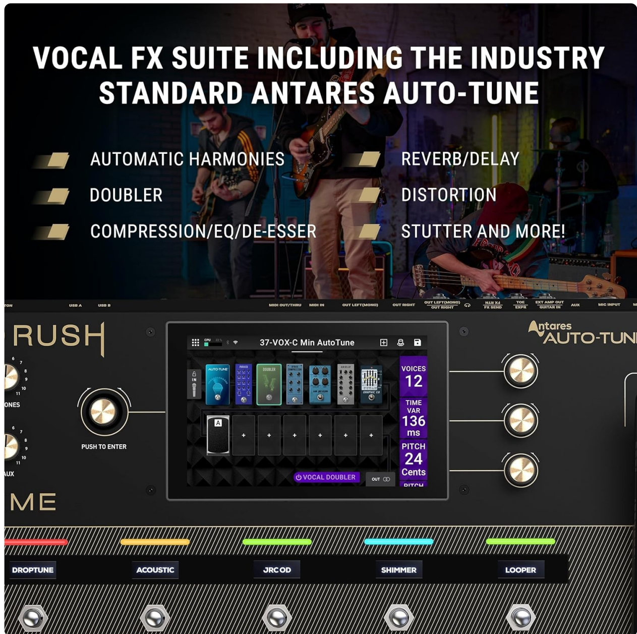
Figure 5: Overview of the Vocal FX Suite.

The Prime includes a full suite of vocal effects, notably the industry-standard Antares Auto-Tune, ensuring perfect onstage vocals. It also supports direct recording to Mac/PC via its built-in USB Audio interface.