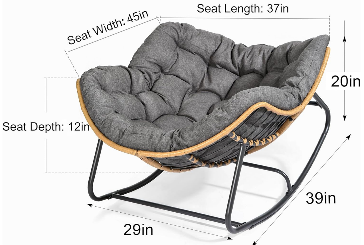
Figure 2.1: Assembly overview and key dimensions. The chair has a weight capacity of up to 450 lbs.