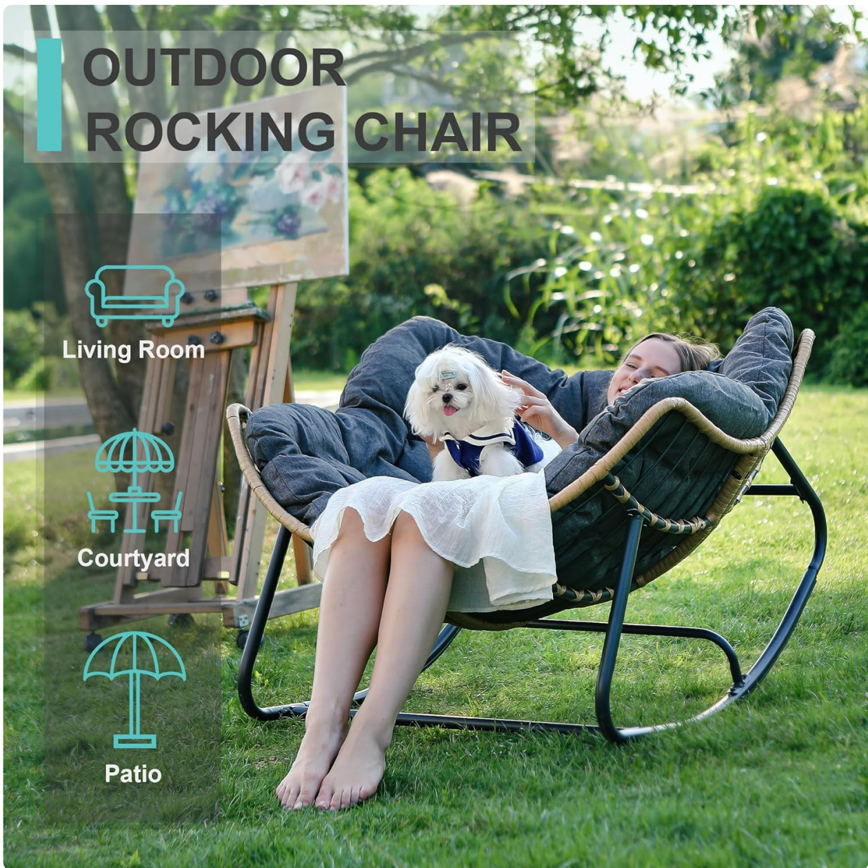
Figure 3.2: The chair is also perfect for outdoor settings like a courtyard or patio.