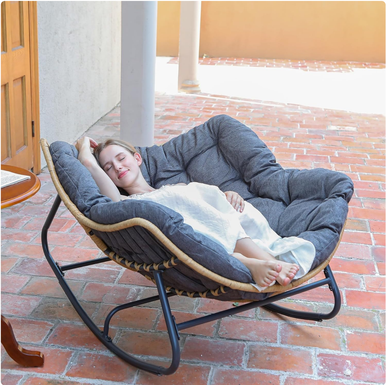
Figure 1.1: The SWITTE Outdoor Rocking Chair, showcasing its comfortable design and suitability for relaxation.