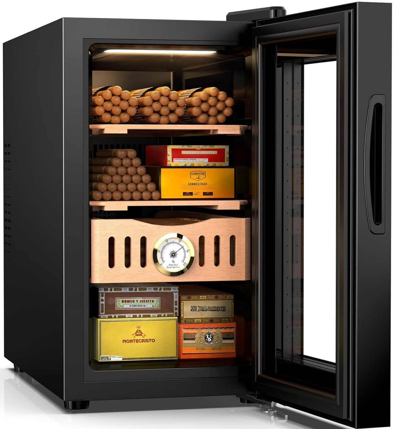
Figure 1: Front view of the Mojgar 25L Electric Humidor.