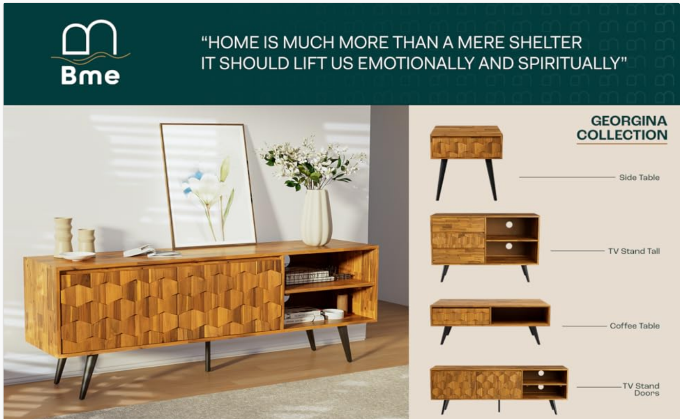
Figure 2: Assembled Entertainment Center. This image displays the fully assembled Bme Georgina TV stand in a typical home environment, showcasing its design and functionality.

No additional tools are required for the basic assembly of the legs.