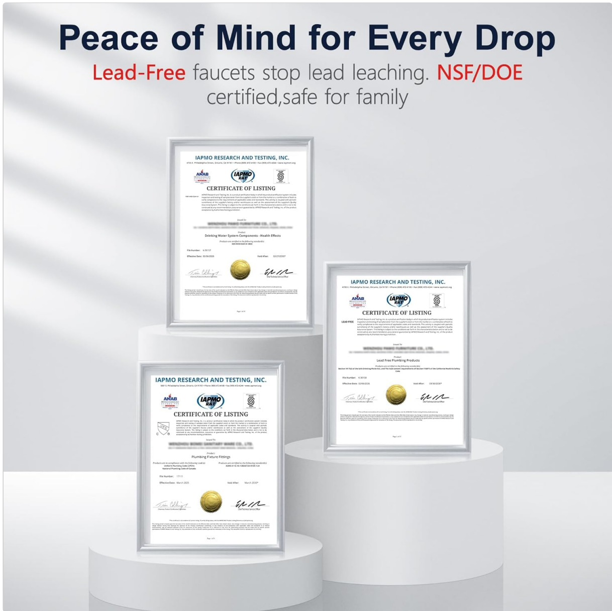
Image: Lead-Free and NSF/DOE certification documents for the GIMILI faucet.

Lead-Free faucets stop lead leaching. NSF/DOE certified, safe for family