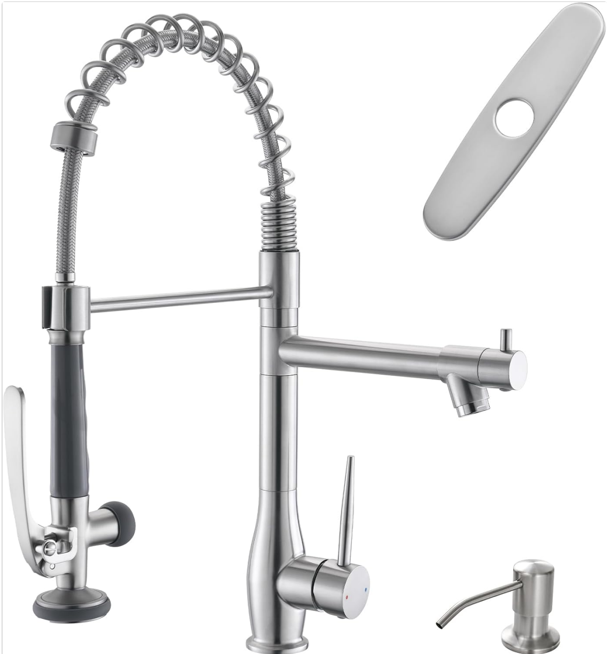
Image: The GIMILI Commercial Kitchen Faucet with its pull-down sprayer and integrated soap dispenser, showcasing its brushed nickel finish.