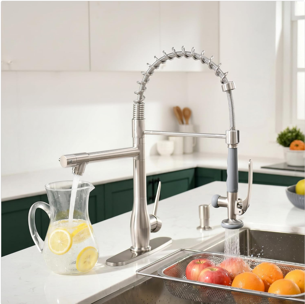
Image: The pot filler spout efficiently filling a pitcher with water, highlighting its convenience.

Your browser does not support the video tag.