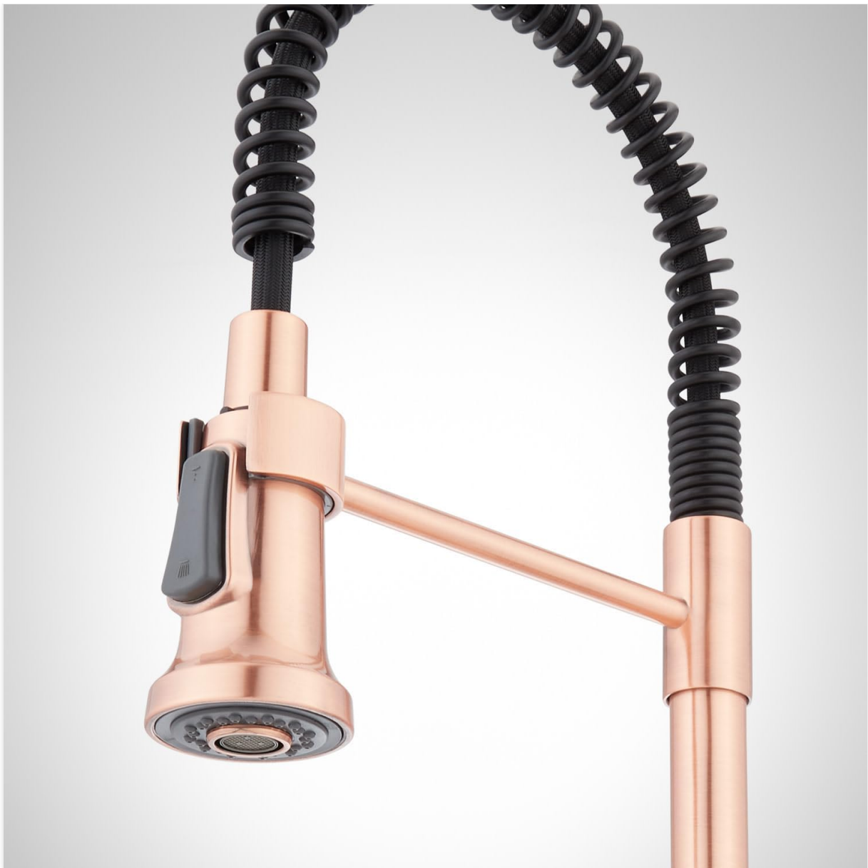
Figure 2: Detailed view of the multifunctional spray head with its control button.