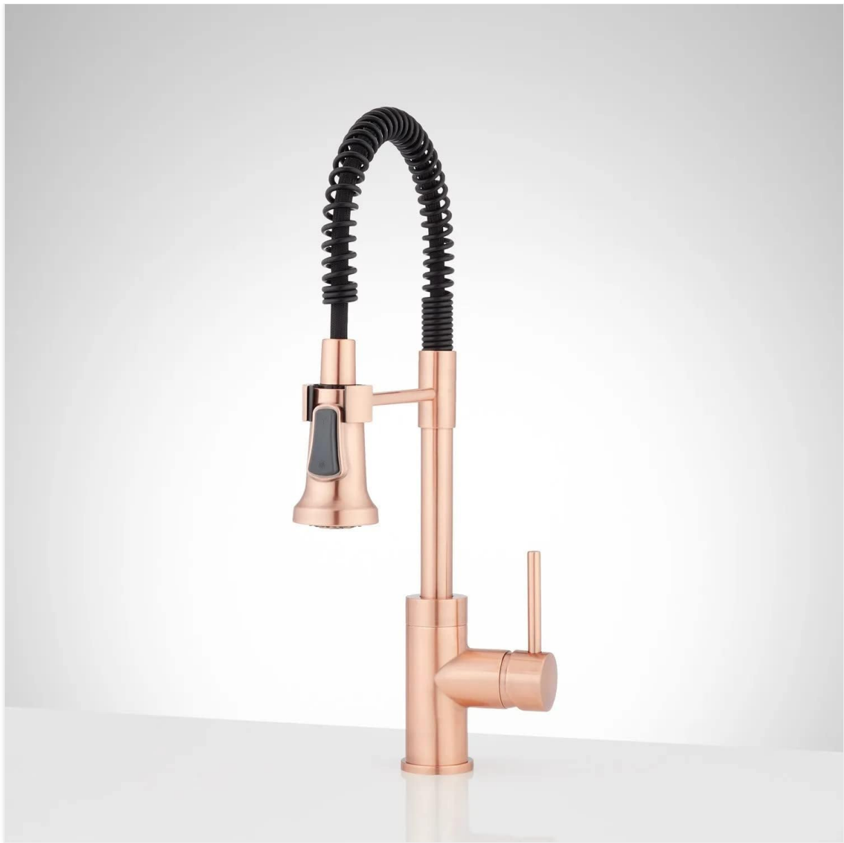
Figure 1: Overview of the Signature Hardware Presidio Kitchen Faucet in Copper.