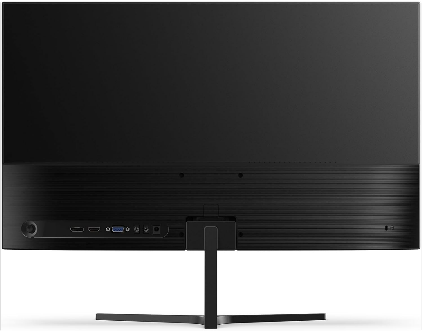
Full rear view of the CHIQ monitor with the stand attached, showing the location of the input ports and the VESA mounting points.