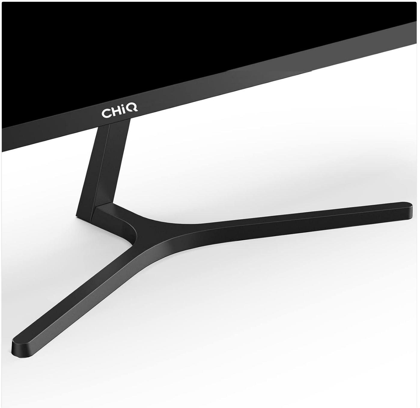
Close-up view of the monitor stand, illustrating its design and how it connects to the monitor for stable placement.