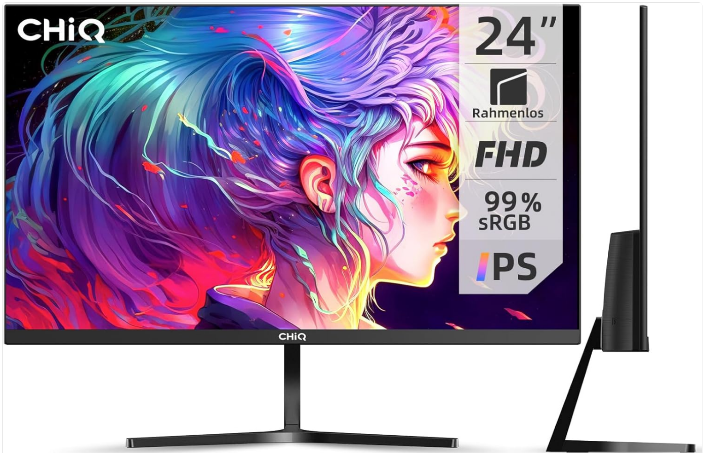
Front and side view of the CHiQ 24F650 monitor, highlighting its 24-inch display, Full HD resolution, frameless design, 99% sRGB, and IPS panel.

The CHiQ 24F650 is a 24-inch Full HD (1920 x 1080) monitor designed for a wide range of uses, from office work and learning to entertainment and gaming. It features an ultra-thin, frameless design, an IPS panel with 99% sRGB color gamut, and AMD FreeSync technology for a smooth visual experience. Multiple connectivity options including HDMI, VGA, and DP ensure broad compatibility.