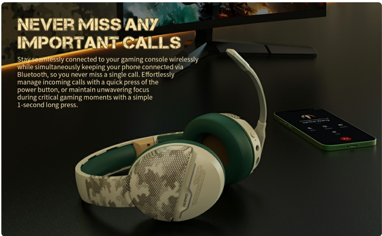
Figure 6: Seamlessly switch between gaming audio and phone calls without interruption.