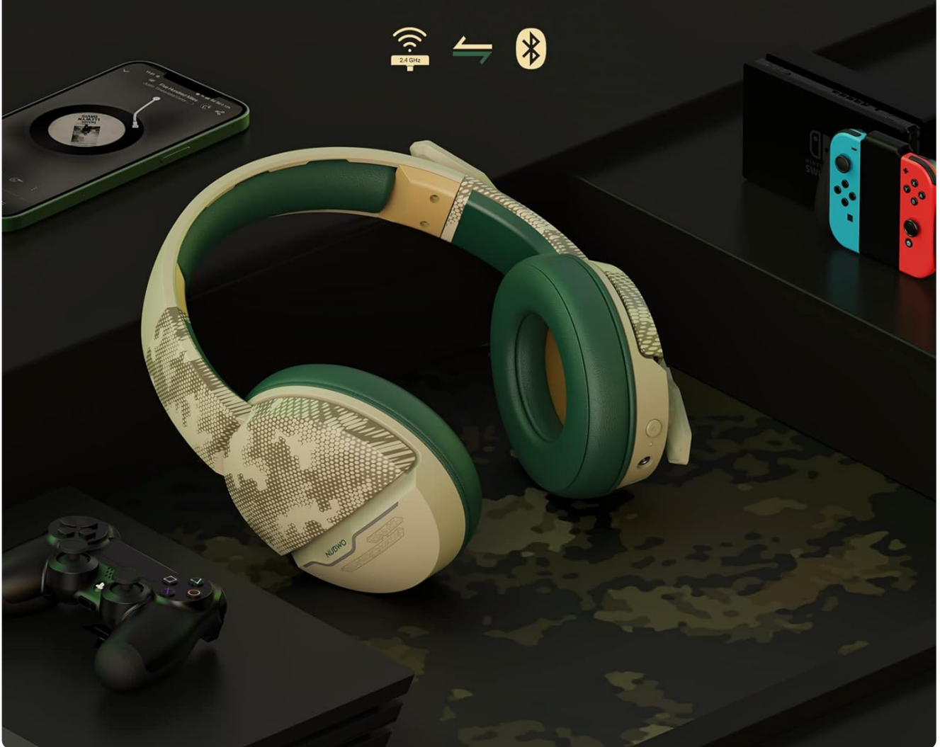
Figure 3: The headset supports simultaneous 2.4GHz wireless and Bluetooth connections, allowing for seamless audio transitions.