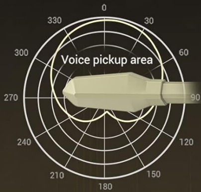
Figure 5: The bendable cardioid microphone ensures clear voice pickup for effective team communication.