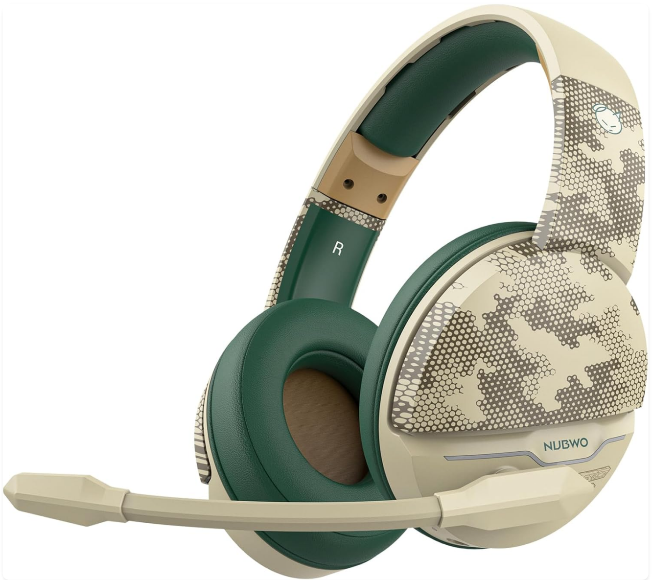
Figure 1: NUBWO G08 Wireless Gaming Headset in Desert color.

This manual provides detailed instructions for setting up, operating, maintaining, and troubleshooting your NUBWO G08 headset.