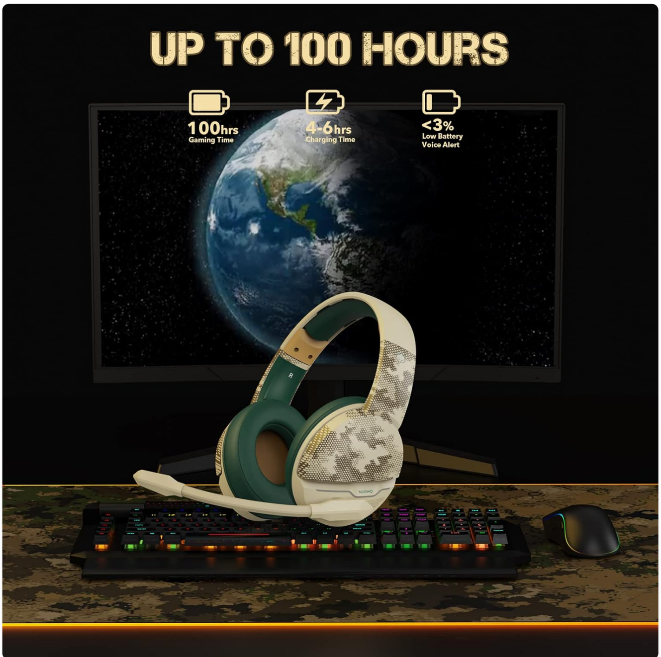
Figure 2: The headset offers up to 100 hours of gaming time on a 4-hour charge, with low battery alerts.