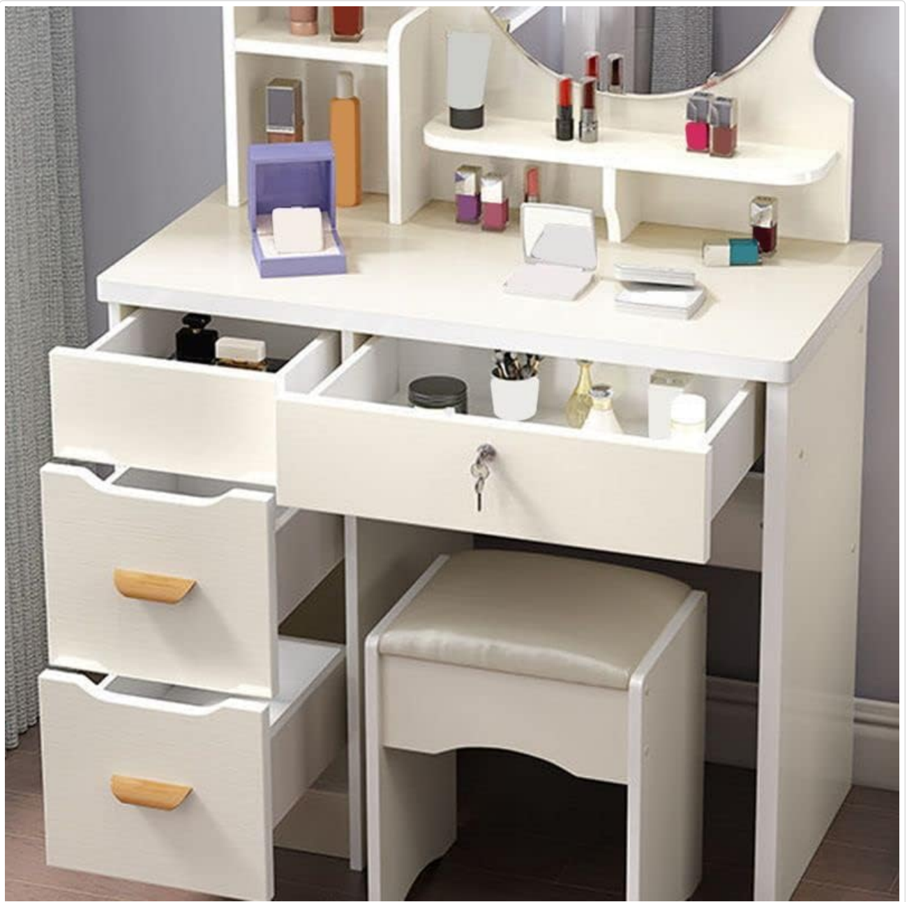
Image 3.2: Close-up view of the dressing table's four drawers, two on the left and two on the right, with the middle drawer featuring a lock.