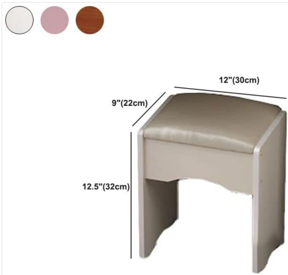
Image 7.2: Diagram illustrating the dimensions of the accompanying stool, including height, width, and depth.