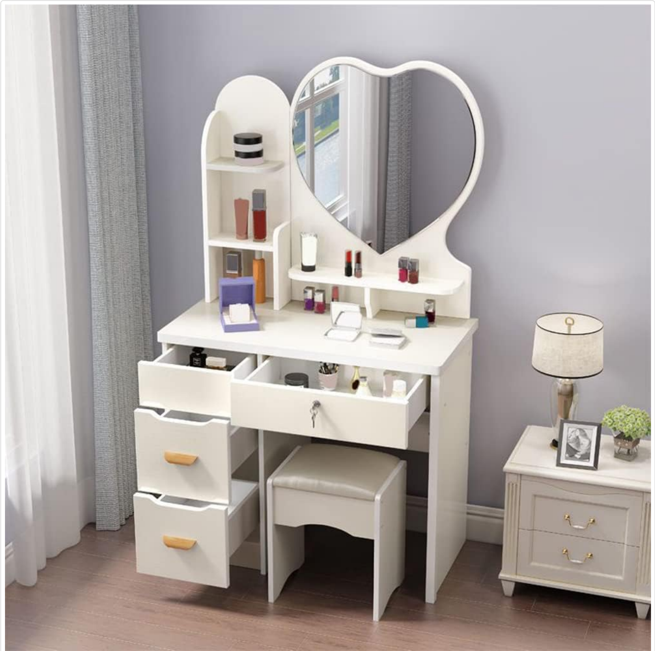
Image 3.1: Fully assembled KWOKING White Heart Shape Mirror Dressing Table with stool, showcasing its design and storage.