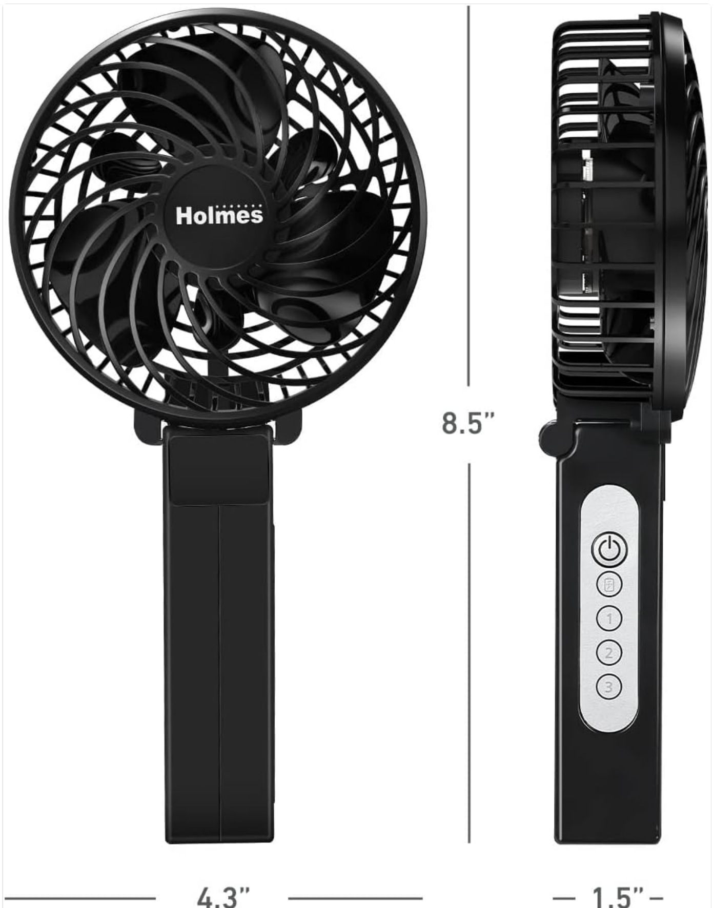
Image: A diagram illustrating the physical dimensions (height, width, depth) of the fan.