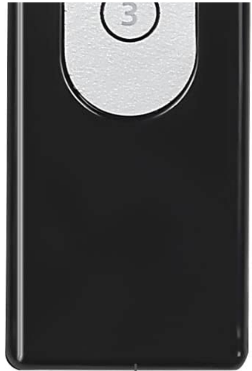
Image: Detailed view of the fan's control panel, highlighting the power/speed button, battery indicator lights, and the USB-C charging port with its included cable.