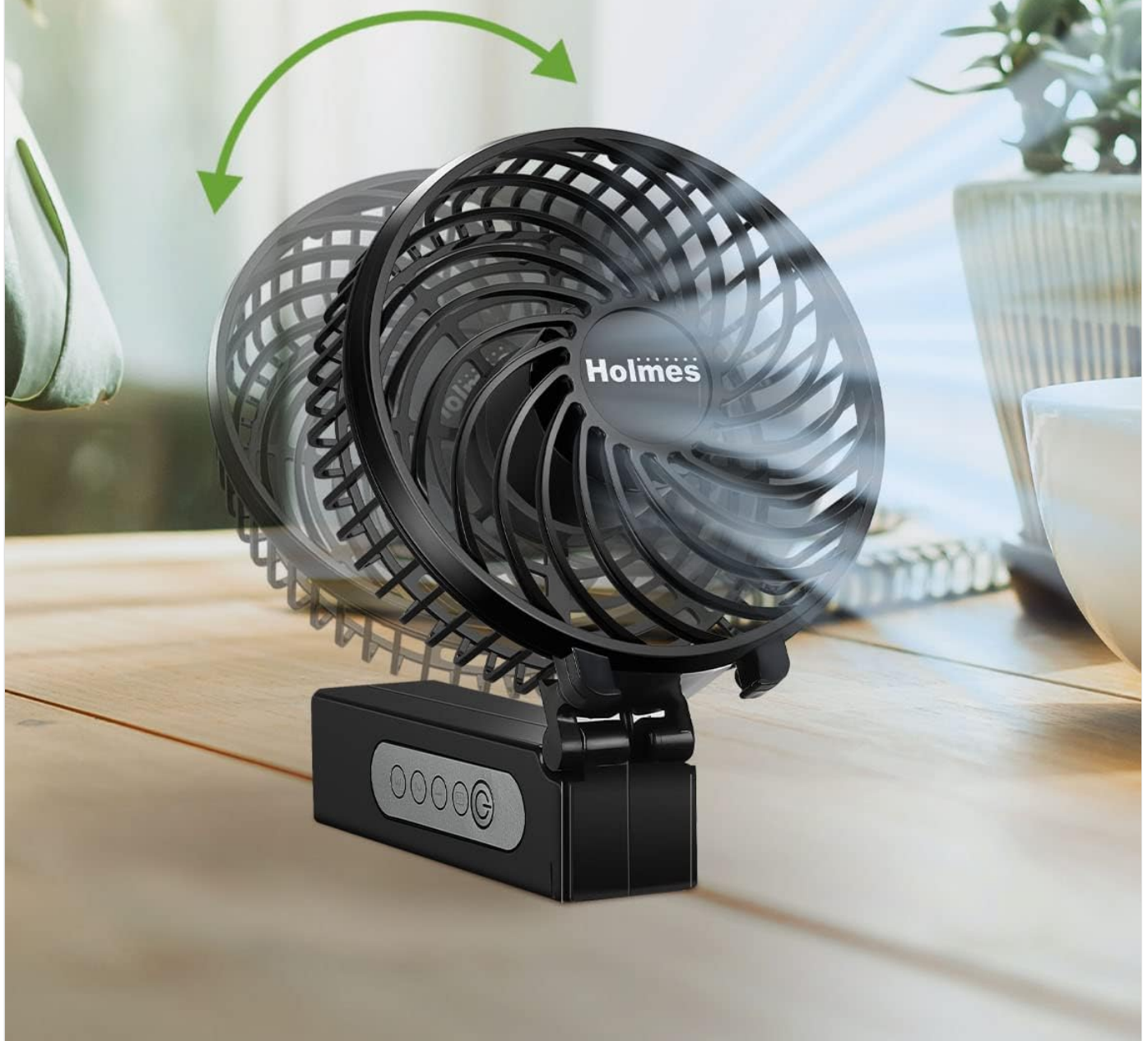
Image: The fan demonstrating its 180-degree adjustable head tilt, allowing users to position it for optimal airflow.