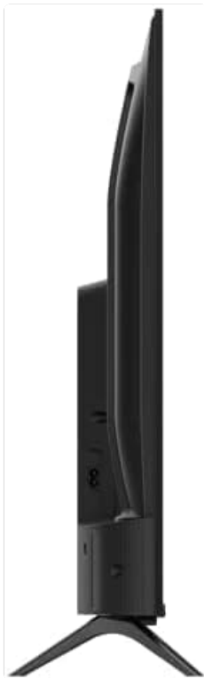
Image: Another side view of the TCL 50-Inch Series 4 Class 4K Smart Roku TV, emphasizing its slim design and the arrangement of additional ports on the side, providing easy access for connections.