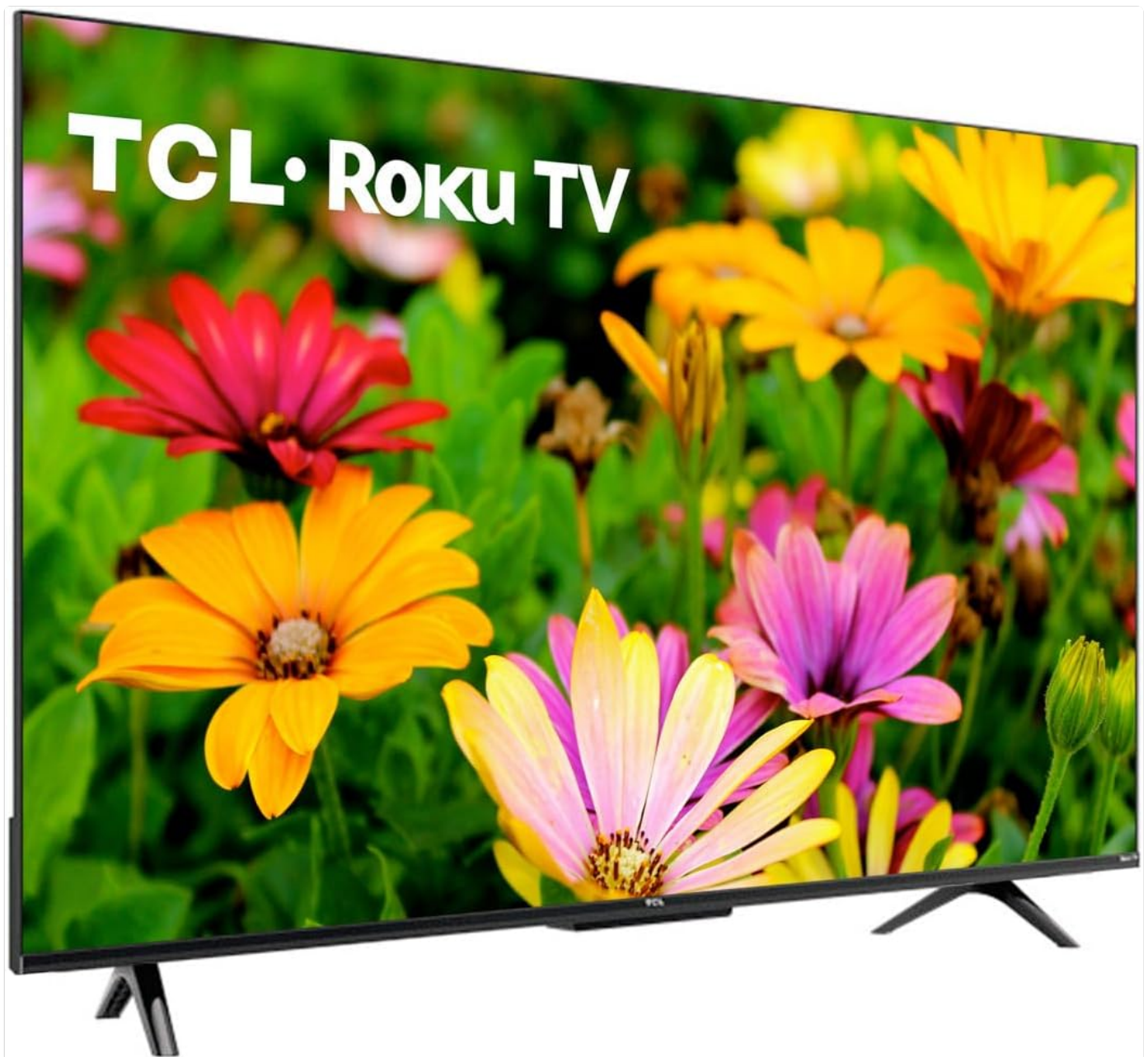
Image: Front view of the TCL 50-Inch Series 4 Class 4K Smart Roku TV. The screen displays vibrant flowers, highlighting the display quality. The TV is black with a slim bezel and two V-shaped stands at the bottom corners.