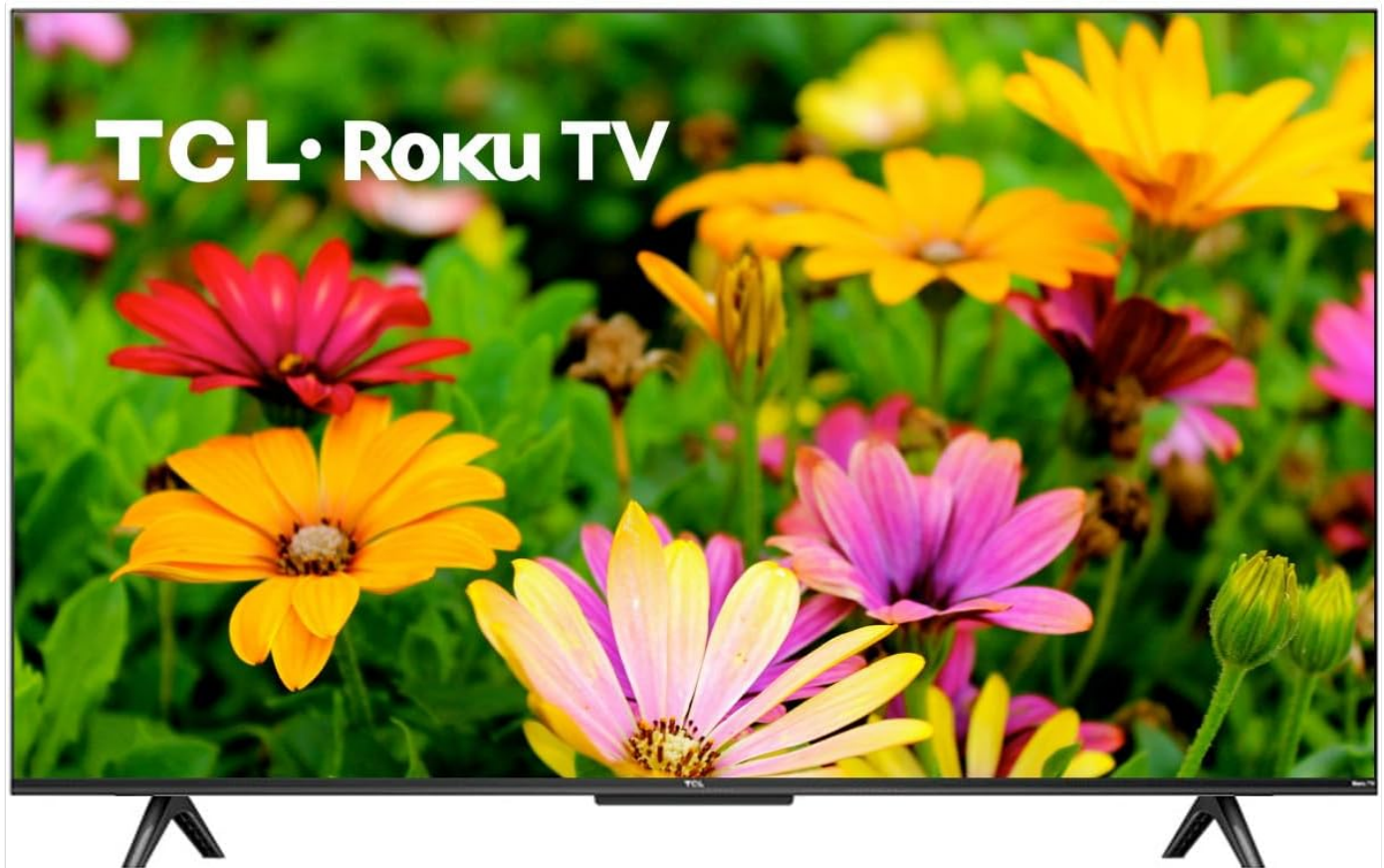
Image: Front view of the TCL 50-Inch Series 4 Class 4K Smart Roku TV with its two V-shaped stands securely attached. The screen shows a vibrant floral image, indicating the TV is ready for use.