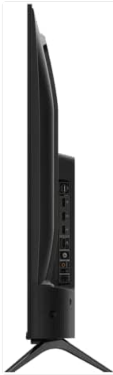
Image: Side profile of the TCL 50-Inch Series 4 Class 4K Smart Roku TV, highlighting the various input ports located on the side panel. These include HDMI, USB, and other connectivity options for external devices.