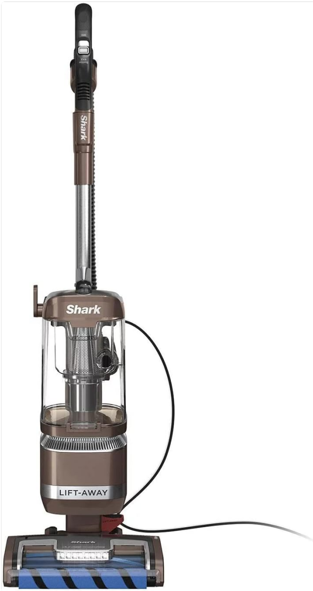
The Shark LA455 Rotator Upright Vacuum, showcasing its overall design.