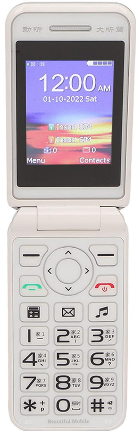
Image: The Jectse N509 flip phone is open, showcasing its vibrant 2.4-inch HD color display and the clearly visible, large keypad with LED backlighting.