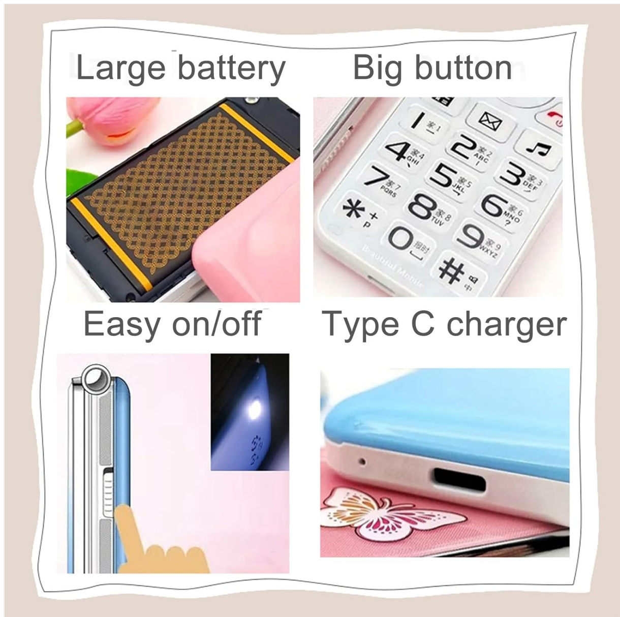
Image: This composite image highlights key features: the large battery for extended use, oversized buttons for ease of dialing, a convenient on/off switch, and the modern Type-C charging port.