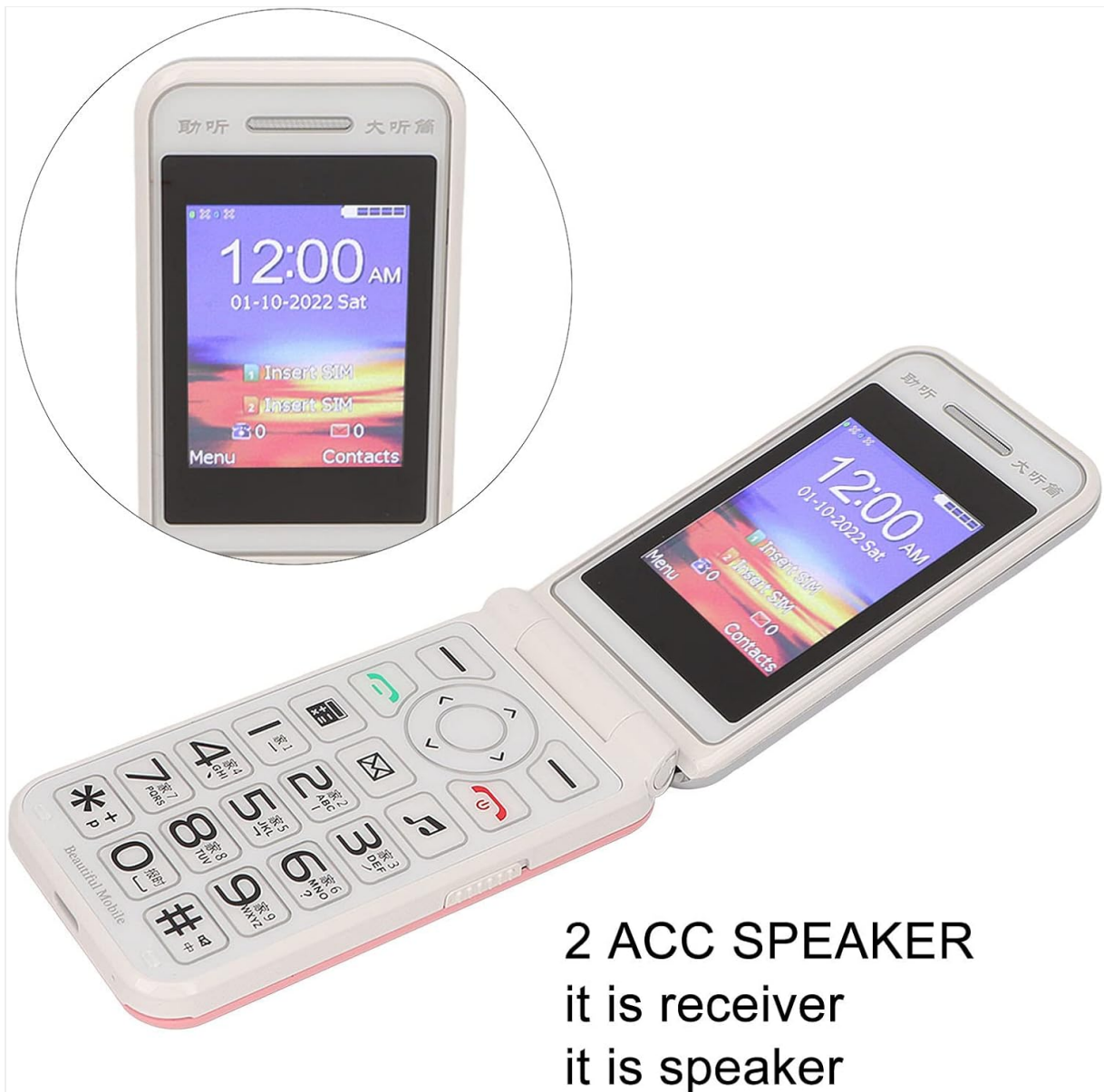
Image: The phone's screen prompts to "Insert SIM", indicating the need for SIM card installation before use.