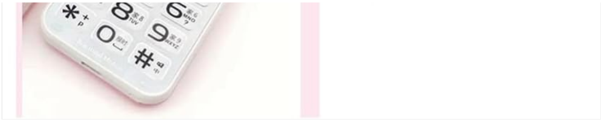
Image: This image details the phone's features, including its 2.4G large display, powerful loudspeaker, and convenient Type-C charging interface.