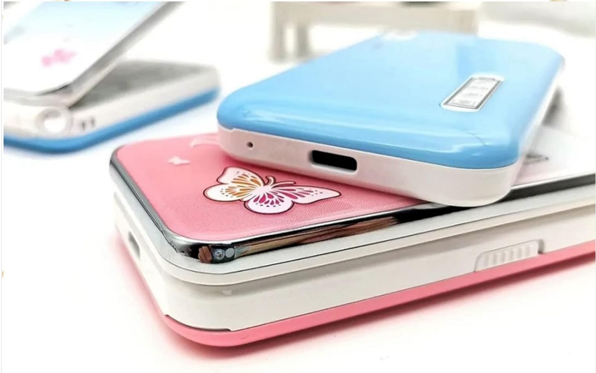
Image: A close-up view of the Type-C charging port on the Jectse N509 flip phone, highlighting its modern connectivity.