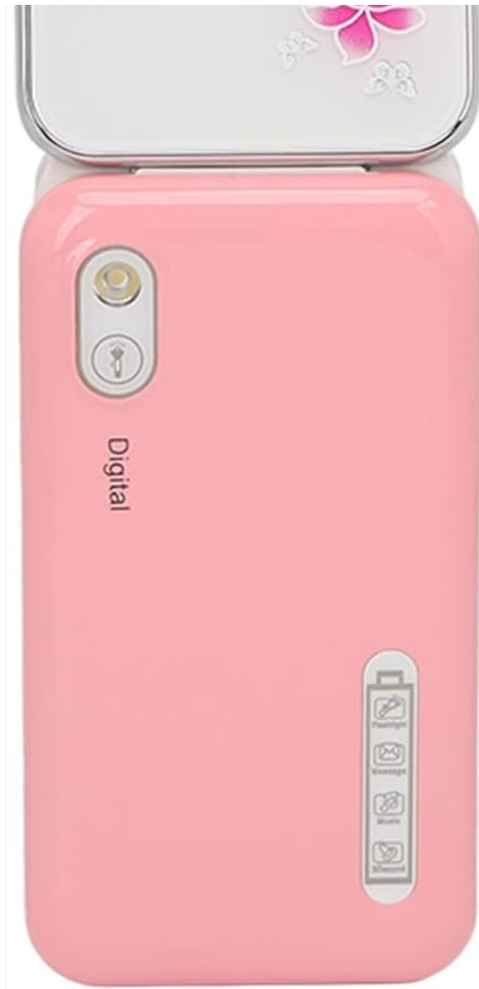
Image: The Jectse N509 flip phone in its closed state, featuring a pink and white gradient finish adorned with elegant butterfly patterns.