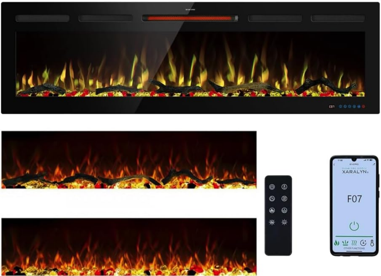
Image 1.1: Front view of the Mystflame Galaxy 60 Pro electric fireplace, showcasing its sleek design and realistic flame effects.

Thank you for choosing the Mystflame Galaxy 60 Pro electric fireplace. This manual provides essential information for the safe operation, installation, and maintenance of your new appliance. Please read it thoroughly before installation and use, and retain it for future reference.