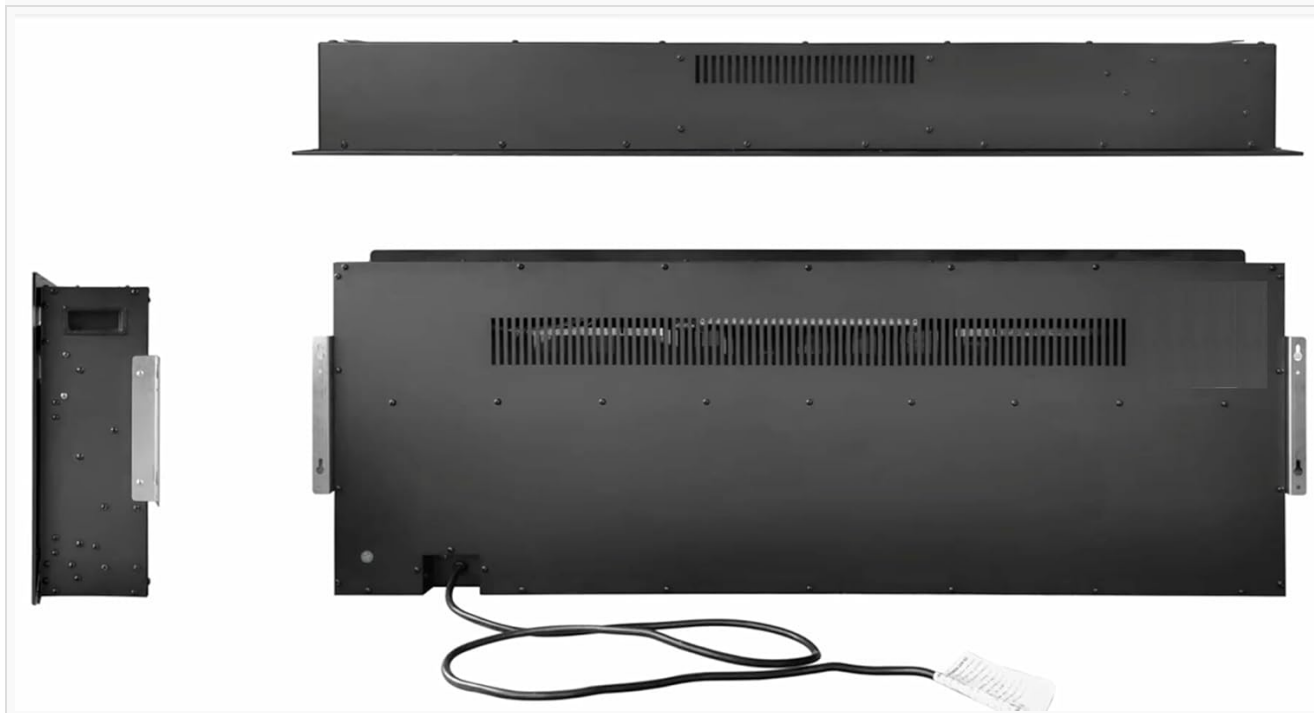
Image 5.1: Rear and side views of the Mystflame Galaxy 60 Pro, showing mounting points and power connection.