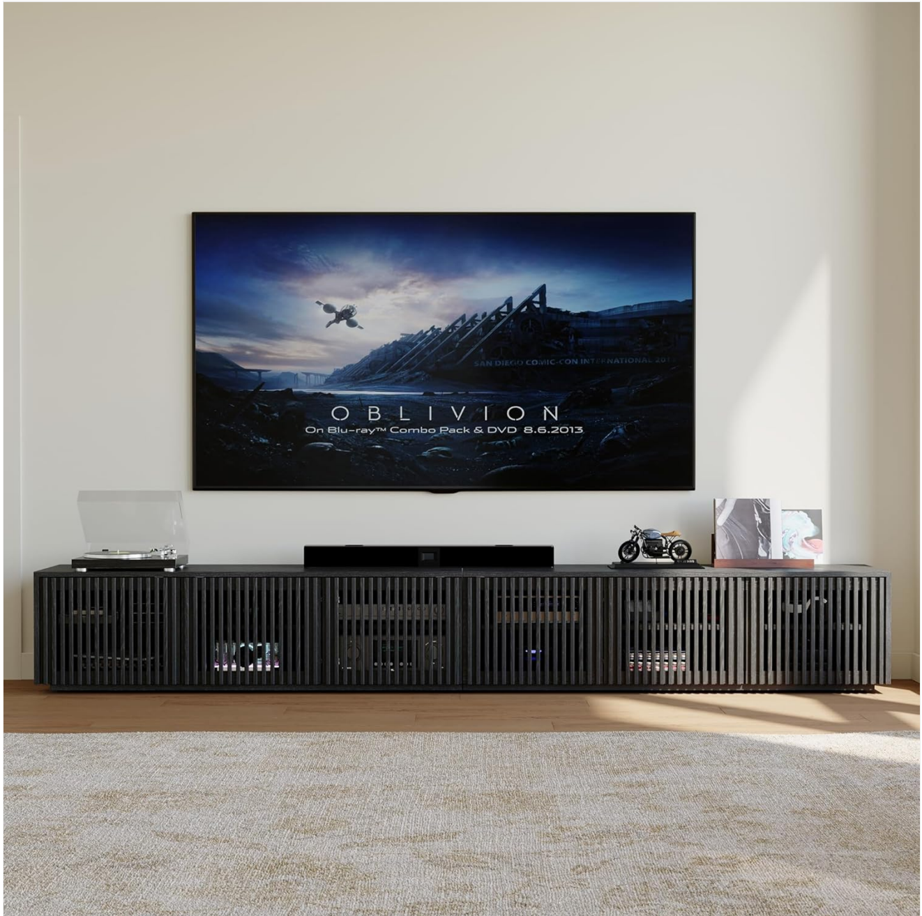
Figure 3: POVISION TV Stand in a living room setup.