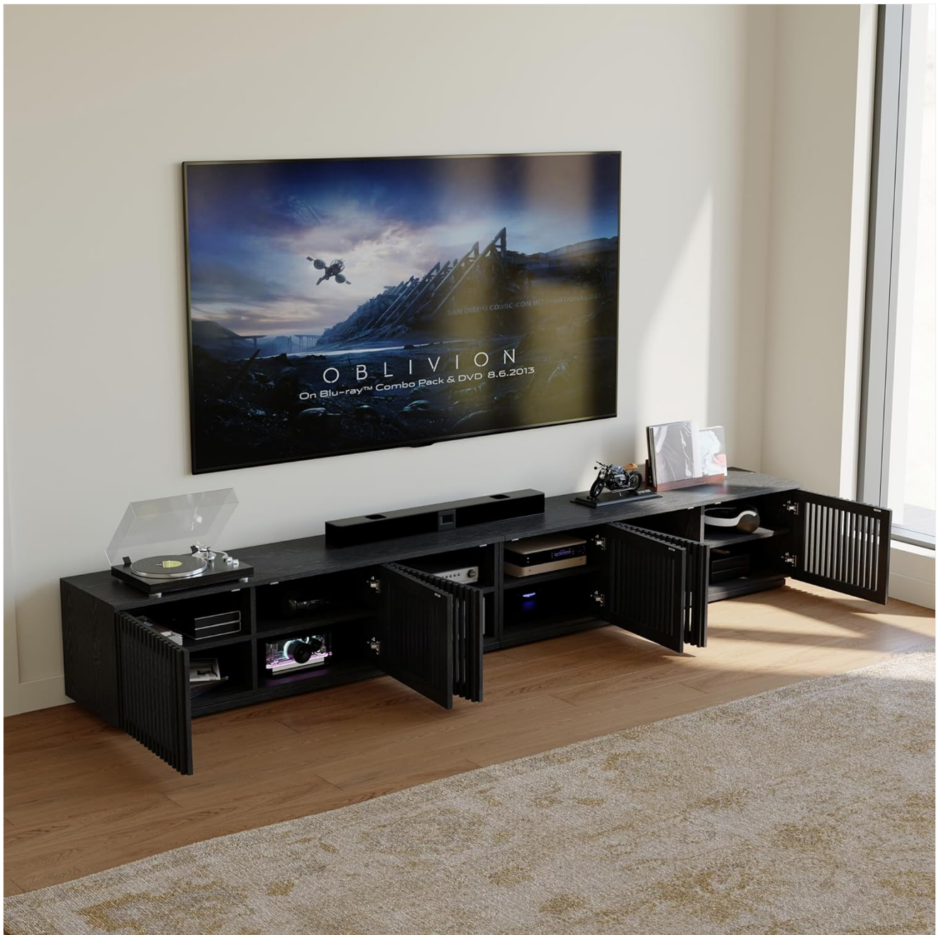
Figure 4: Interior storage compartments with doors open.