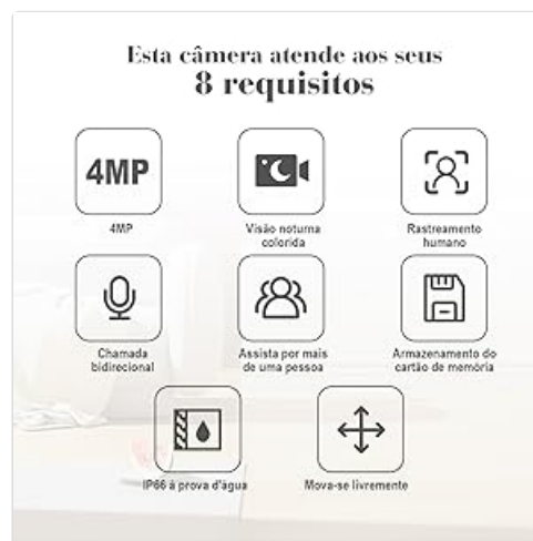
Image 5.1: The camera's auto-tracking feature follows detected human movement.