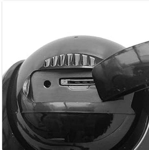
Image 5.3: The camera's PTZ functionality allows for 352° horizontal and 95° vertical rotation.