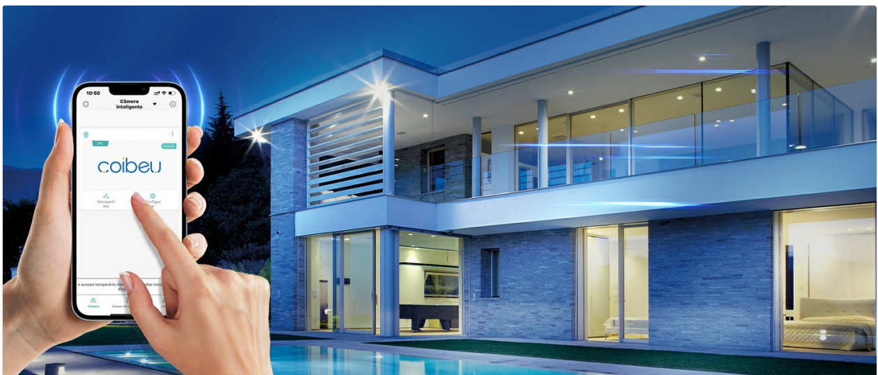
Image 4.2: Remote access and control of the camera via a smartphone application.