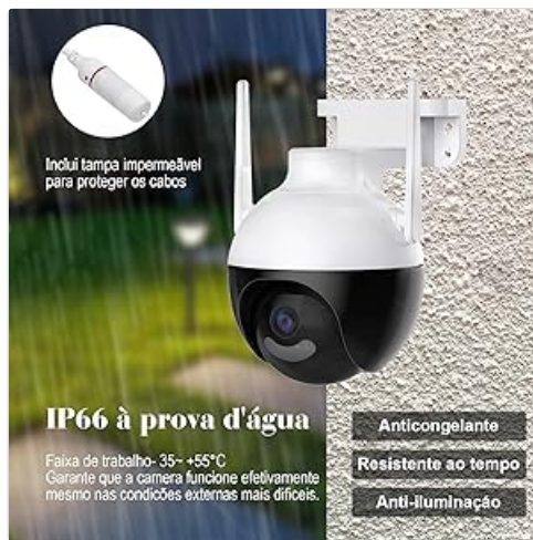
Image 2.1: Visual representation of key features including 4MP, night vision, human tracking, two-way call, multi-user access, memory card storage, IP66, and free movement.