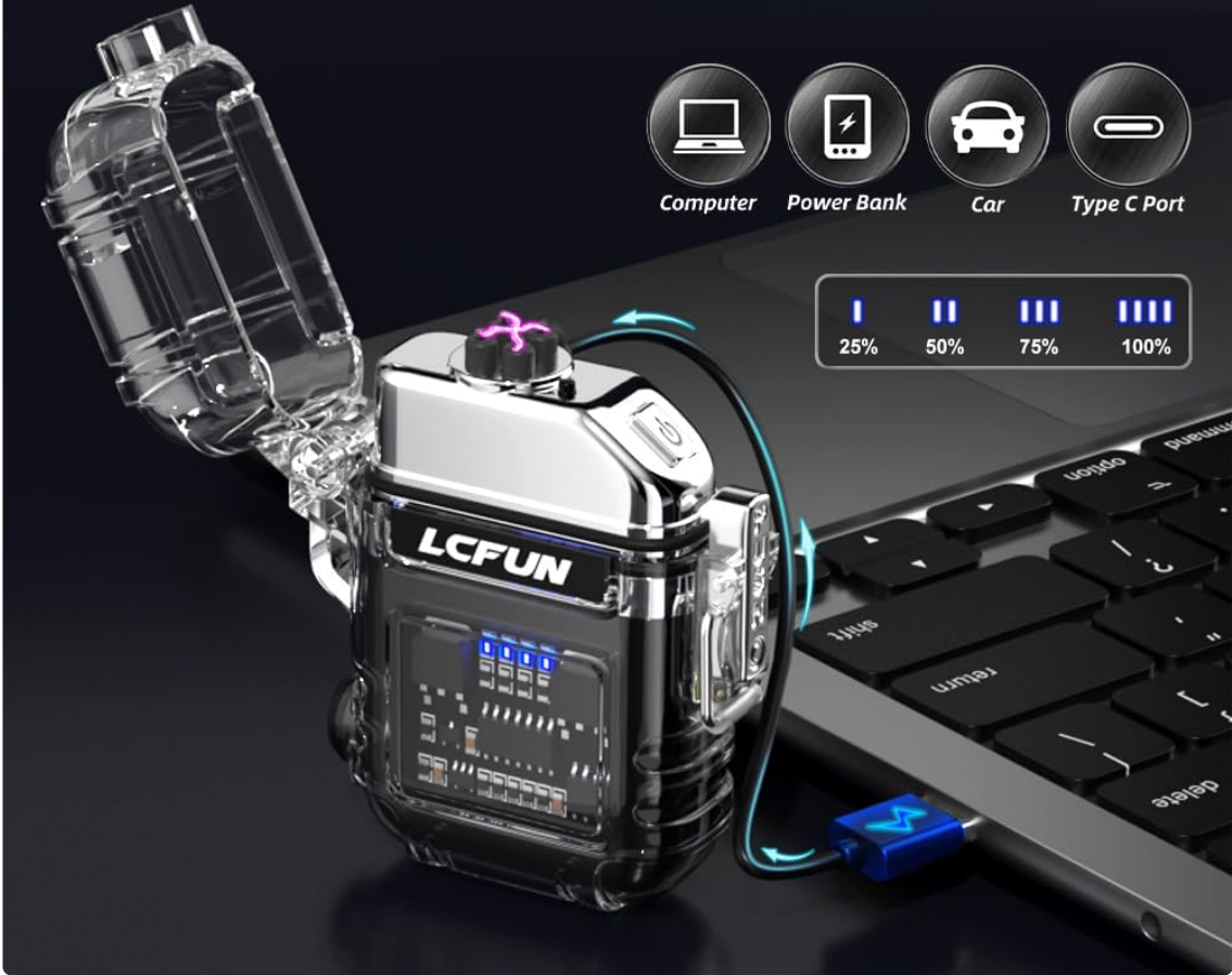
Image: The lighter connected to a USB port, displaying its LED battery indicator during charging.