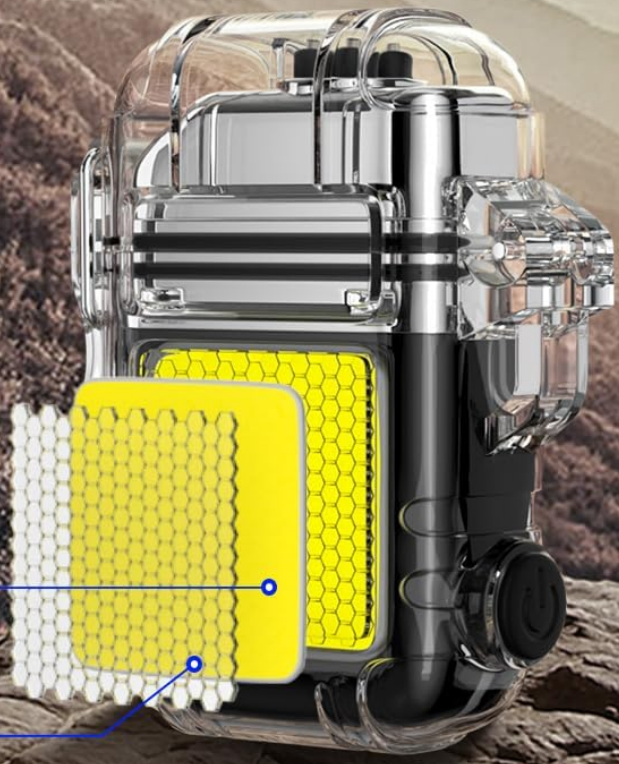
Image: The lighter's COB flashlight in action, illustrating its three distinct lighting modes.

Rhombic lens for brightening and uniform light