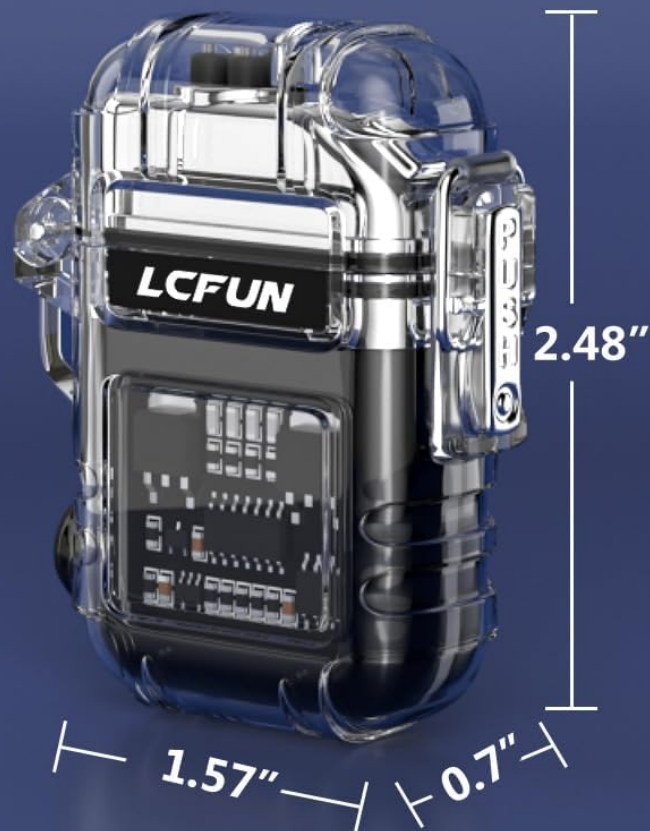
Image: Product dimensions are shown, emphasizing the lighter's compact and lightweight nature.