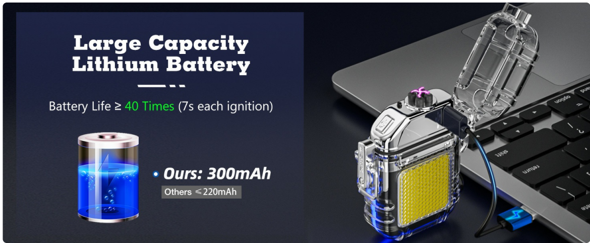
Image: The lighter being charged via its USB-C port, illustrating the charging process.