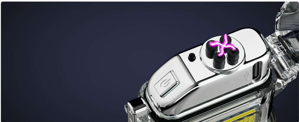
Image: Close-up of the LcFun Electric Lighter's dual arc, demonstrating its powerful ignition.