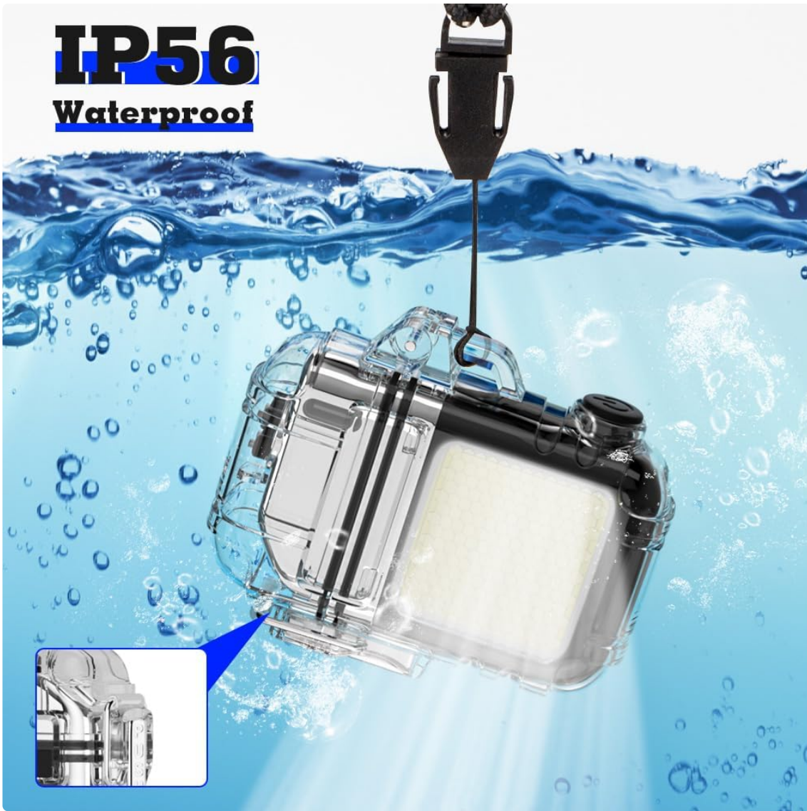
Image: The lighter submerged in water, showcasing its IP56 waterproof design.