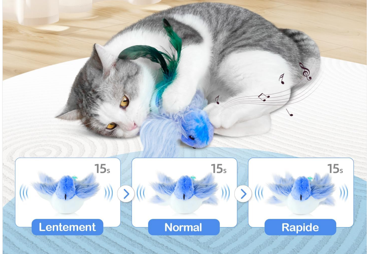
Image: The Migipaws Electric Interactive Blue Bird Cat Toy, designed to stimulate your cat's natural instincts.