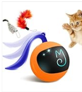
Image: Cats enjoying interactive play with the Migipaws toy, both suspended and on the floor.