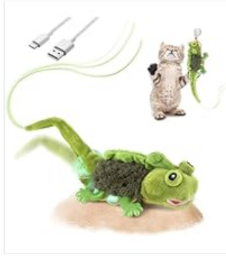
Image: All components included in the Migipaws Electric Interactive Cat Toy package.