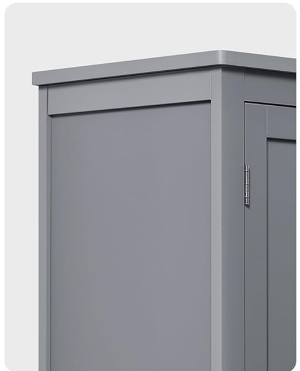
Decorative Side Panels

Image: Detailed view of the cabinet's design elements, showcasing the rounded top corners, the unique diamond-shaped handles, and the textured decorative side panels.