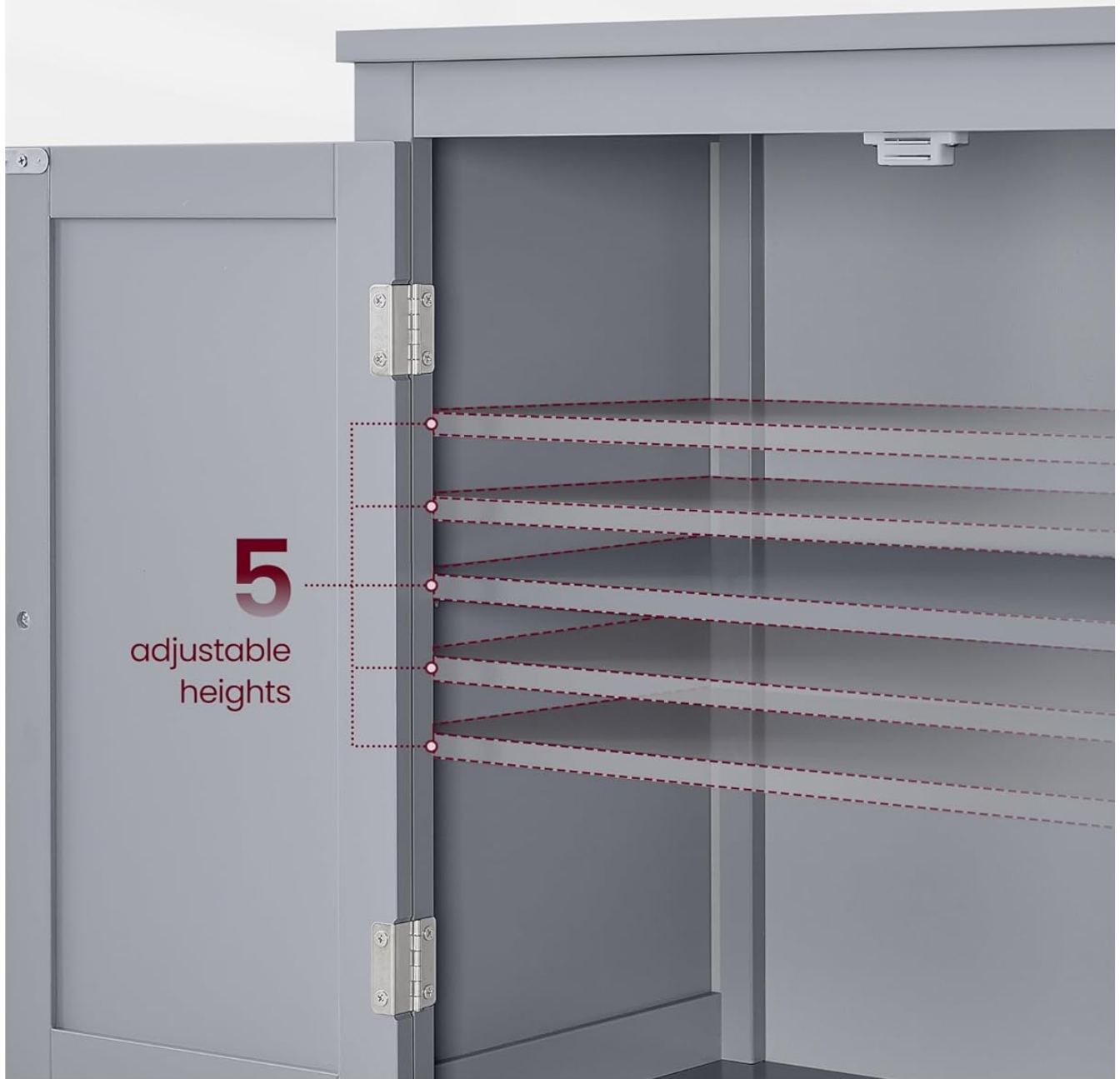
Image: A close-up diagram highlighting the five adjustable height options for the interior shelves, demonstrating the cabinet's adaptability.