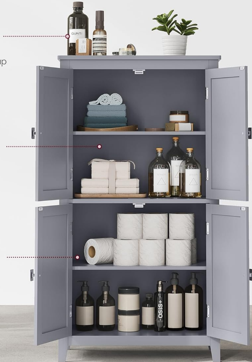
Image: The cabinet with doors open, displaying organized items like toothbrushes, hand soap, toilet paper, laundry detergent, towels, and shower gel across its shelves.