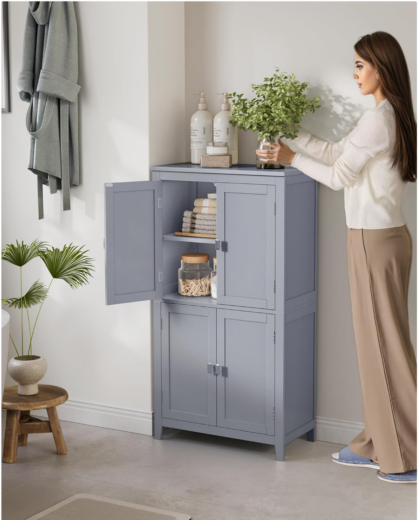
Image: A woman placing a plant on top of the Dove Gray storage cabinet, which is positioned in a bathroom, demonstrating its functional and aesthetic integration into a living space.