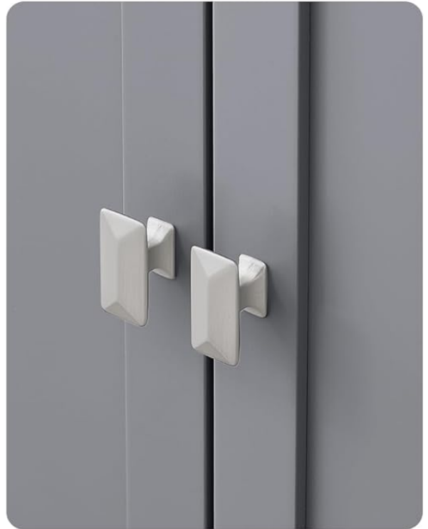
Handy Diamond-Shaped Handles