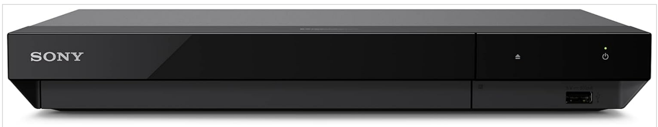
Image: Front view of the Sony UBP-X700M 4K Ultra HD Blu-ray Player, showing its sleek black design and disc tray.

The Sony UBP-X700M is a 4K Ultra HD Blu-ray player designed to provide high-resolution disc playback and access to streaming services. It supports 4K HDR content, offering enhanced picture quality when connected to a compatible 4K HDR television.