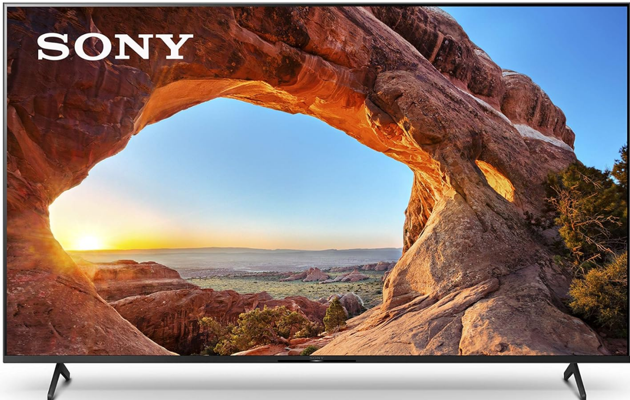
Image: Front view of the Sony X85J 65-inch television, showcasing its slim bezels and stand.

The Sony X85J is a 65-inch 4K Ultra HD LED Smart Google TV designed to deliver a high-quality viewing experience. Featuring a native 120Hz refresh rate and Dolby Vision HDR, this television provides smooth motion and vibrant colors. Google TV integration offers access to a wide range of streaming services and smart features.