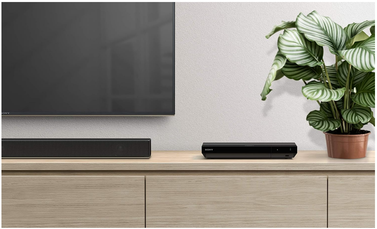
Image: The Sony UBP-X700M Blu-ray Player positioned on a media console next to a television, illustrating a typical setup.