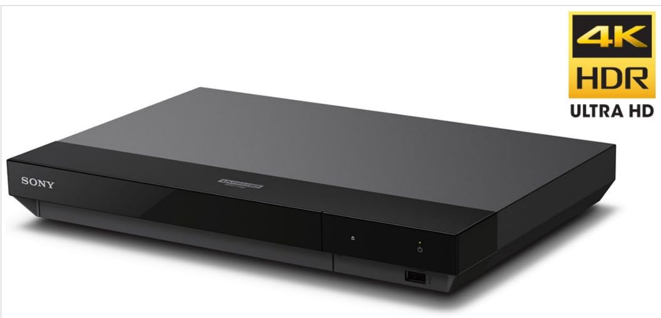
Image: Angled view of the Sony UBP-X700M 4K Ultra HD Blu-ray Player, with the 4K HDR Ultra HD logo visible, emphasizing its capabilities.