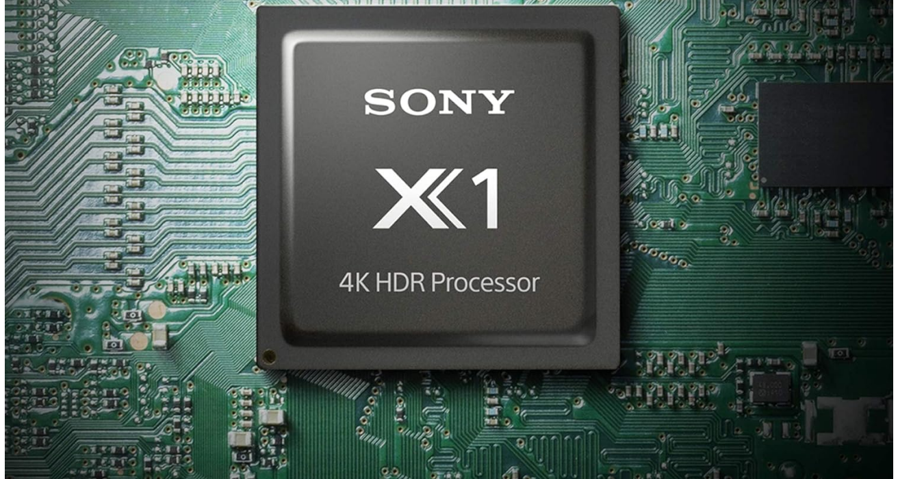
Image: Close-up of the Sony X1 4K HDR Processor chip, highlighting its role in image processing for rich colors and detail.

Beautiful picture, full of rich colors, and real world detail