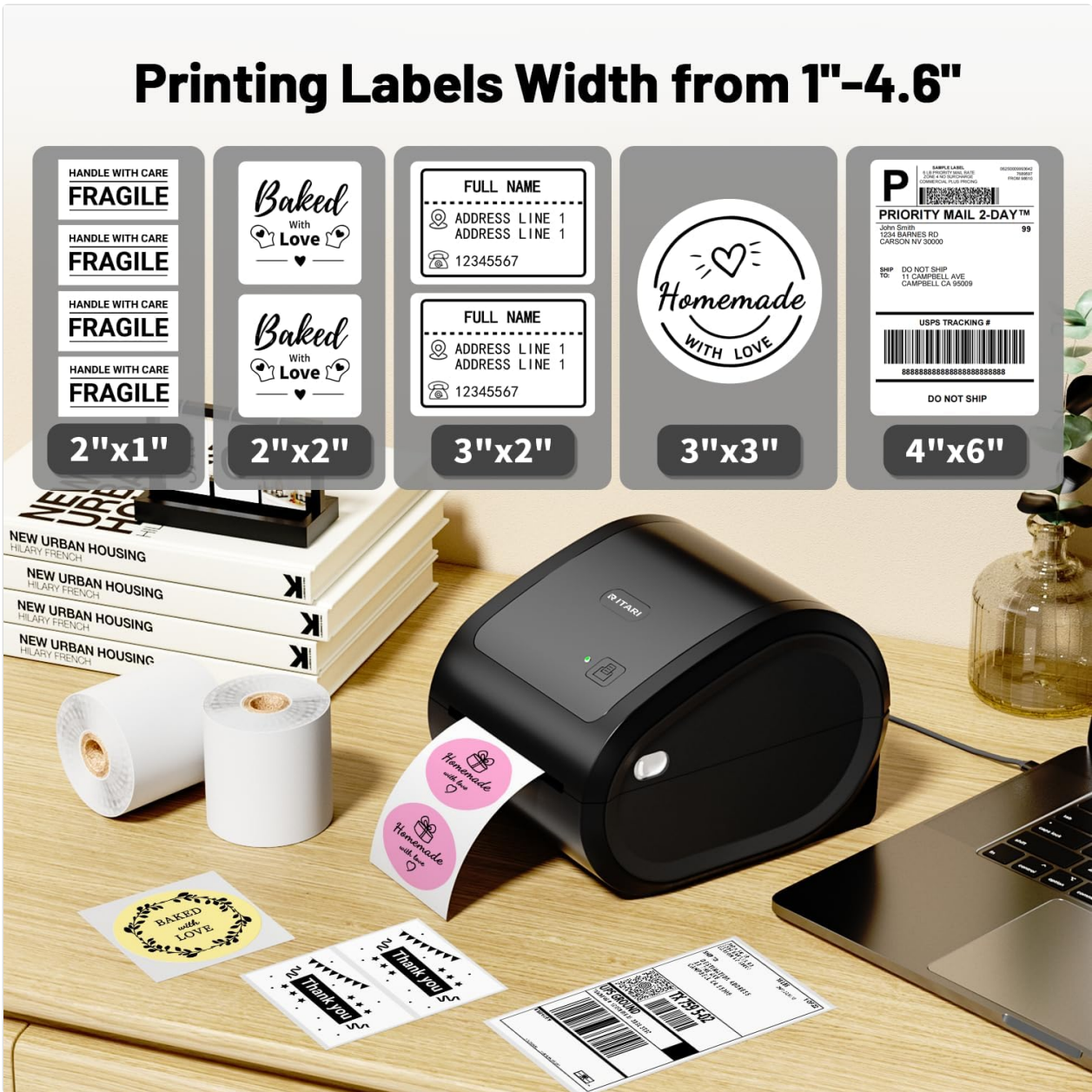
Image: Examples of various label sizes and types that can be printed, including 2x1, 2x2, 3x2, 3x3, and 4x6 inches, demonstrating the printer's versatility.

Video: Guide on how to set label dimensions (width and height) and adjust print quality and speed within the Labelife app for optimal printing results.