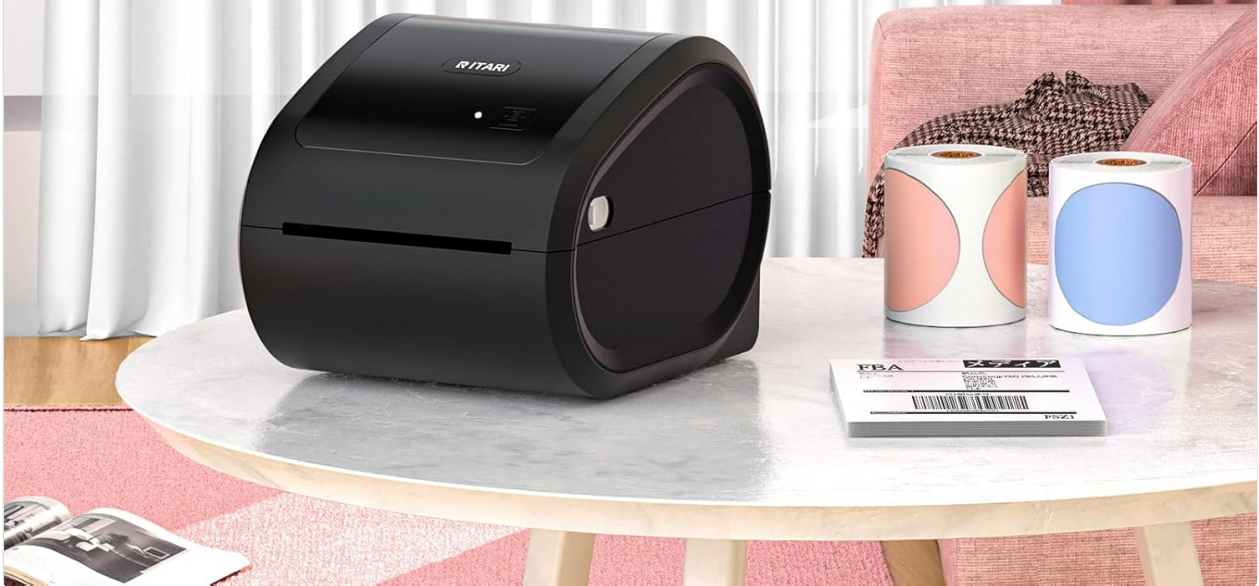
Image: The D520BT printer is compatible with major shipping and e-commerce platforms such as eBay, Shopify, Amazon, UPS, FedEx, DHL, Etsy, PayPal, and more.