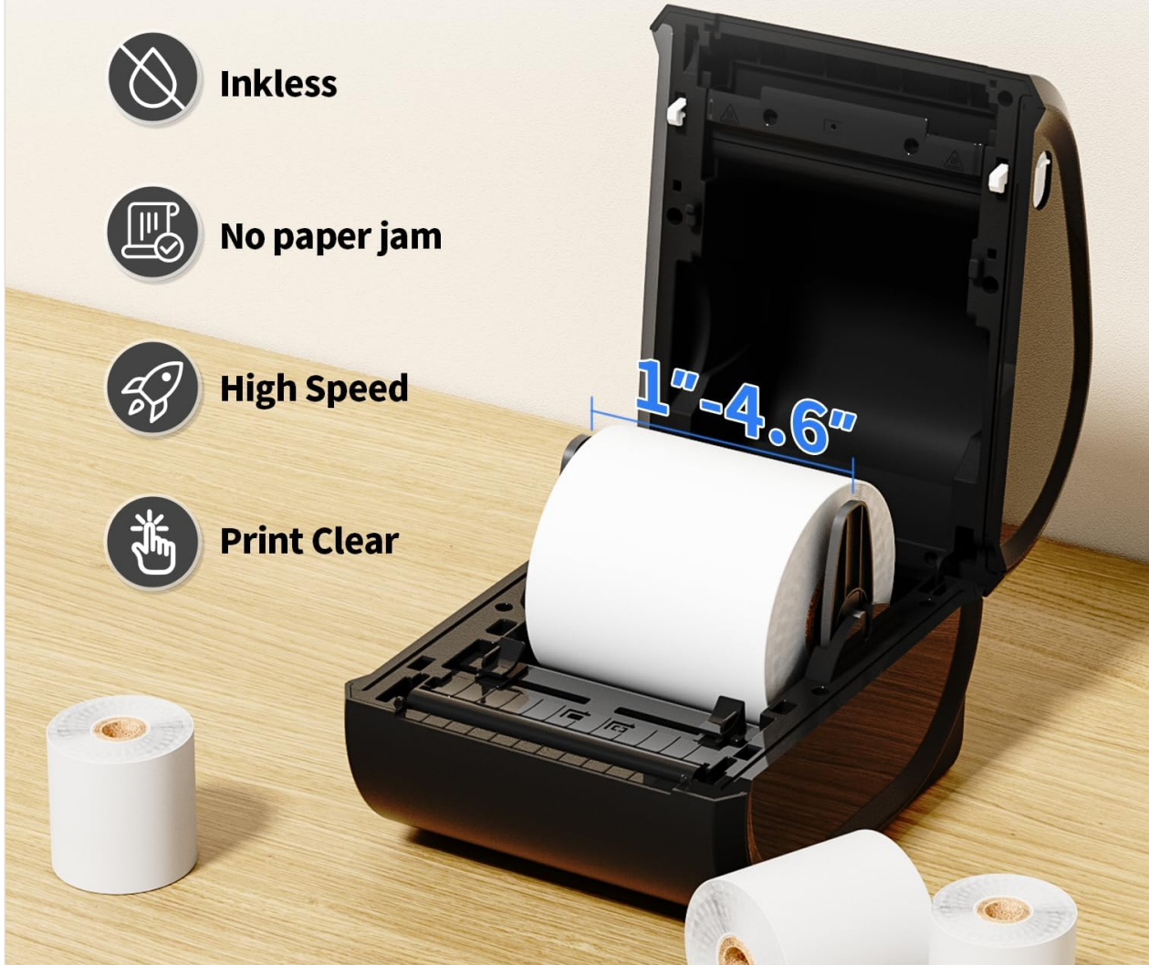
Image: Illustration of loading a thermal label roll into the printer's built-in label holder, showing the supported width range of 1 to 4.6 inches.