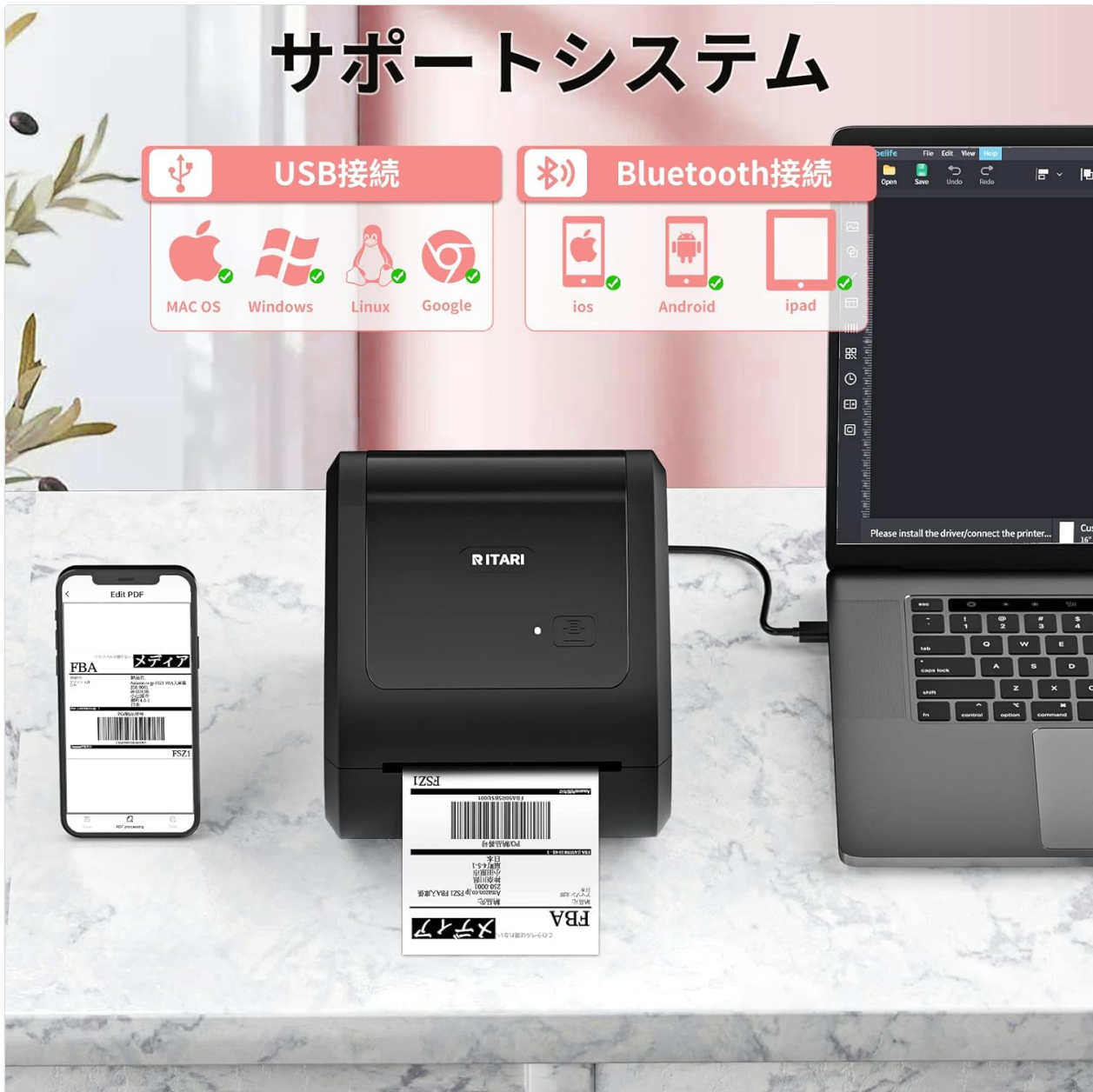
Image: The D520BT printer supports USB connection for Mac OS, Windows, Linux, and Google Chrome OS, and Bluetooth connection for iOS, Android, and iPad devices.