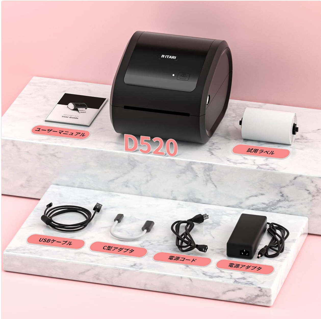
Image: Itari D520BT printer with included accessories: user manual, sample labels, USB cable, C-type adapter, power cord, and power adapter.