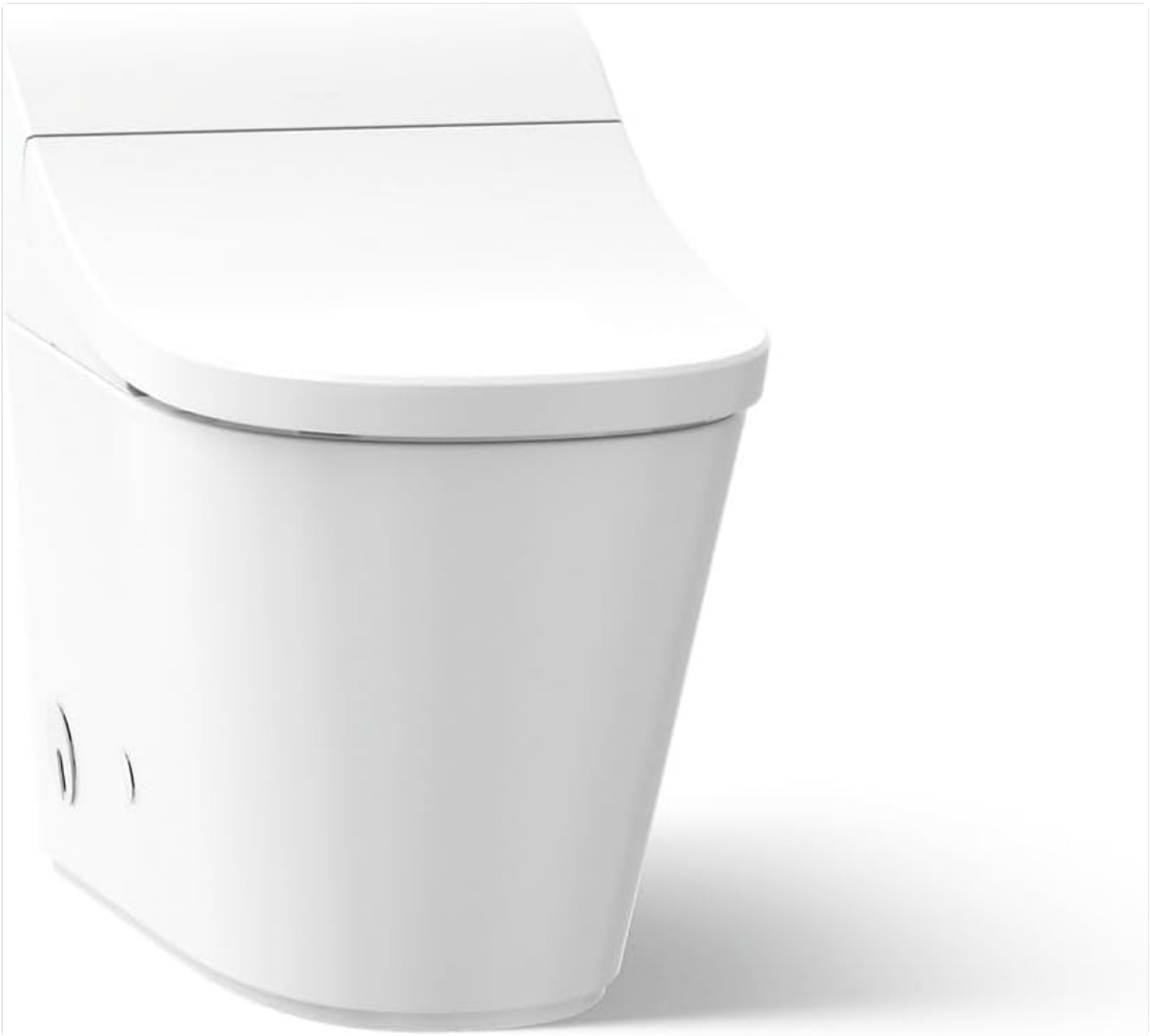
Figure 1: Front view of the Innate Smart Toilet.