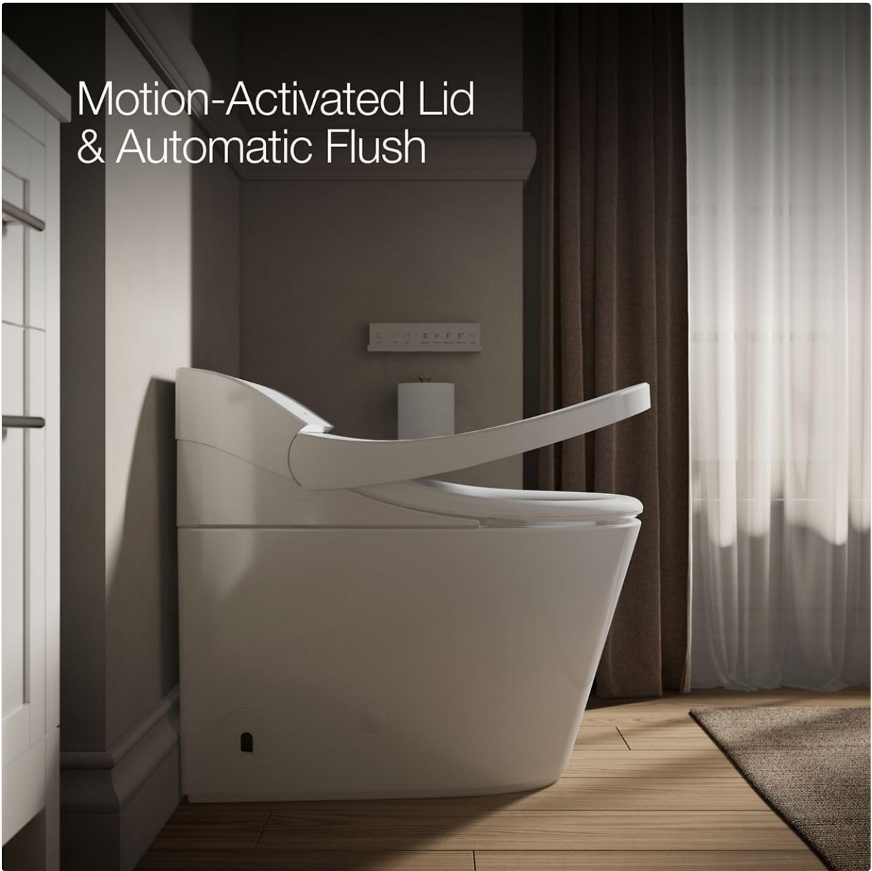
Figure 2: Motion-activated lid and automatic flush feature.