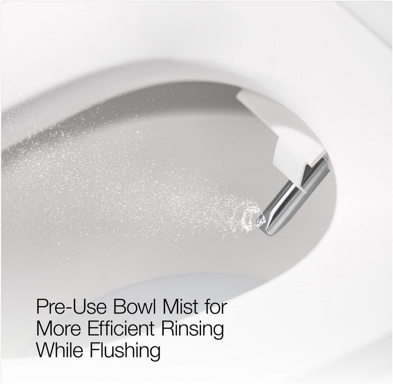
Figure 7: Pre-use bowl mist for efficient rinsing.