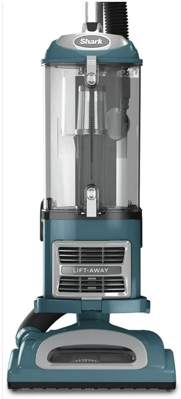
Figure 1: The Shark CU512 Lift-Away XL Upright Vacuum in its full upright configuration.