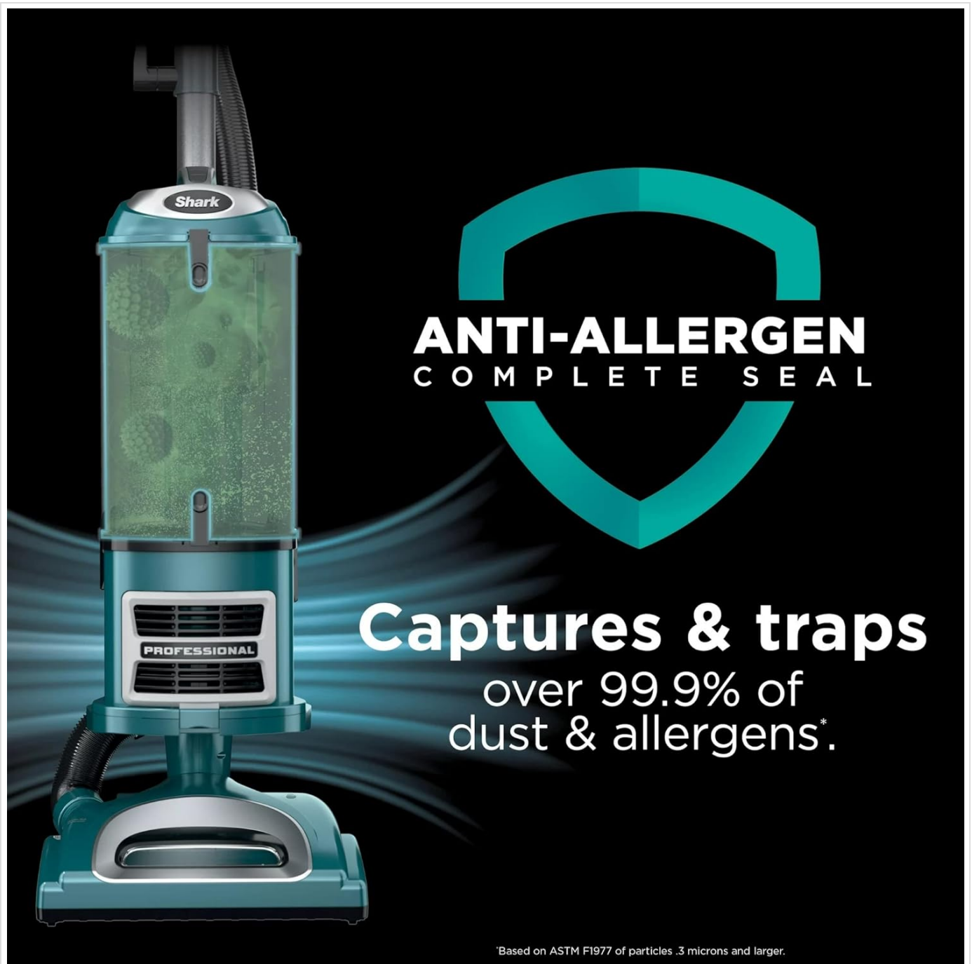
Figure 4: Anti-Allergen Complete Seal Technology captures and traps over 99.9% of dust and allergens.