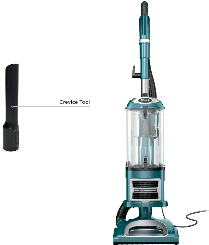
Figure 5: What's in the box: Main vacuum unit and crevice tool.