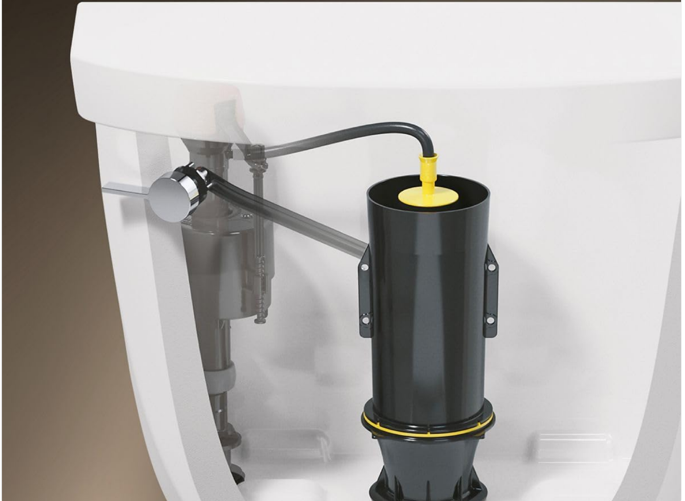
Figure 3.1: Diagram illustrating the AquaPiston® Technology, which delivers a powerful and effective flush.

AquaPiston® Technology Delivers Kohler's Most Powerful and Effective Flush