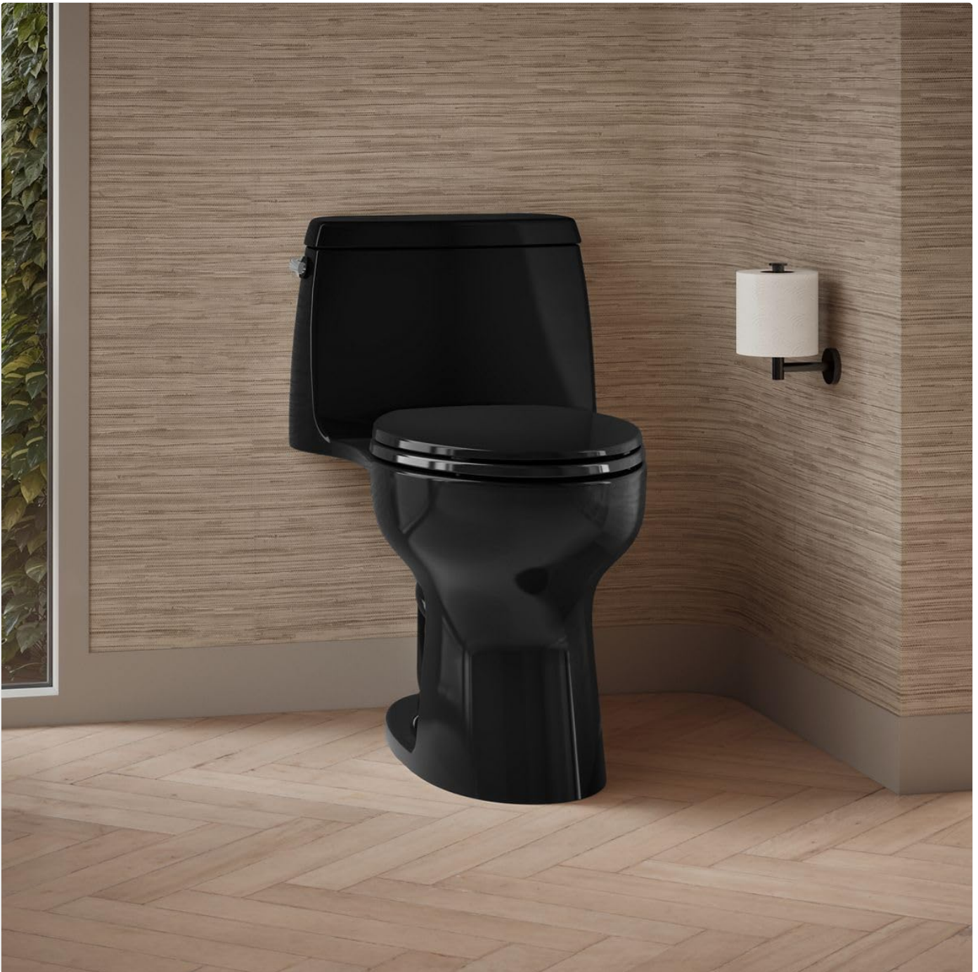
Figure 2.1: The Kohler Santa Rosa toilet seamlessly integrated into a modern bathroom setting.