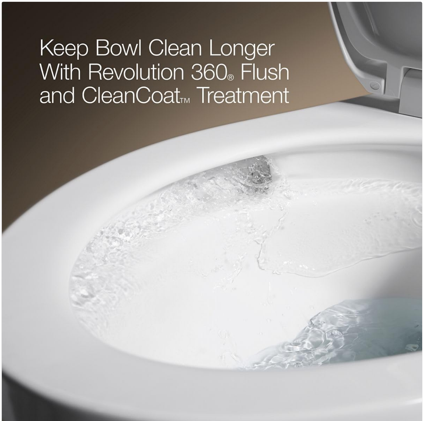
Figure 4.1: Visual representation of the Revolution 360® flush in action, demonstrating its powerful swirling motion for a cleaner bowl, complemented by the CleanCoat™ treatment.