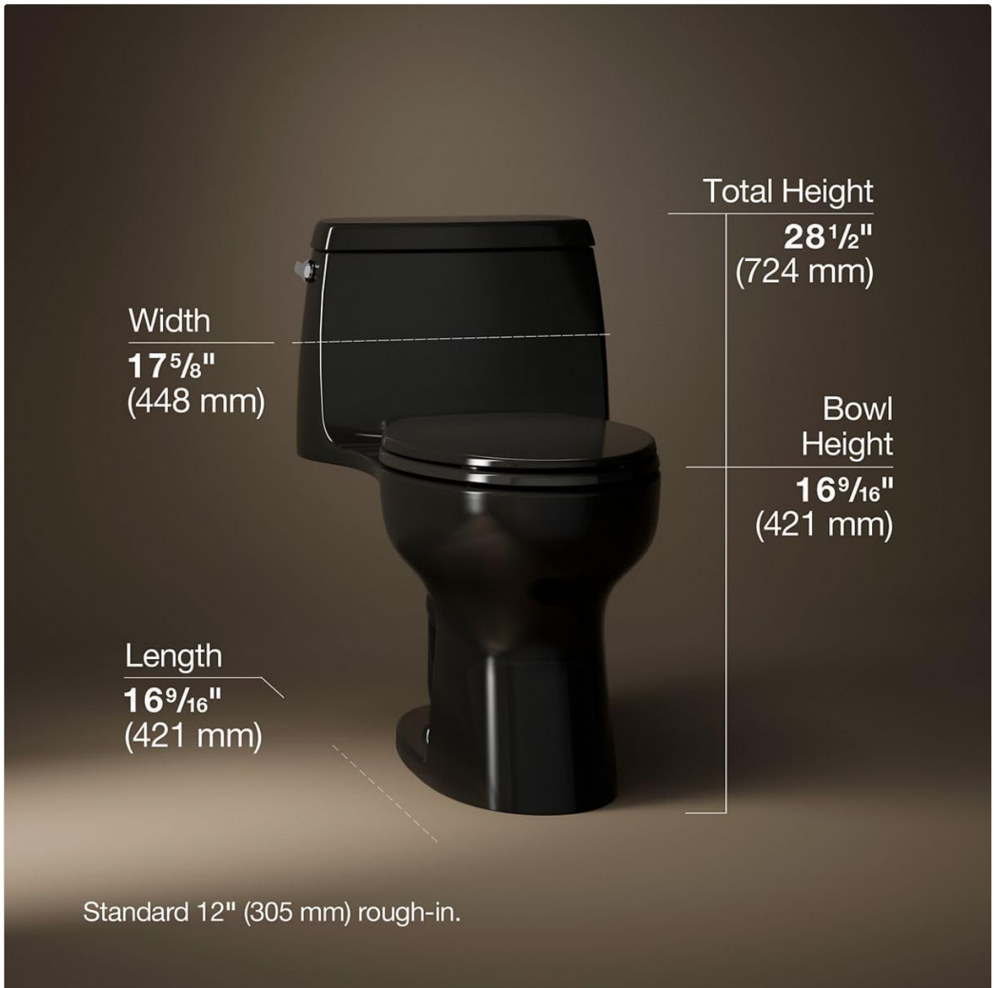
Figure 6.1: Detailed dimensions of the Kohler Santa Rosa toilet, including total height, width, length, and bowl height.