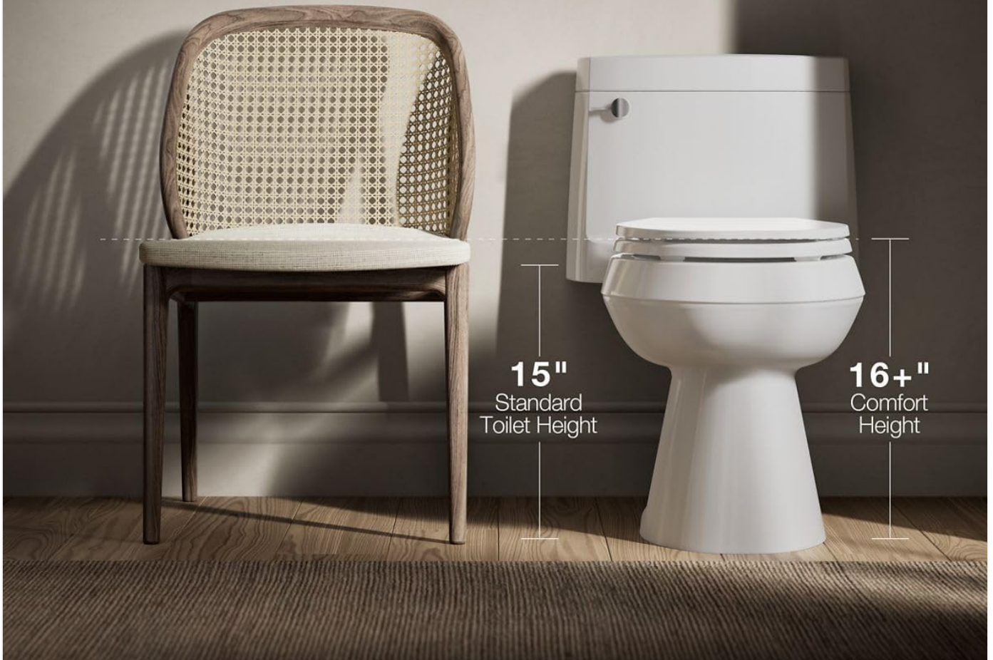
Figure 1.2: Illustration comparing standard toilet height to Comfort Height® seating, highlighting the ergonomic benefit.