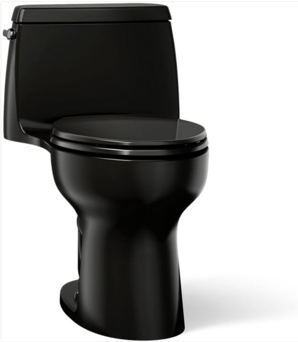
Figure 1.1: Front view of the Kohler Santa Rosa One-Piece Compact Elongated Toilet.