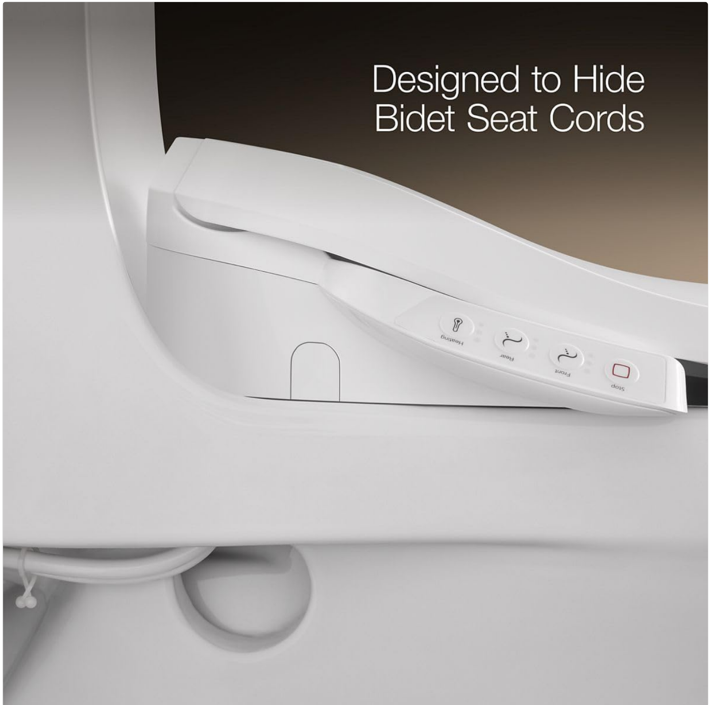
Figure 3.2: Close-up view showing the design feature for concealing bidet seat cords.

The design of the Santa Rosa toilet includes features to accommodate bidet seats, such as channels to hide bidet seat cords, ensuring a clean and integrated appearance.