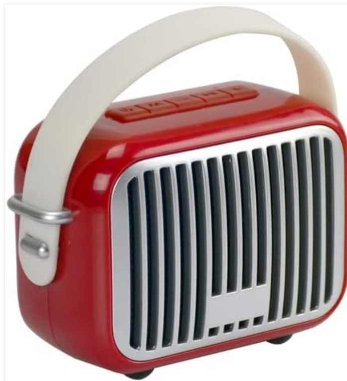
Image: Top view of the speaker, highlighting the control buttons for power, volume, and playback.

The speaker features intuitive button controls located on the top panel.