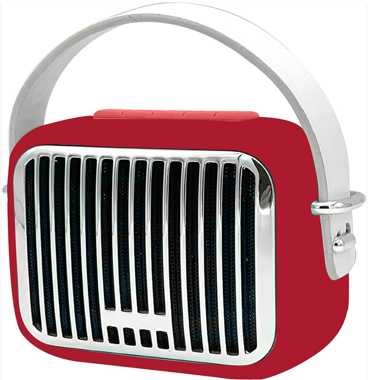
Image: Front view of the Wireless Express Compact Mini Bluetooth Speaker in red, featuring its retro grille and white carrying handle.