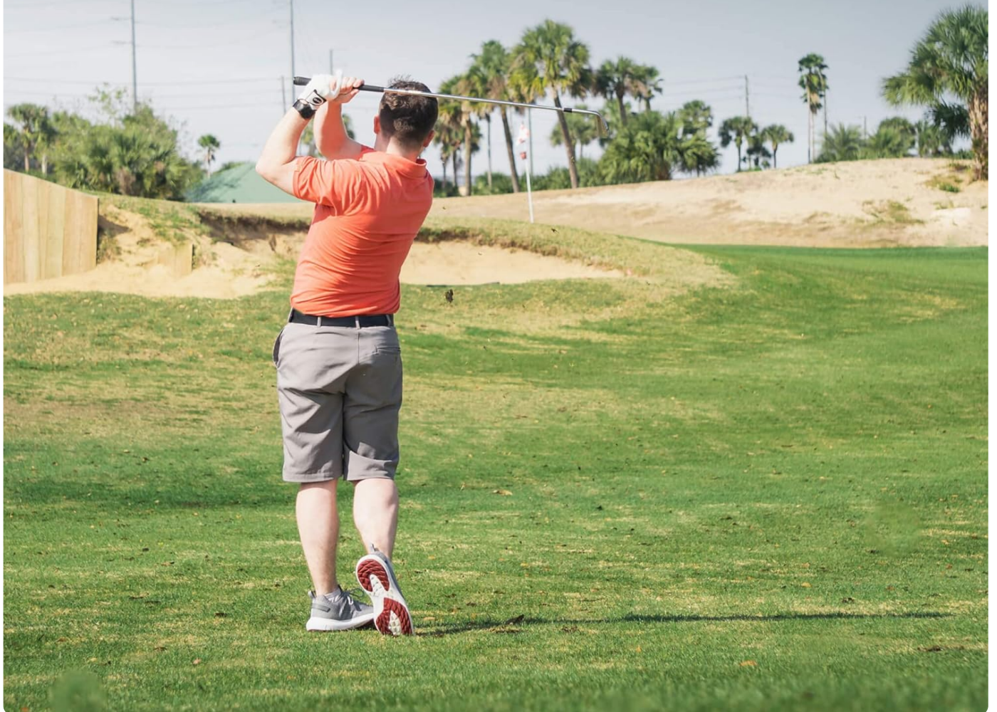
Image: A golfer on a course, illustrating the vast database of over 36,000 preloaded courses available on the Shot Scope X5.