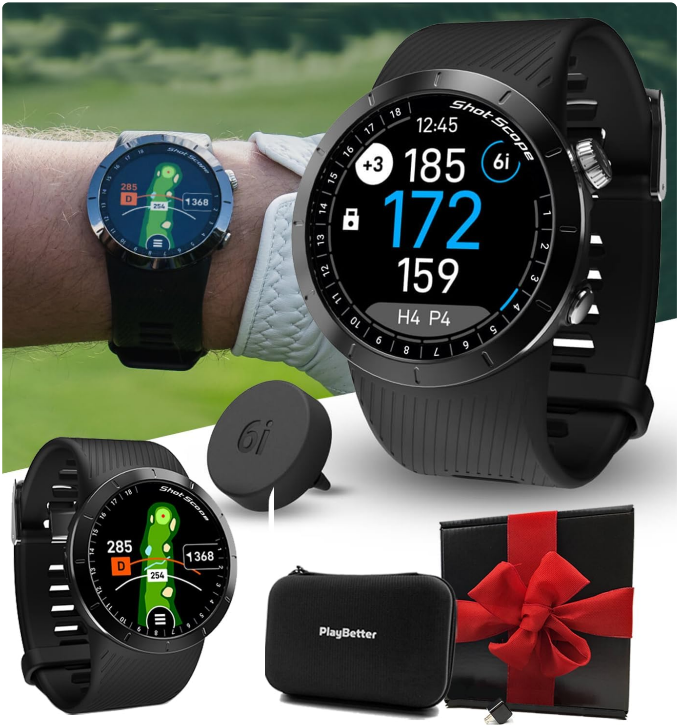
Image: The Shot Scope X5 watch on a golfer's wrist, showing precise yardages to the green, highlighting its primary function.