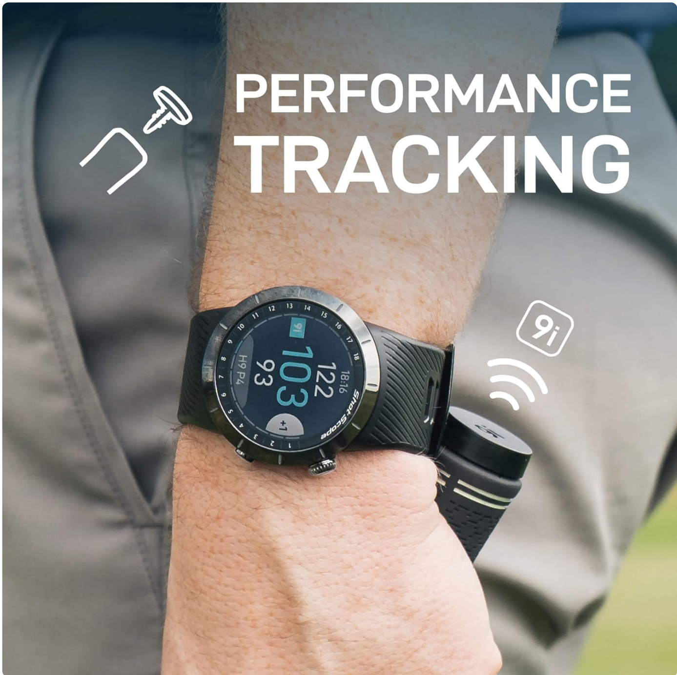
Image: A golfer wearing the Shot Scope X5 watch, with a shot tracking tag visible, demonstrating the automatic performance tracking capability.