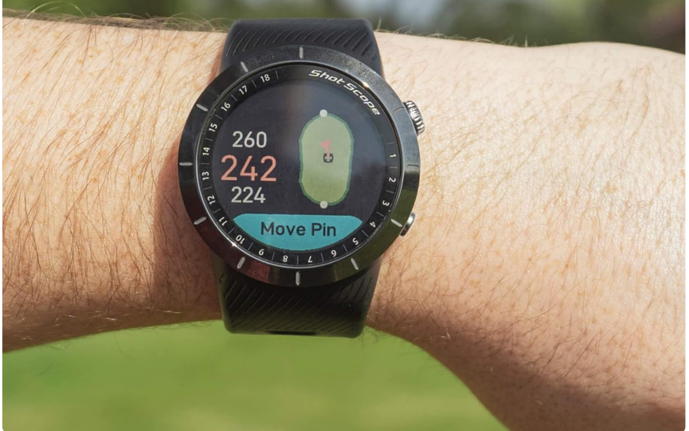
Image: A close-up of the Shot Scope X5 watch face, illustrating the Green View feature with adjustable pin placement for accurate yardages.