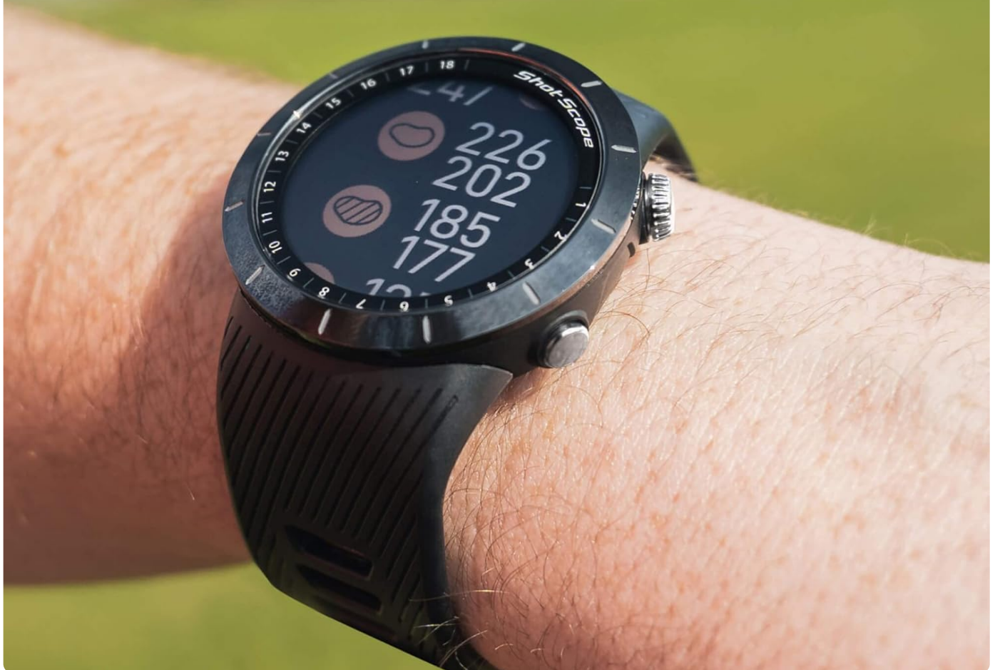
Image: The Shot Scope X5 watch on a golfer's wrist, showing the Hazards & Layups feature, providing distances to obstacles and strategic points.