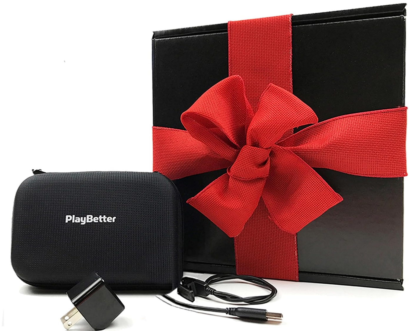
Image: The complete Shot Scope X5 gift box bundle, showcasing the watch, 16 shot tracking tags, USB charger, PlayBetter wall adapter, and a protective hard case.