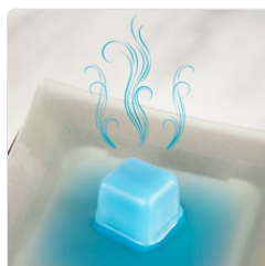
Image: Wax melting in dish