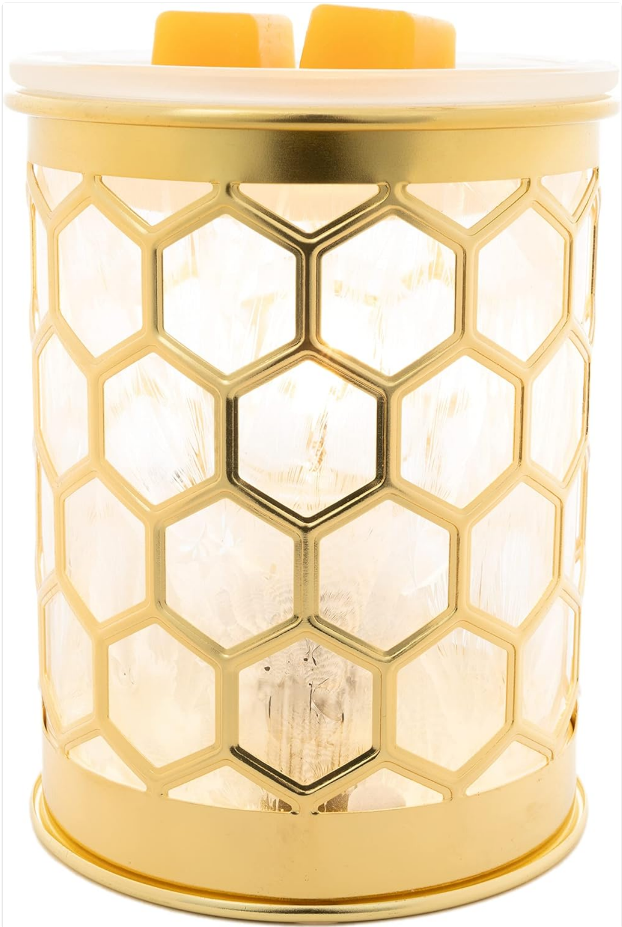
Image: Scentsationals Honeycomb Capiz Wax Melt Warmer