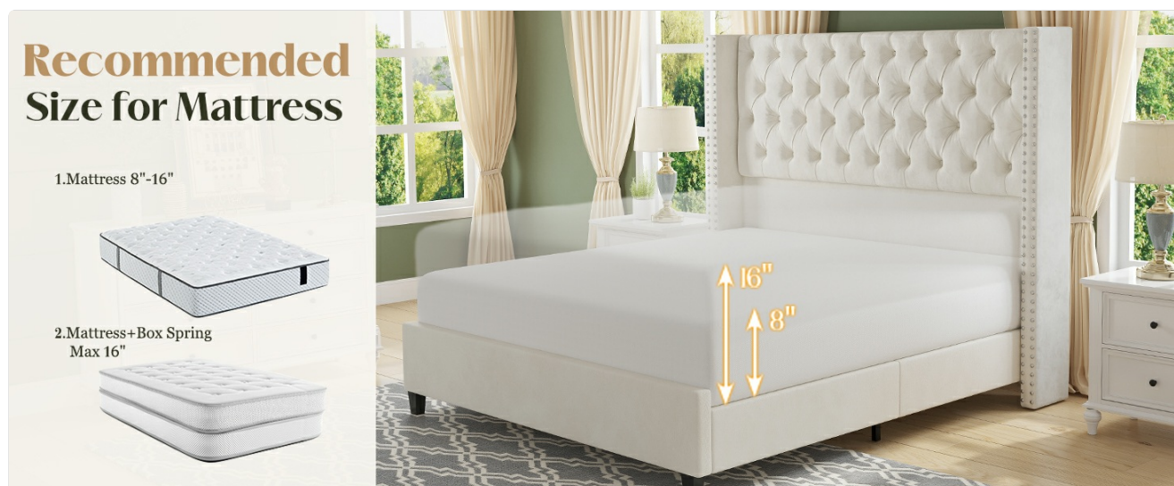
Image: Recommended mattress and mattress with box spring height guidelines.

This bed frame is compatible with King-size mattresses. The recommended mattress thickness is between 8 and 16 inches . If using a box spring, the combined height of the mattress and box spring should not exceed 16 inches.