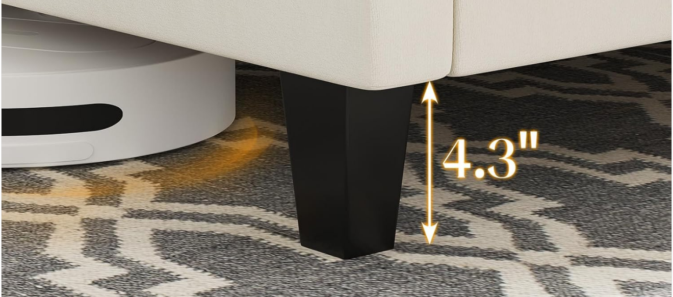
Image: The 4.3-inch under-bed clearance is designed to be robot vacuum-friendly for convenient cleaning.