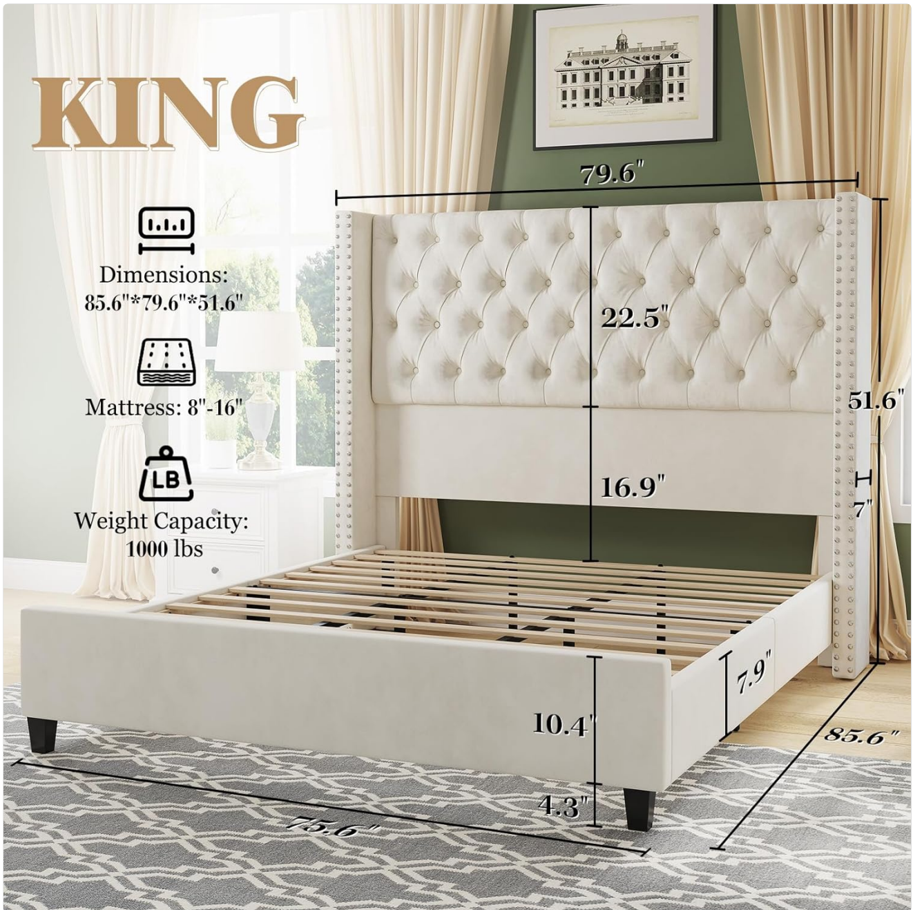
Image: Overall dimensions of the King Upholstered Bed Frame. Dimensions are approximately 85.6"L x 79.6"W x 51.6"H. The under-bed clearance is 4.3 inches, and the recommended mattress thickness is 8-16 inches.