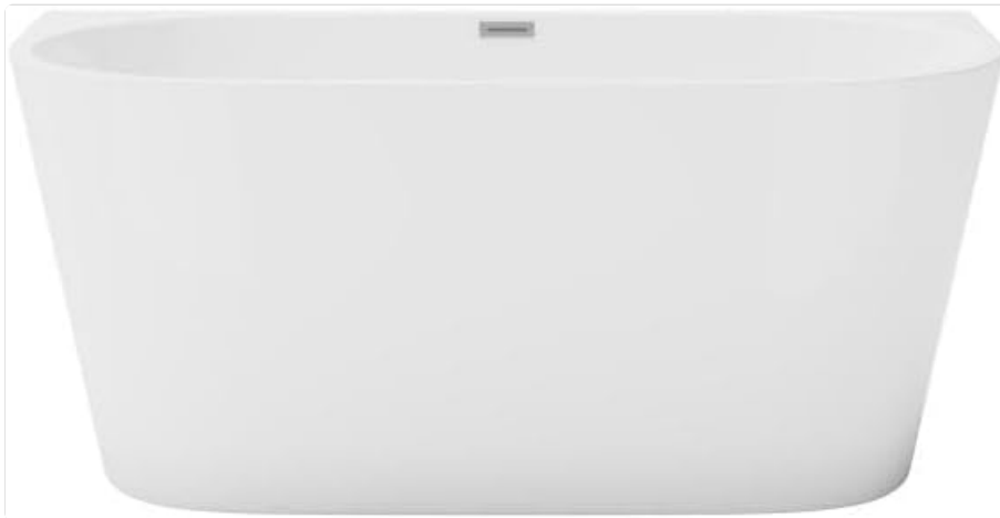
Front view of the DIVINA bathtub, showcasing its sleek white acrylic finish and semi-island design, ideal for modern bathrooms.

The Vente-unique DIVINA semi-island bathtub offers a contemporary design with practical features, making it a stylish and functional addition to your bathroom space.