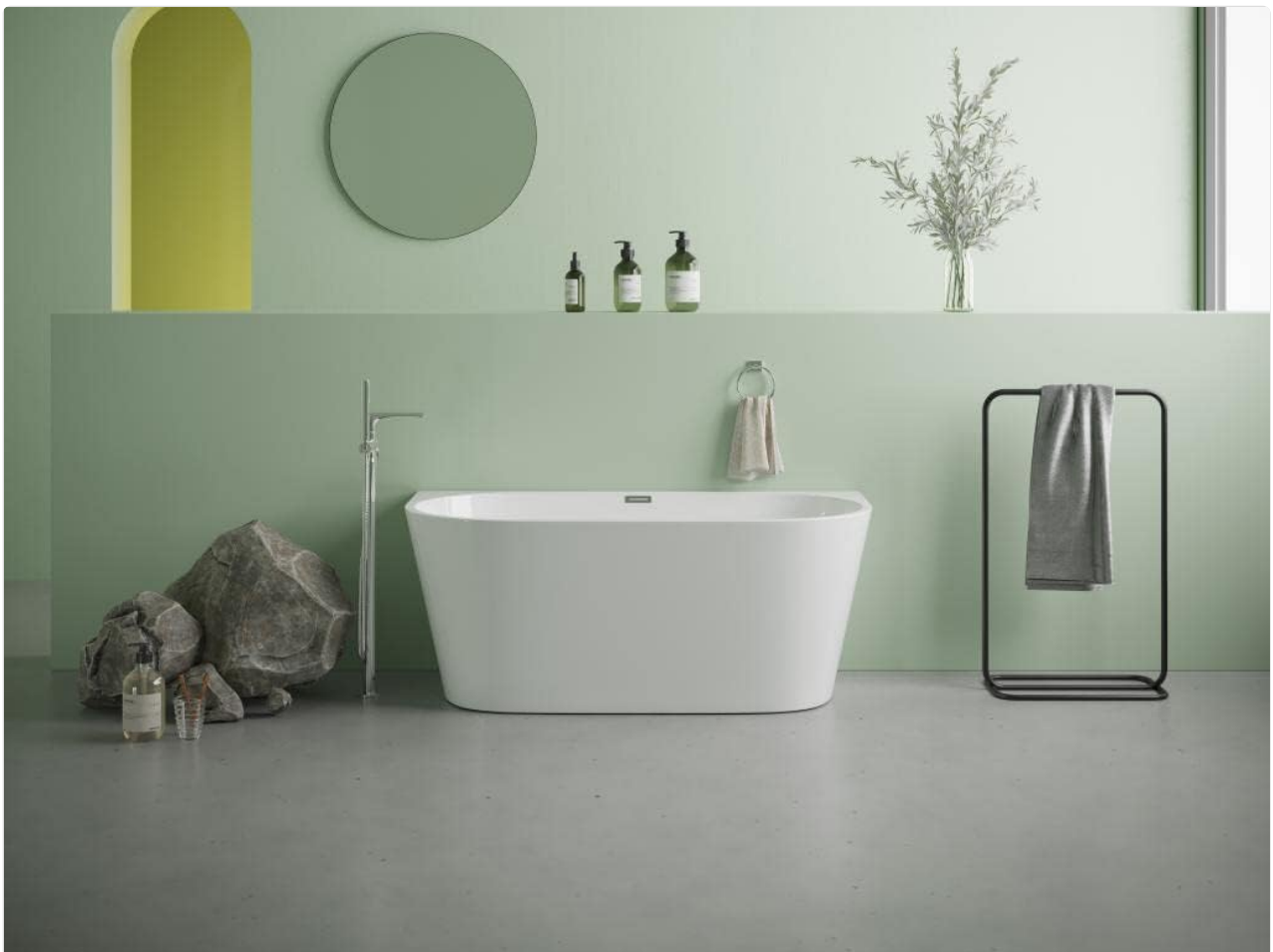
The DIVINA bathtub elegantly integrated into a modern bathroom, demonstrating its aesthetic appeal and how it complements contemporary decor.