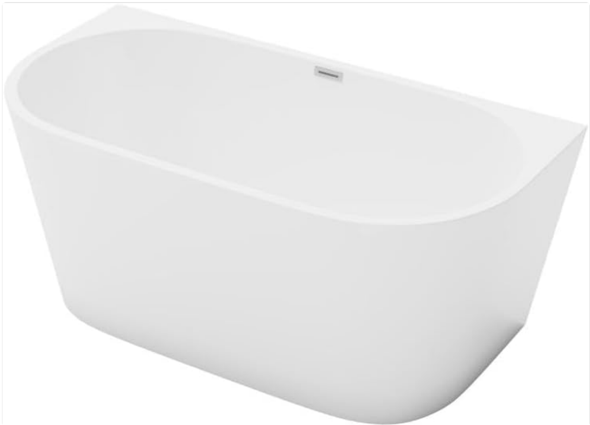
Image: Top-down view of the Vente-unique DIVINA semi-island bathtub, highlighting its oval interior and the placement of the integrated overflow and waste system.