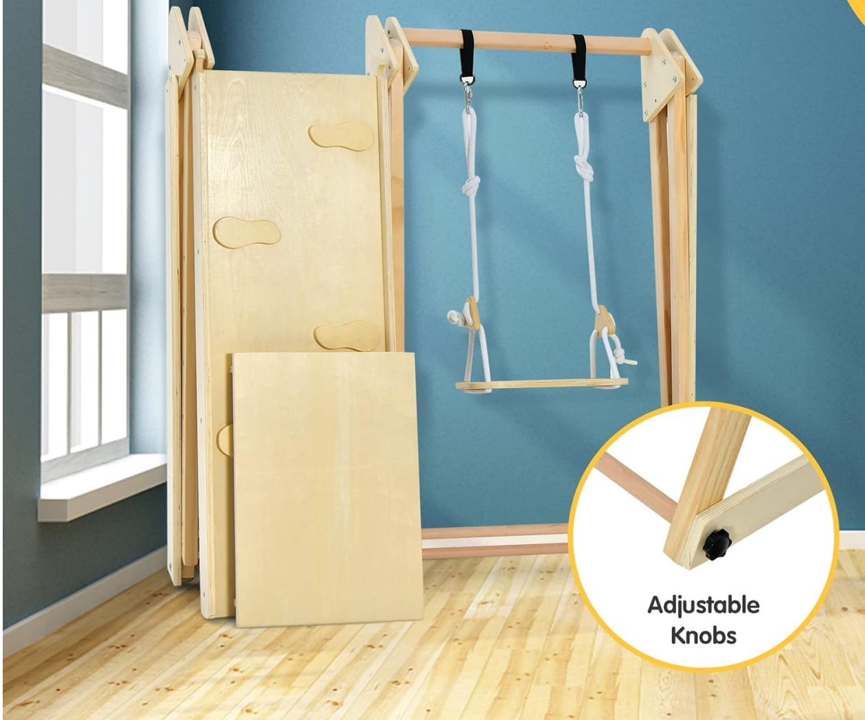
Image Description: Detailed images highlighting the rounded edges, smooth surfaces, hidden screws, and easy-grip sticks, emphasizing the safe and sturdy design for toddlers.