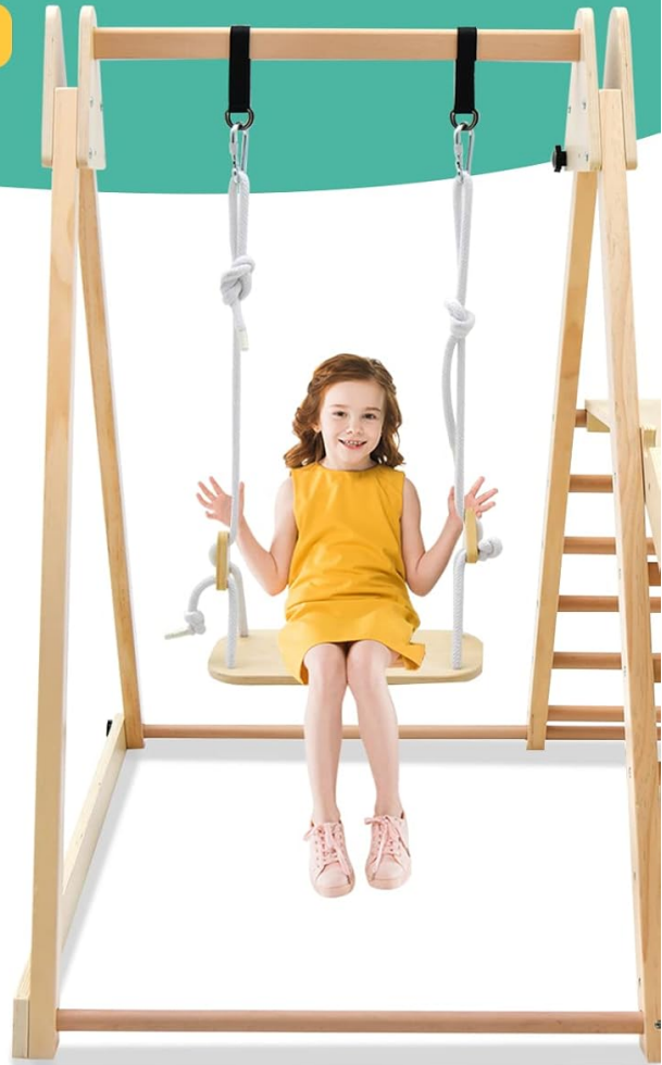
Image Description: An infographic illustrating the four play modes: swing, ladder, climber, and slide, showcasing the versatility of the jungle gym.