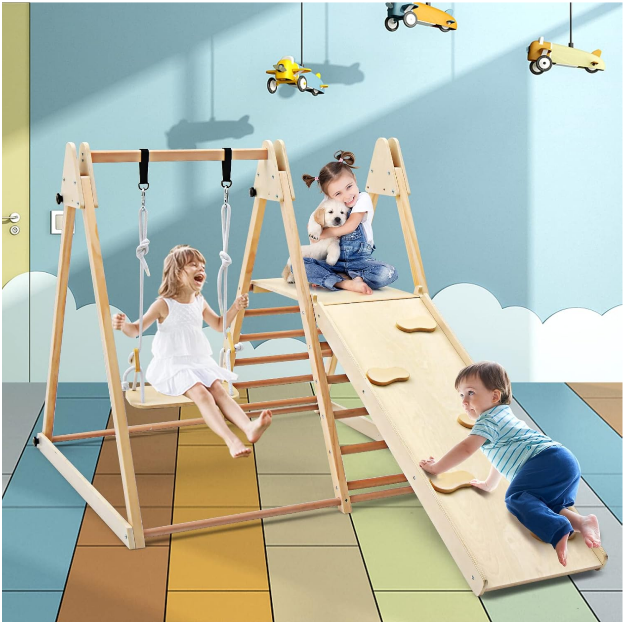
Image Description: A fully assembled Olakids Indoor Jungle Gym in a natural wood finish. One child is on the swing, and another is climbing the ramp, demonstrating the 4-in-1 functionality.