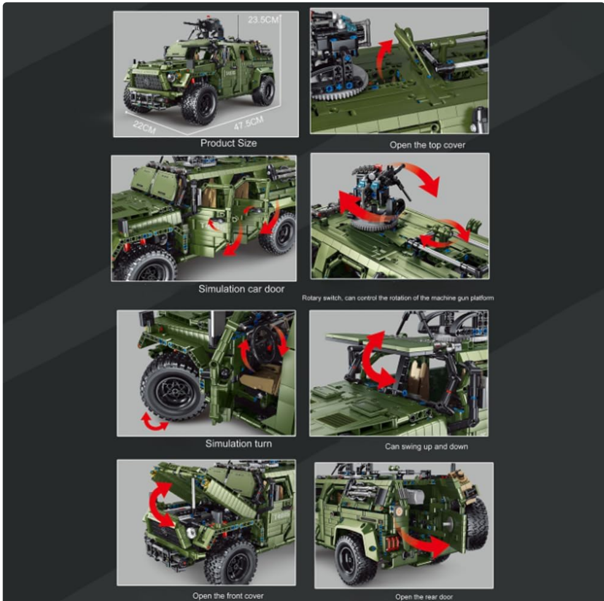
Image 3.1: Overview of product dimensions and various functional parts, including opening covers and rotating mechanisms.