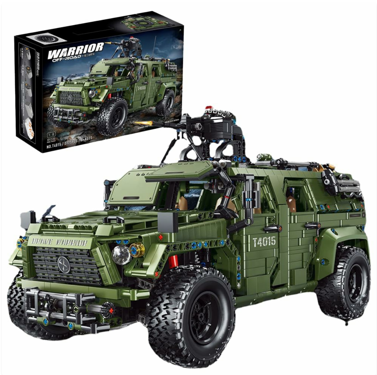
Image 1.1: Front view of the assembled T4015 Warrior Military Car model.