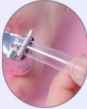
Trim nail tip