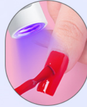
Apply nail polish and cure 60 s