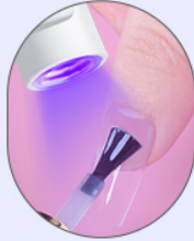
Apply base coat and cure for 60 s