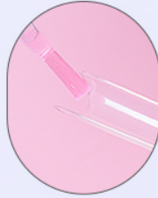
Apply glue to the inside of the nail tip