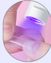
Press the nail tip to cure for 5s