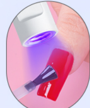
Apply top coat cure 120 s

Detailed steps for applying and curing gel nails using the mlogiroa Mini UV Nail Lamp.