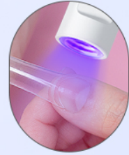
Release the nail tip to cure for 60s