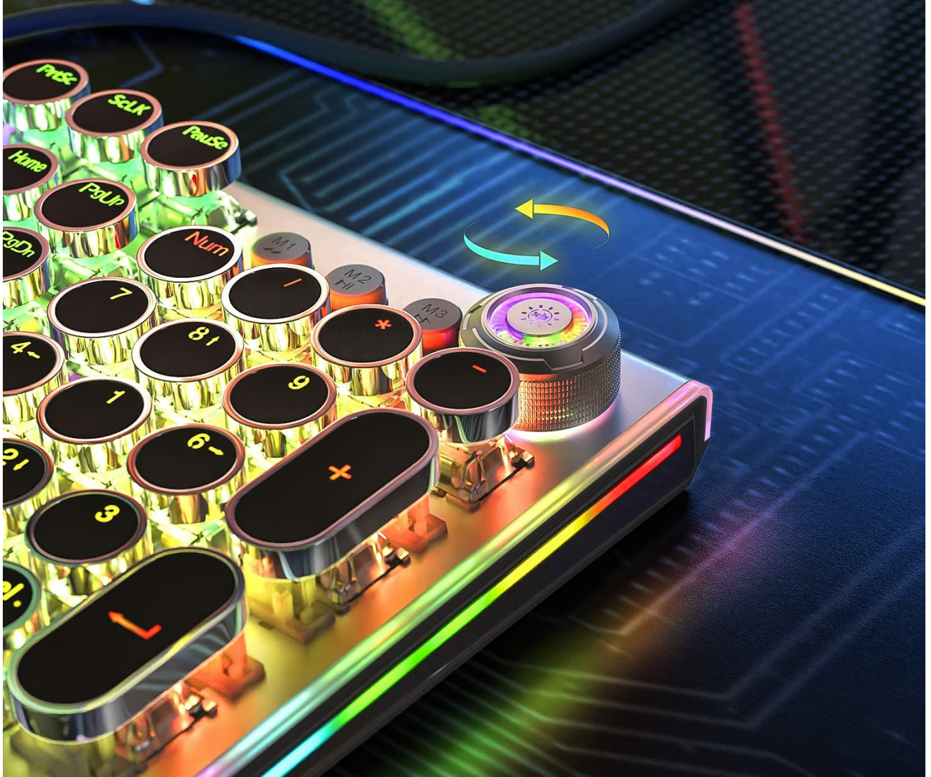
Image: A close-up of the multi-function knob on the keyboard, indicating its use for adjusting lightness and volume.