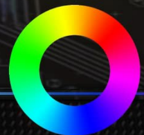
Image: A full view of the TEWELL T-K82 keyboard, suggesting customization options for its lighting.