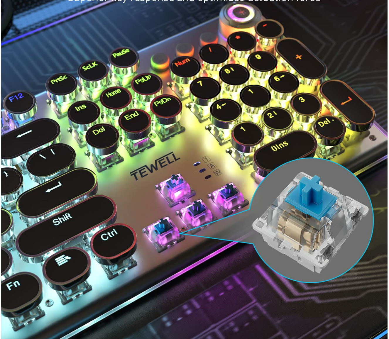
Image: A detailed view of the blue mechanical switches, highlighting their tactile and clicky nature for superior key response.

Superior key response and optimized actuation force