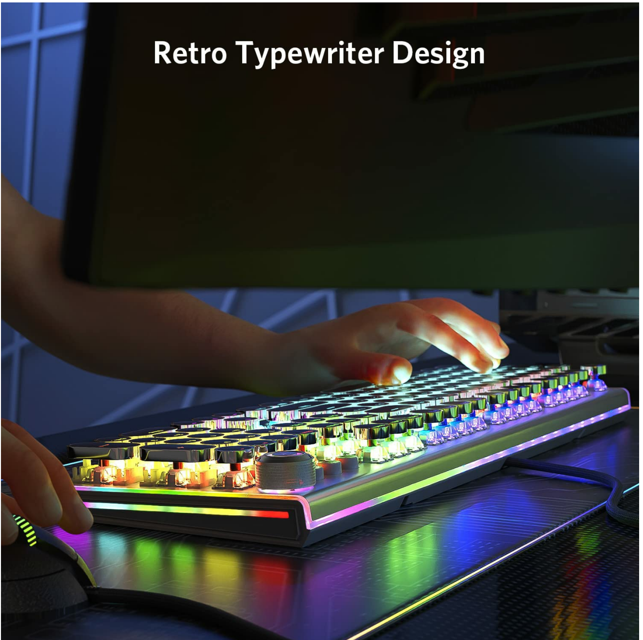
Image: A user typing on the TEWELL T-K82 keyboard, showcasing its retro typewriter design and illuminated keys.