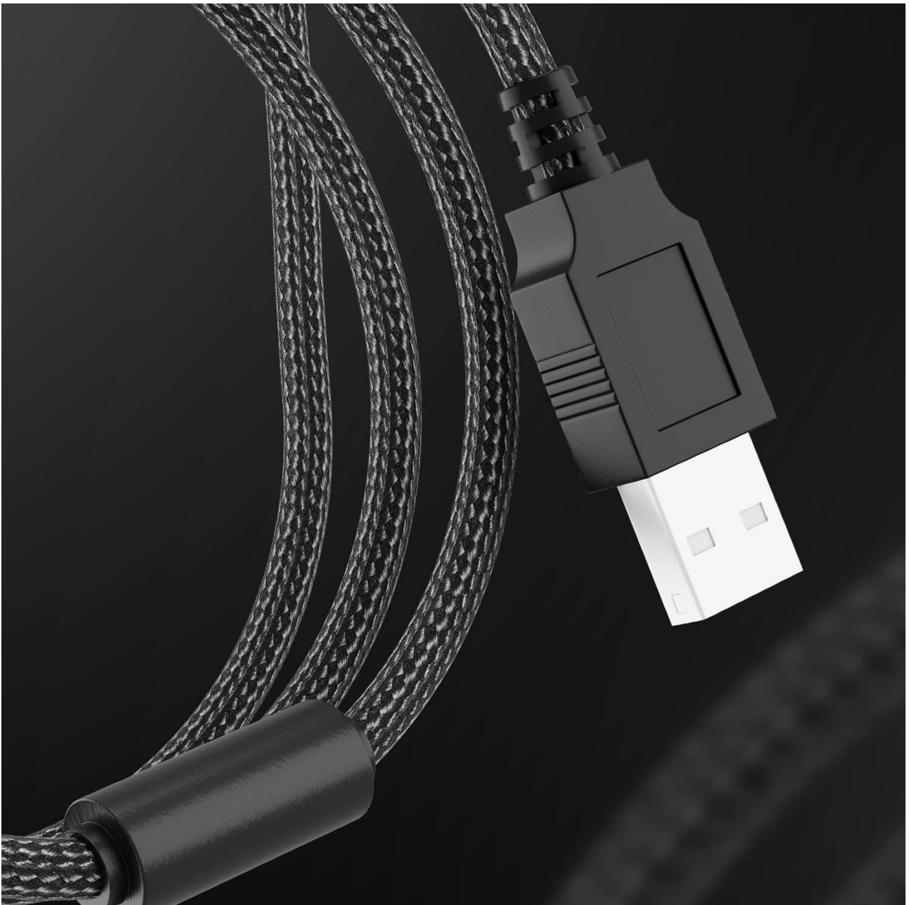
Image: A close-up view of the durable, braided USB cable, which connects the keyboard to the computer.