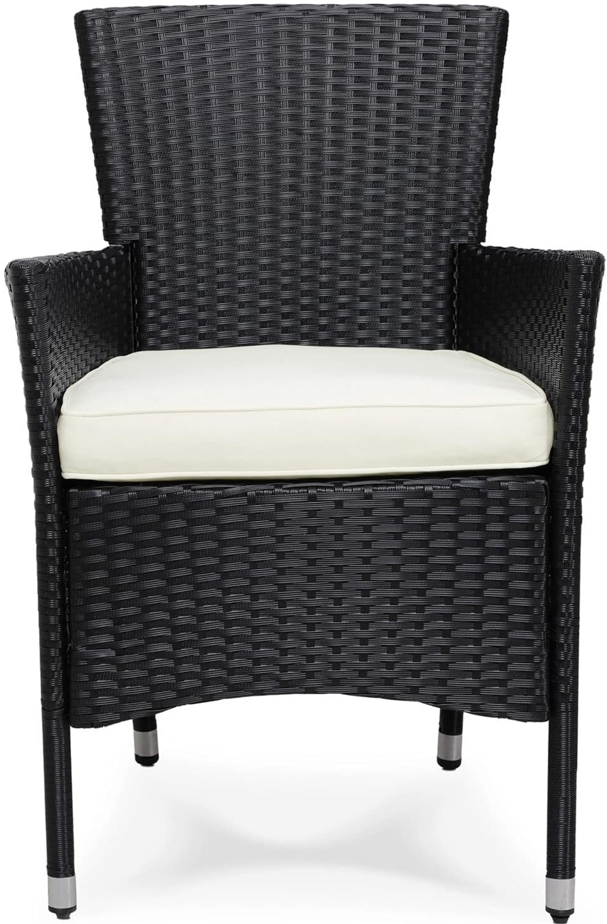
Image 1.1: Front view of the CASARIA® poly rattan garden armchair with cushion.