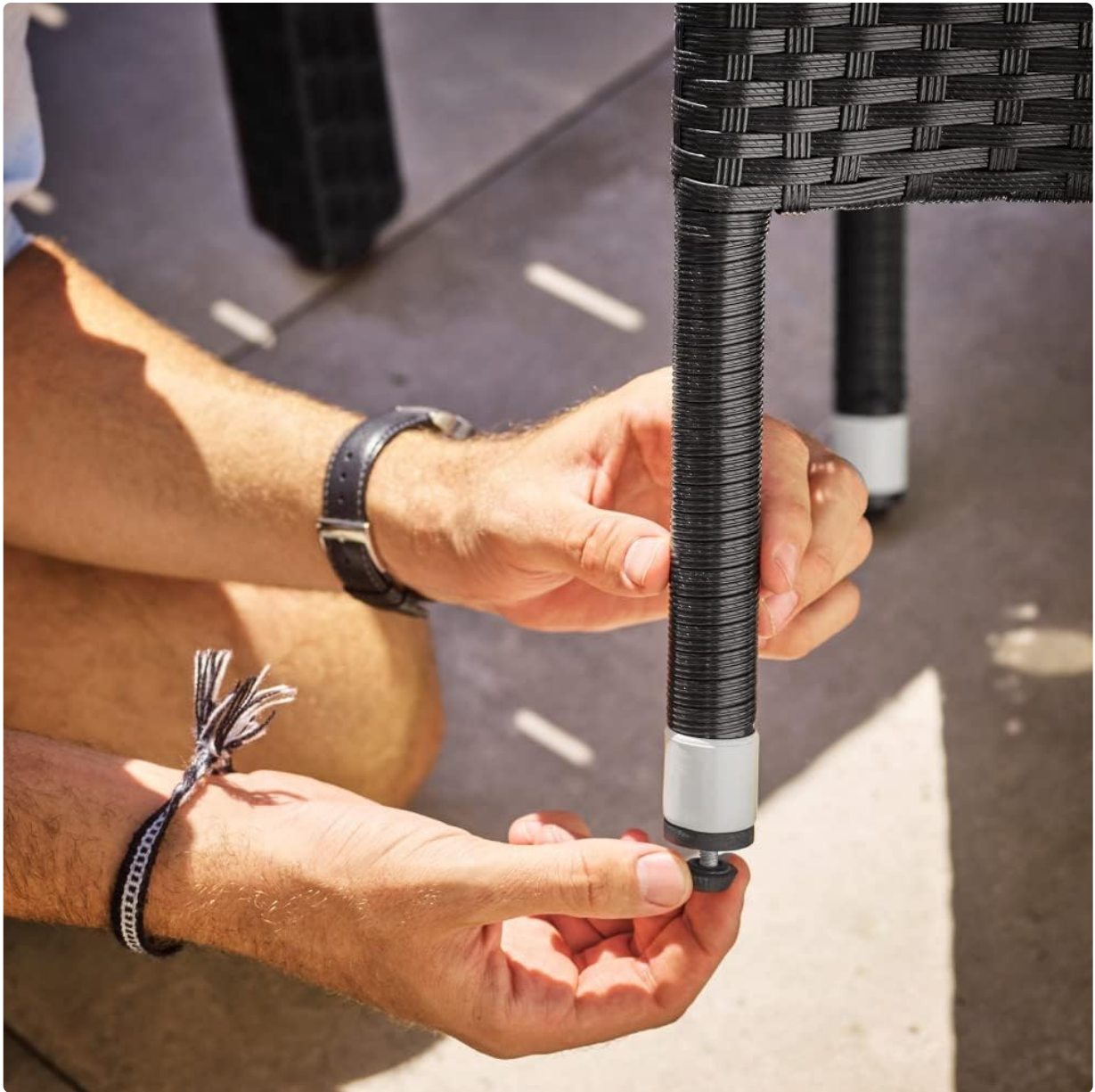
Image 3.1: Adjusting the leveling screw on a chair leg for stability.