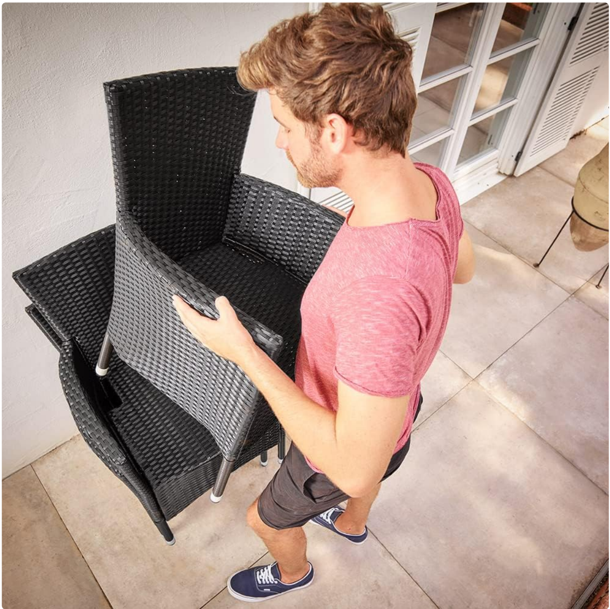
Image 4.1: Demonstrating the stackable feature of the chairs for compact storage.