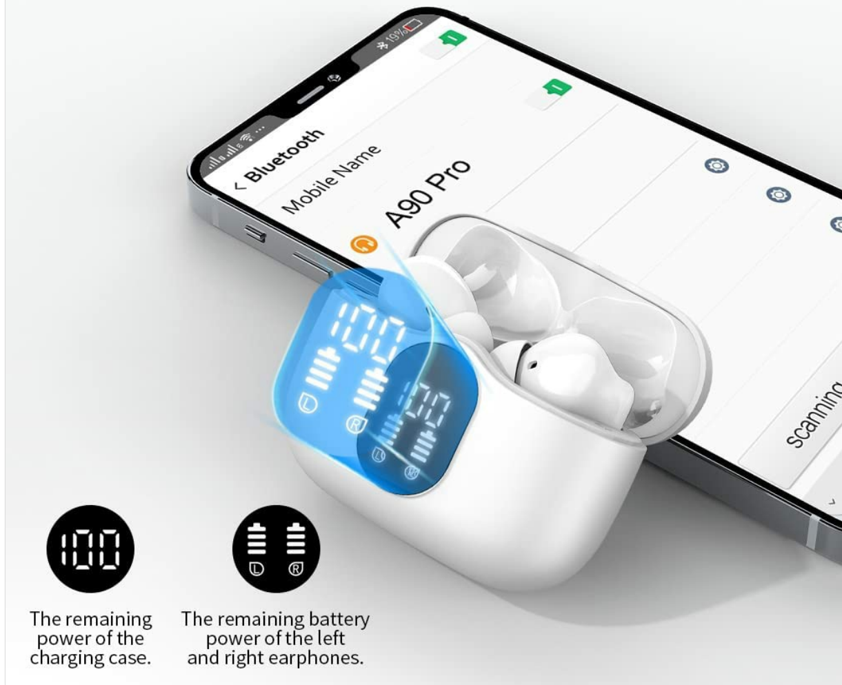
Figure 4: Playtime and Charging. This image highlights the total playtime of over 36 hours with the charging case, 6-8 hours on a single earbud charge, and a 1.5-hour fast charging time via USB-C.

With a digital LED display, it clearly shows the power of the charging box and earphones.