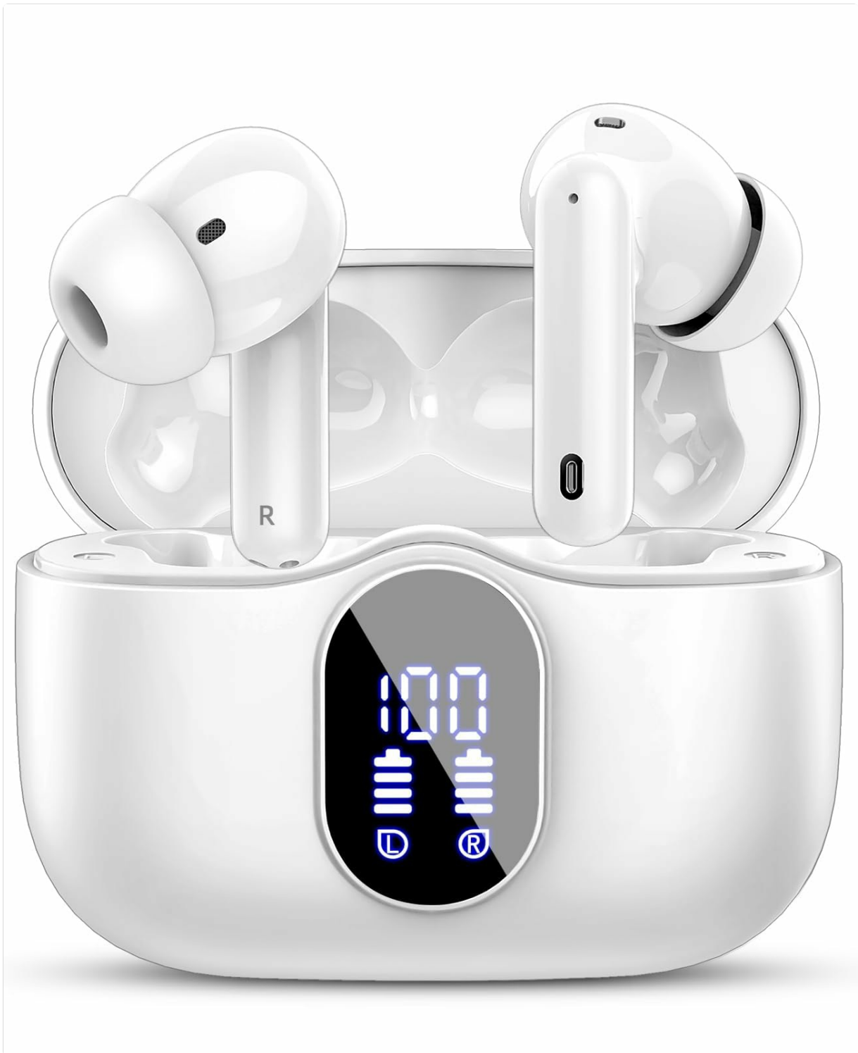
Figure 1: Earbud Acoustic Structure and Eartips. The image illustrates the 13.0mm speaker unit and nano-scale material designed for clear sound, along with three pairs of different sized ear caps (S/M/L) for an ergonomic and secure fit, reducing noise by 80%.