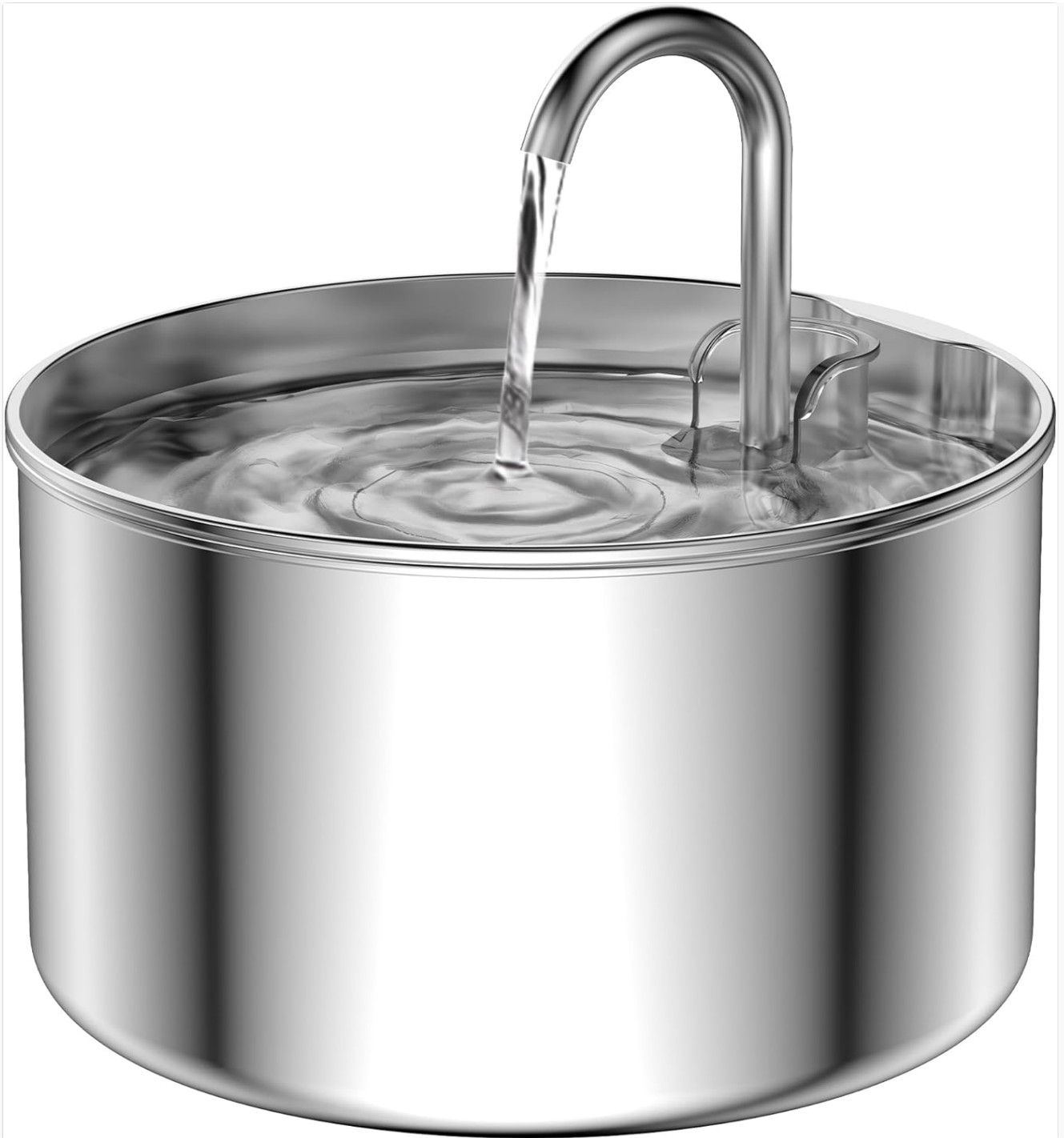
Image: The AOOGITF S5 Stainless Steel Pet Water Fountain fully assembled and operating, with water flowing from the faucet spout into the bowl.