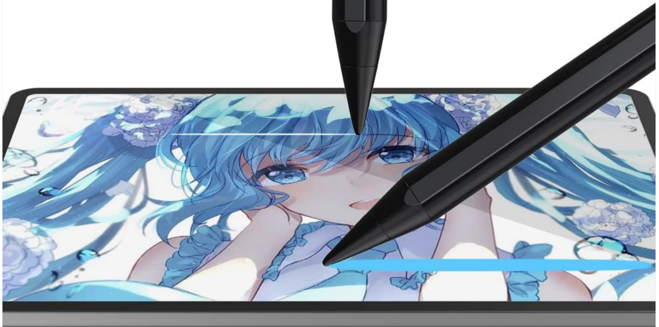
Image: A visual representation of the tilt recognition function, demonstrating how tilting the pen at angles like 15°, 30°, and 60° affects line thickness, making it suitable for various drawing styles.