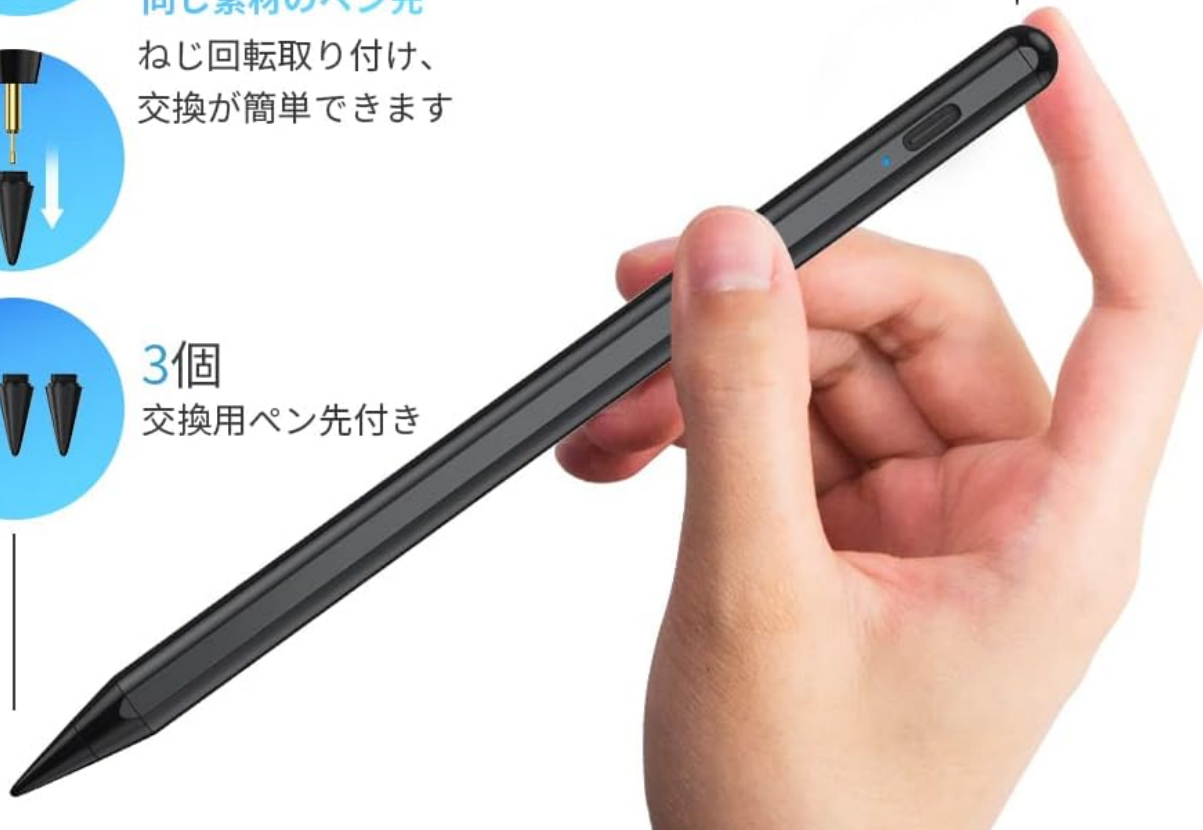
Image: Instructions for powering the pen on/off by tapping the top. Also illustrates how to twist and replace the pen tip, showing three spare tips included.