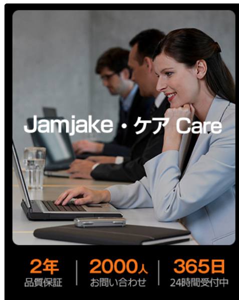
Image: JAMJAKE customer care team, emphasizing 2-year quality guarantee and 24-hour support.

We are committed to providing excellent customer service and support.