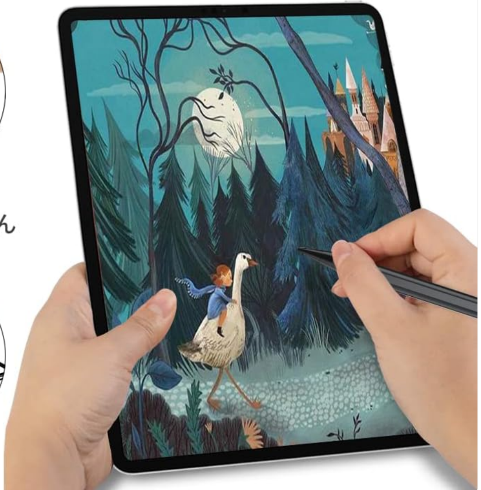
Image: Two examples showing the palm rejection feature in action. A user's hand rests on the iPad screen while drawing, indicating that gloves are not required for comfortable use.