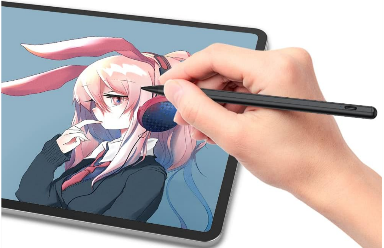
Image: A hand using the JAMJAKE Stylus Pen to draw on an iPad screen, highlighting its high precision and smooth performance for drawing and writing.