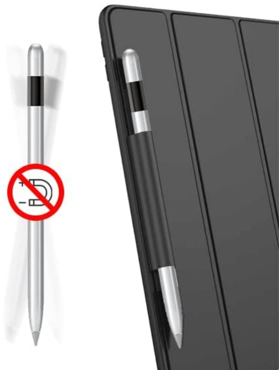
Image: A comparison demonstrating the strong magnetic adsorption of the JAMJAKE pen to an iPad, contrasting it with a pen lacking this feature, which would require an iPad case for storage.