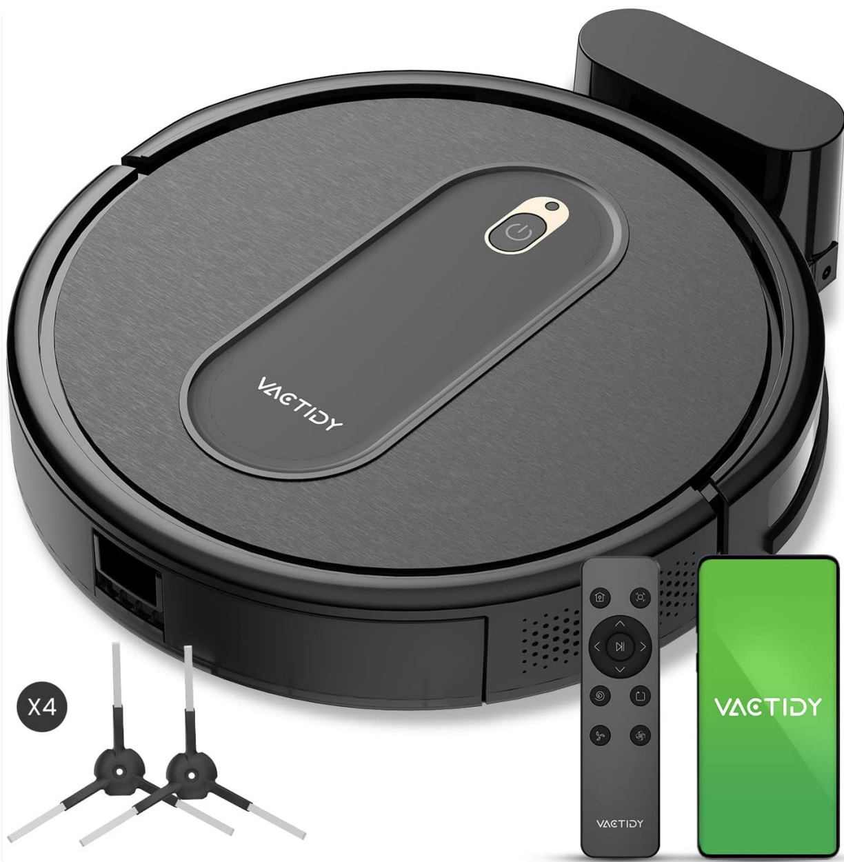
Figure 1.1: Vactidy T6 Robot Vacuum and included accessories.

The Vactidy T6 Robot Vacuum is designed to provide efficient and convenient cleaning for your home. With powerful suction, a slim design, and multiple cleaning modes, it simplifies daily floor care. This manual will guide you through the proper use and maintenance of your device.