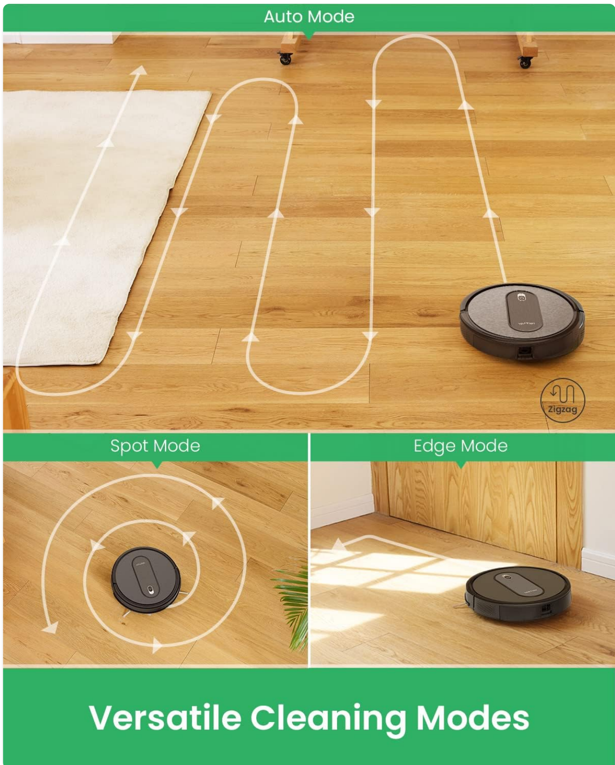
Figure 4.5: Various cleaning modes.