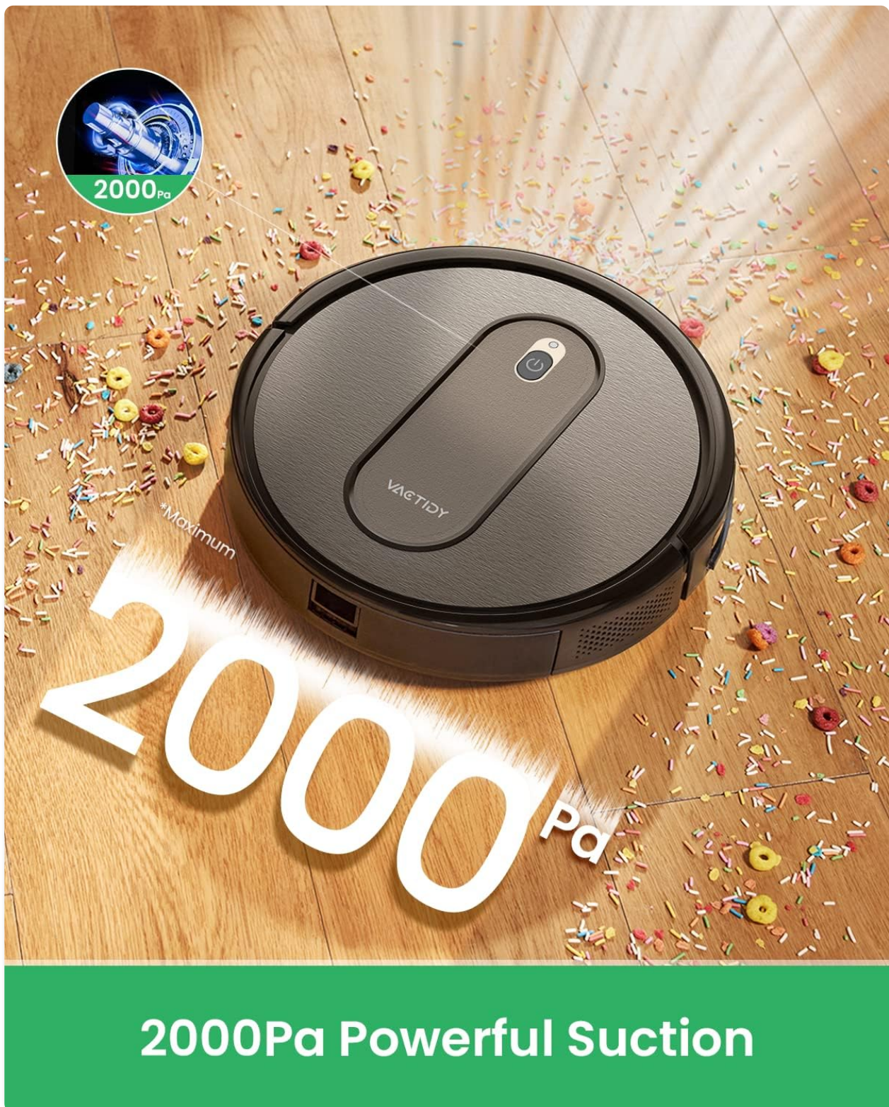
Figure 4.1: Powerful 2000Pa suction.