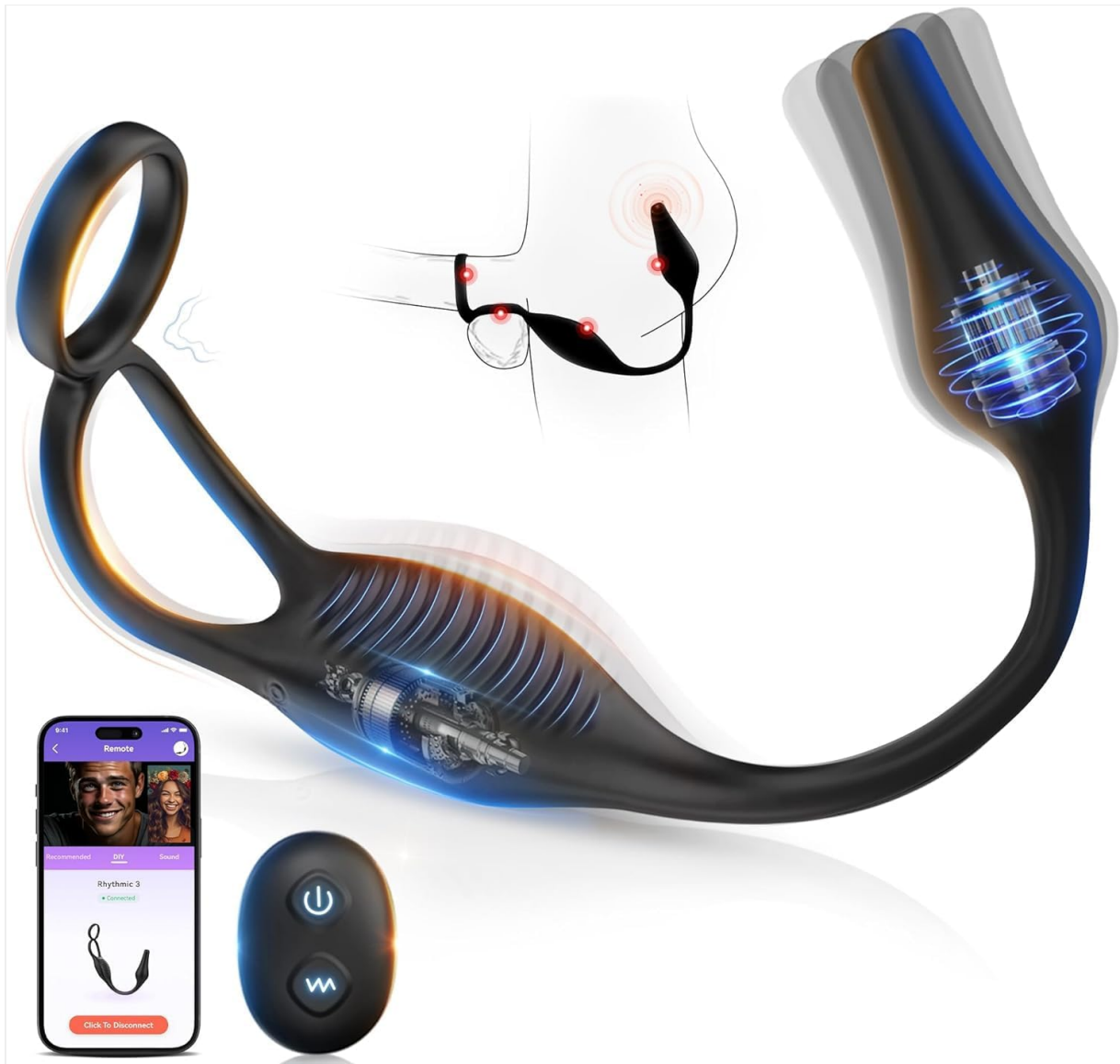
Figure 1: amiahe Prostate Massager with remote control and app interface.