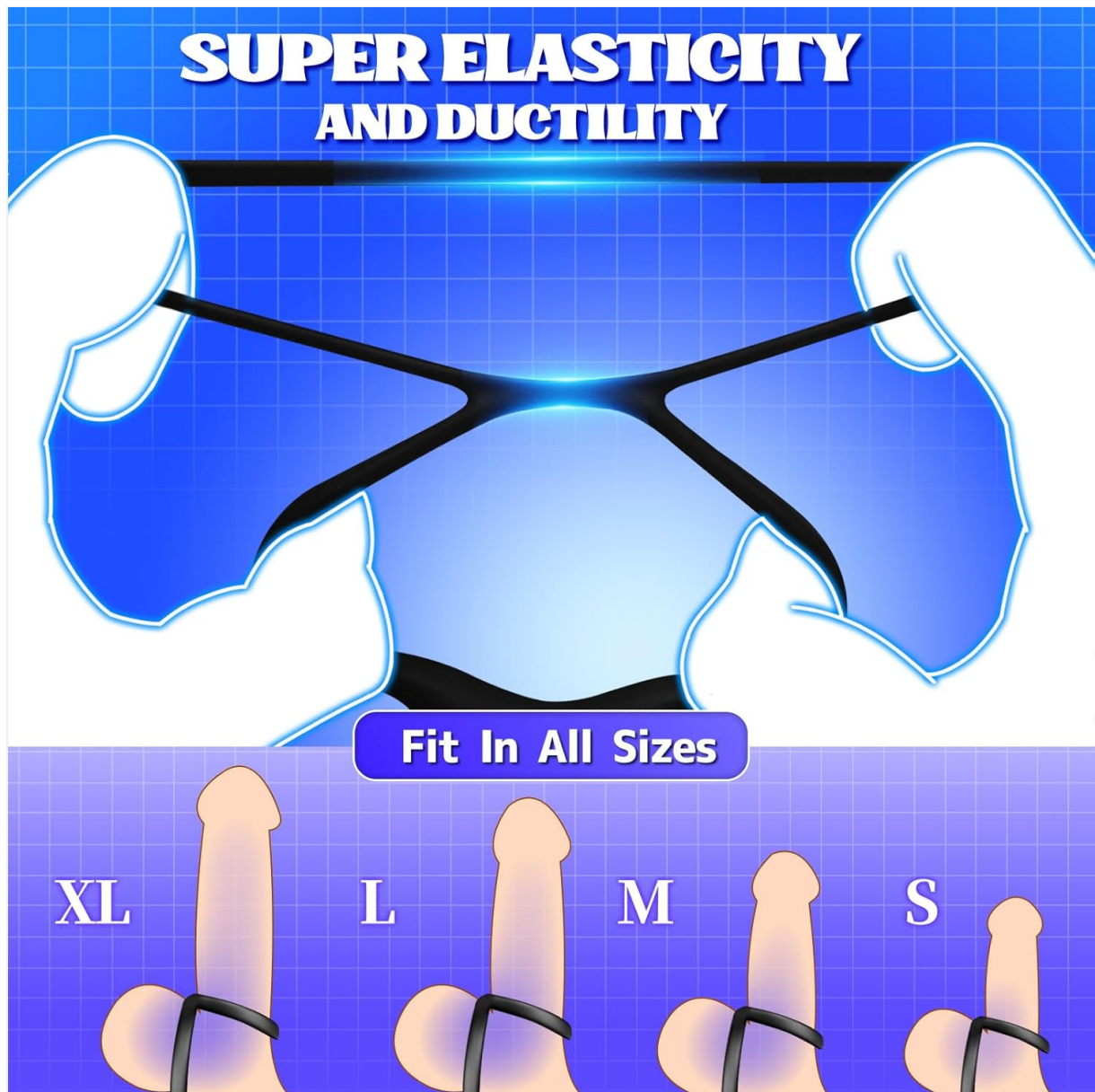
Figure 4: The product's flexible silicone material.