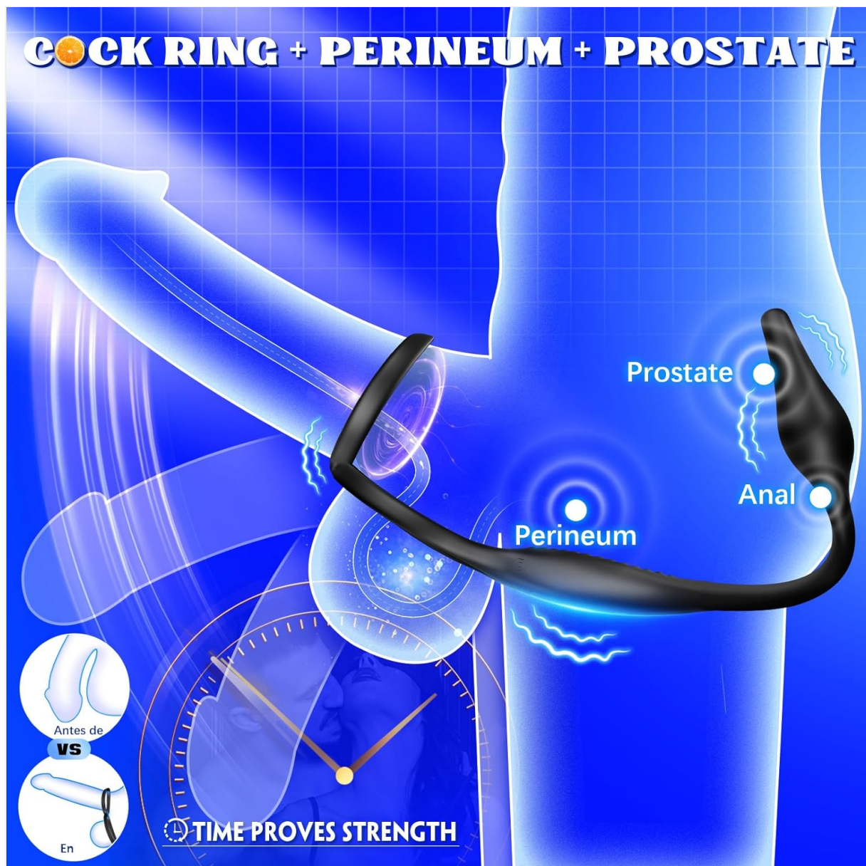
Figure 2: Illustration of the product's multi-functional design targeting prostate, anal, and perineum areas.