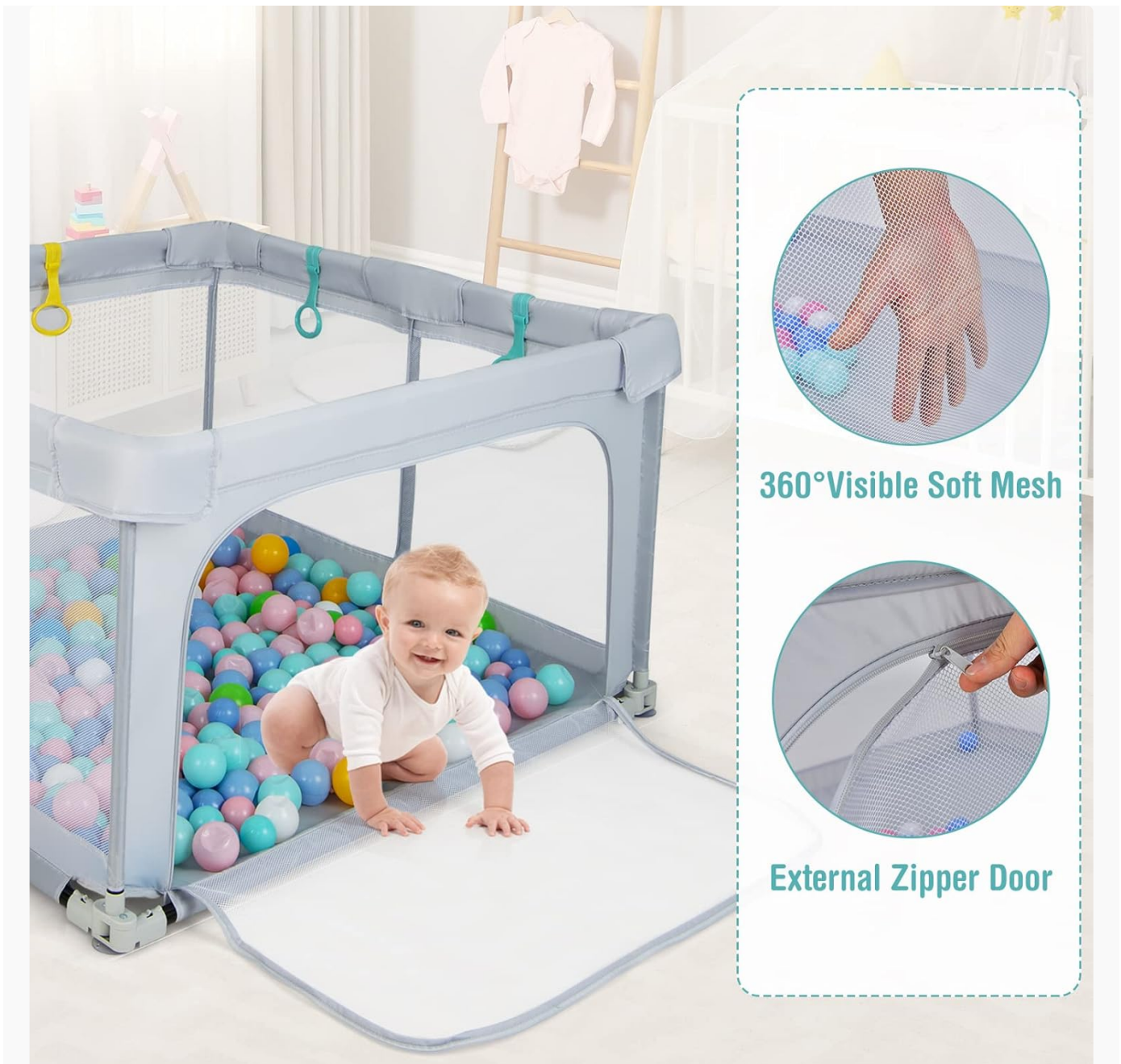
Image 5.1: A baby interacting with the playpen, showcasing the 360° visible soft mesh and the external zipper door for access.