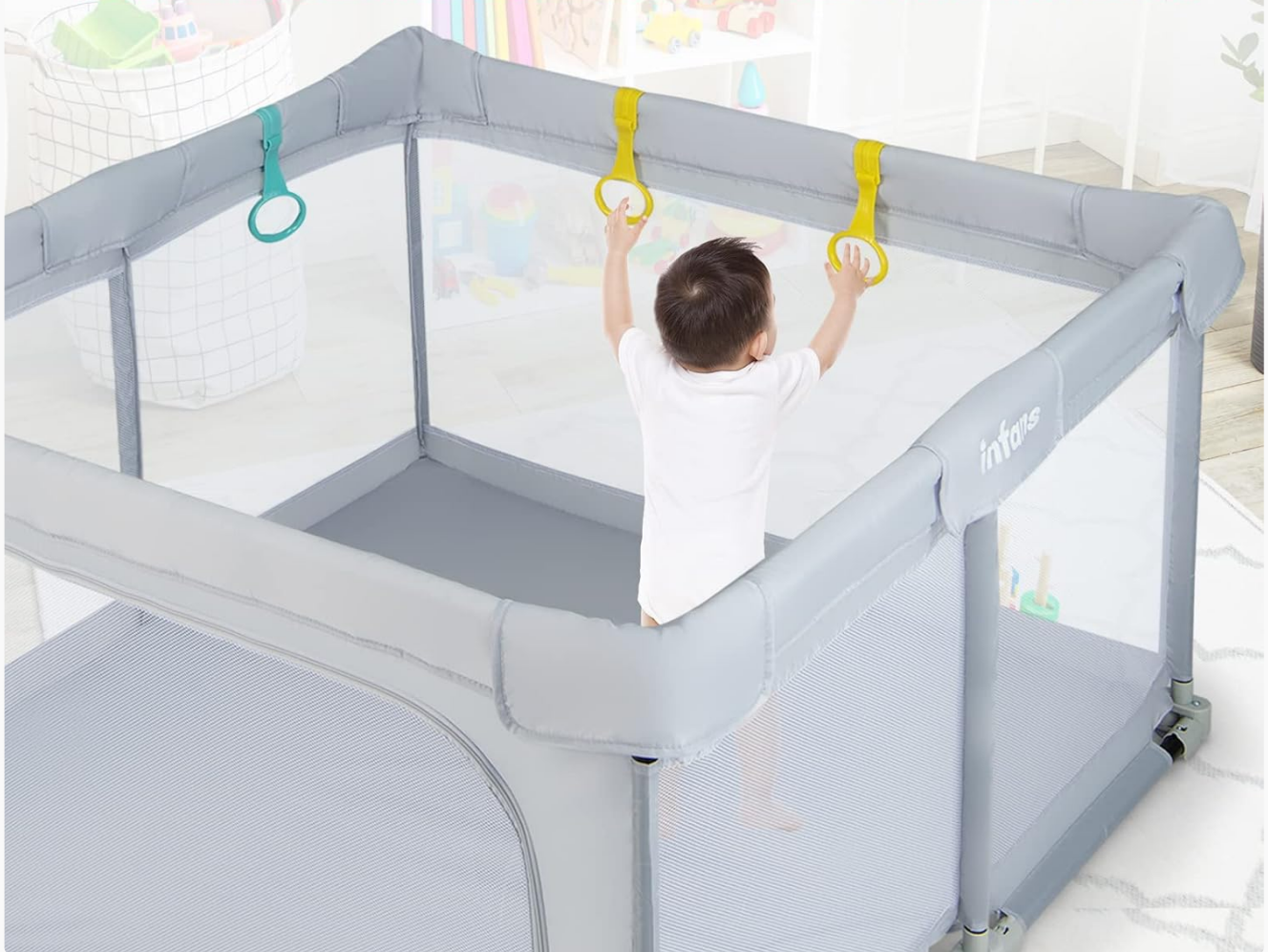
Image 5.2: A toddler utilizing the provided pull rings to stand upright within the playpen, demonstrating a key feature for development.