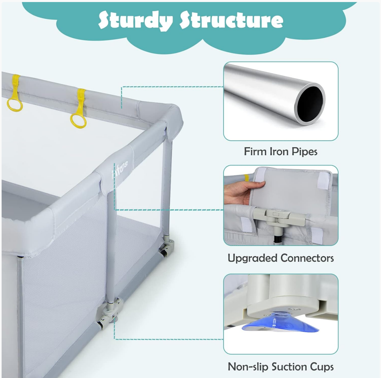
Image 2.1: Detail of the playpen's sturdy structure, highlighting the firm iron pipes, upgraded connectors, and non-slip suction cups for enhanced stability and safety.