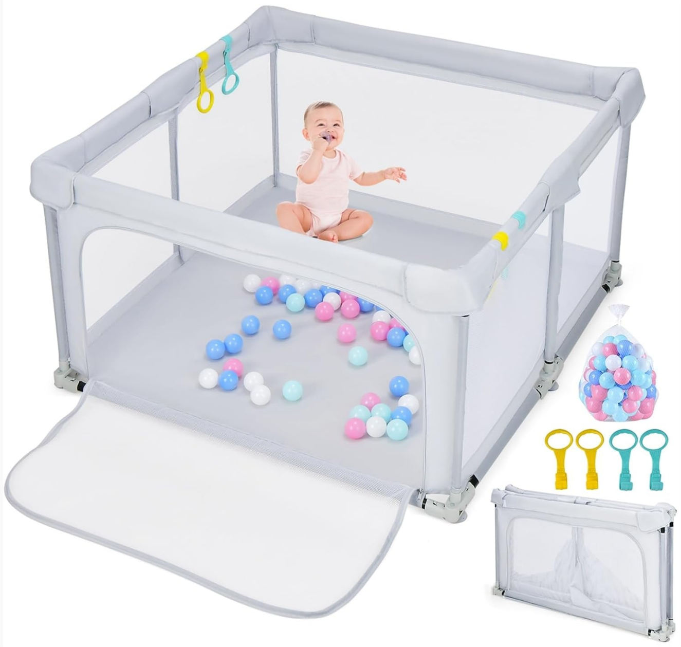
Image 1.1: The INFANS 50"x50" Foldable Baby Playpen, shown in its assembled state, providing a secure play area.